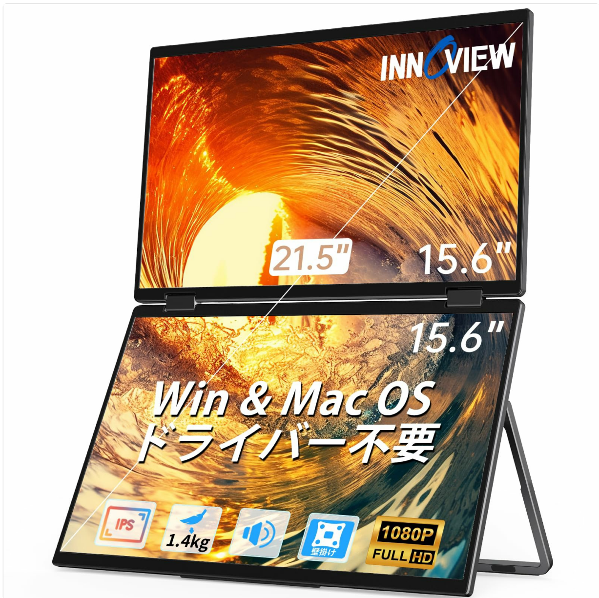
Image: The InnoView 15.6-inch FHD Dual Portable Monitor in a folded, compact state.