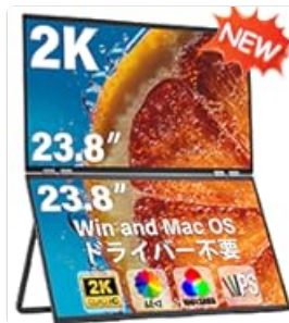
Image: The monitor in shared mode, demonstrating 180° gravity rotation for easy collaboration.

The built-in gravity sensor allows for 180° auto-rotation, making it easy to switch to shared mode for presentations or collaborative work.