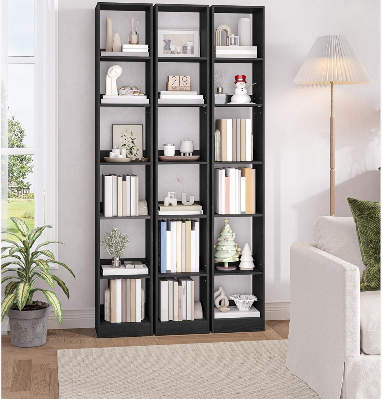
Figure 2: Adjustable shelves allow for customized storage space.