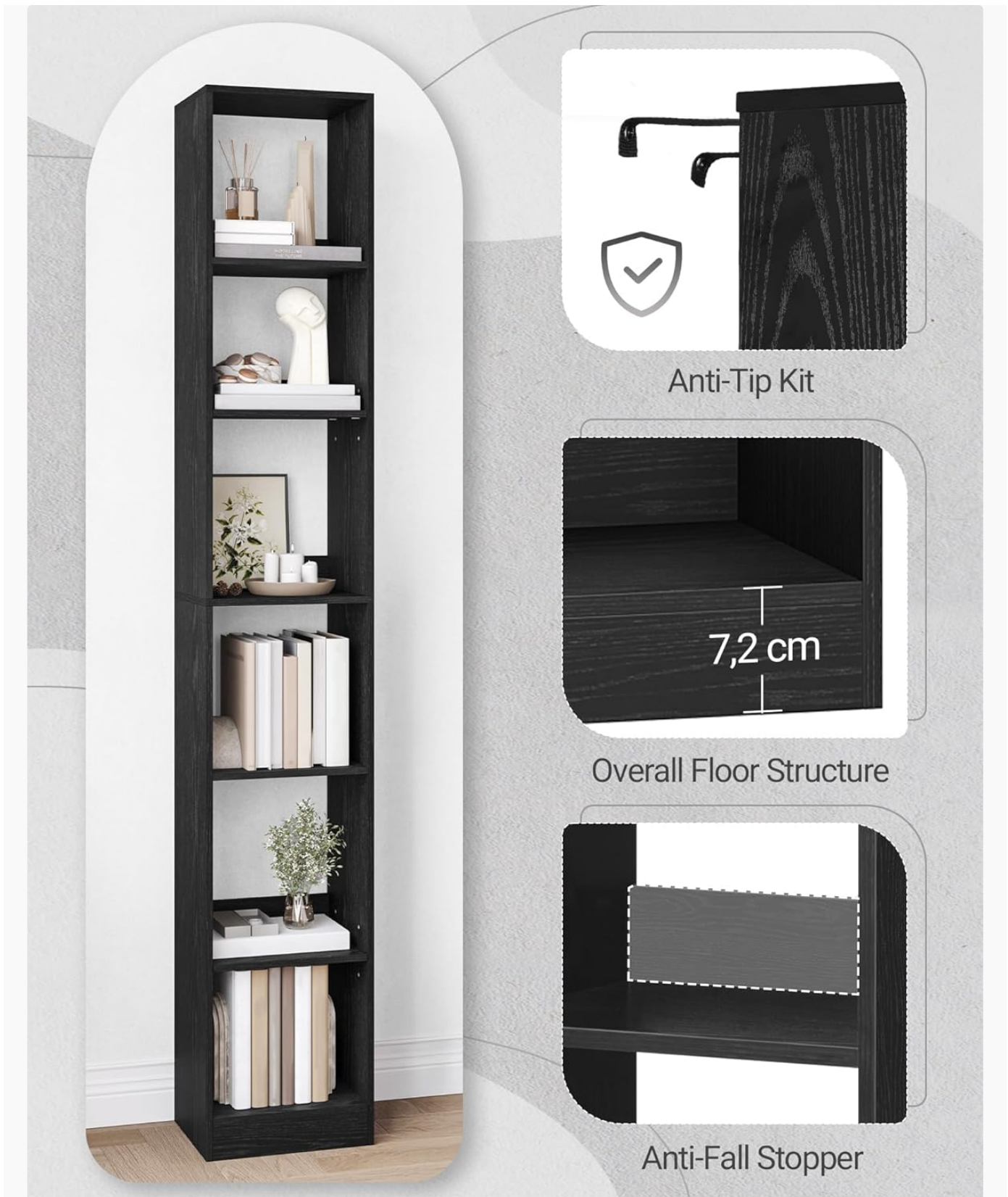
Figure 1: Safety features including the anti-tip kit and anti-fall stopper.