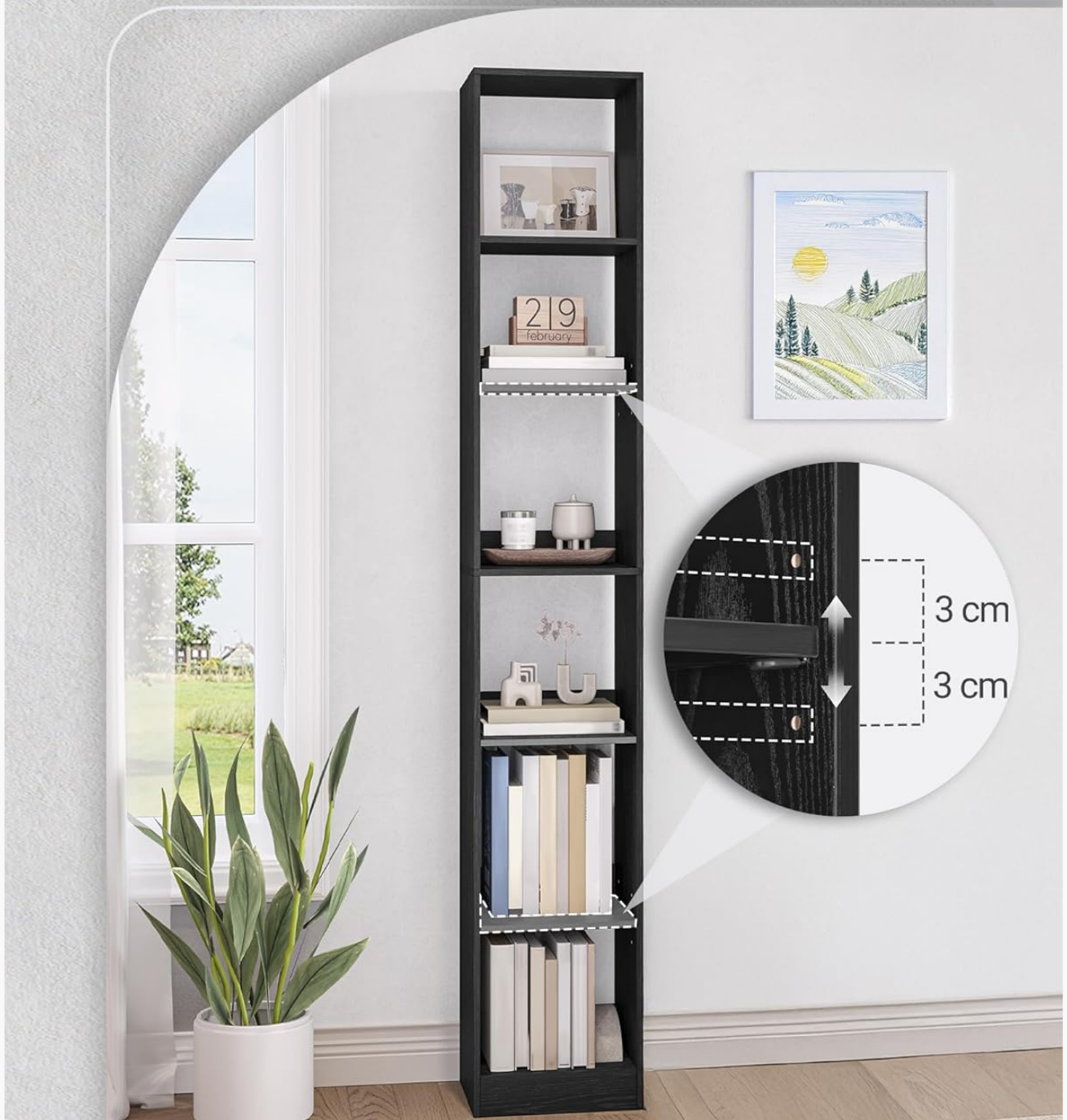
Figure 3: Multi-functional design for diverse storage needs.