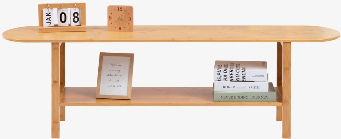
Image 3.1: Detailed view of the TV stand's construction, highlighting rattan sides, bamboo legs, and open shelves.