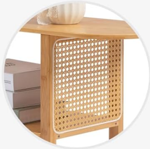
Natural Rattan Sides