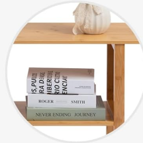
2 Open Shelves