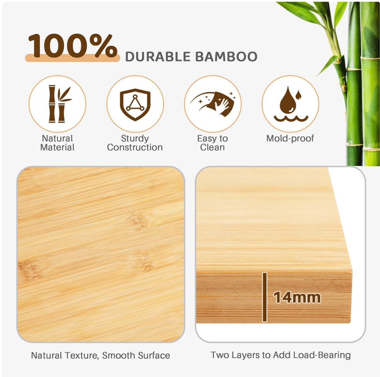
Image 5.1: Detail of the durable bamboo construction, highlighting its natural texture and thickness.