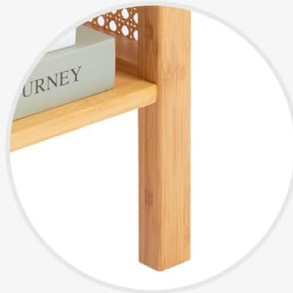
Sturdy Bamboo Legs