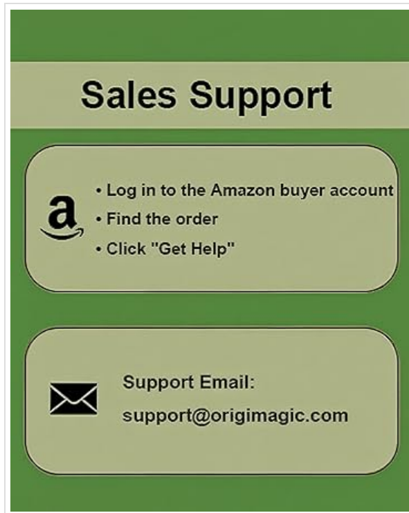
Image showing sales support information, including instructions to log in to the Amazon buyer account, find the order, click "Get Help," and the support email address: support@origimagic.com.