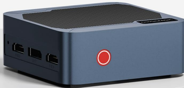
Image summarizing the key features of the Origimagic C2 Neo Mini PC, such as Intel N95 processor, 12GB LPDDR5 RAM, 512GB M.2 PCIe 3.0 SSD, Wi-Fi 5, Bluetooth 5.0, dual 2.5G RJ45 LAN, USB 3.2 Gen1, and triple display support.