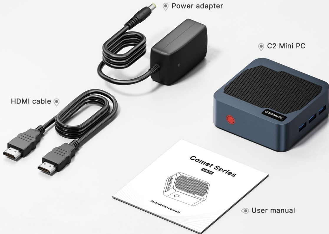
Image displaying the contents of the Origimagic C2 Neo Mini PC package, including the mini PC, power adapter, HDMI cable, and user manual.