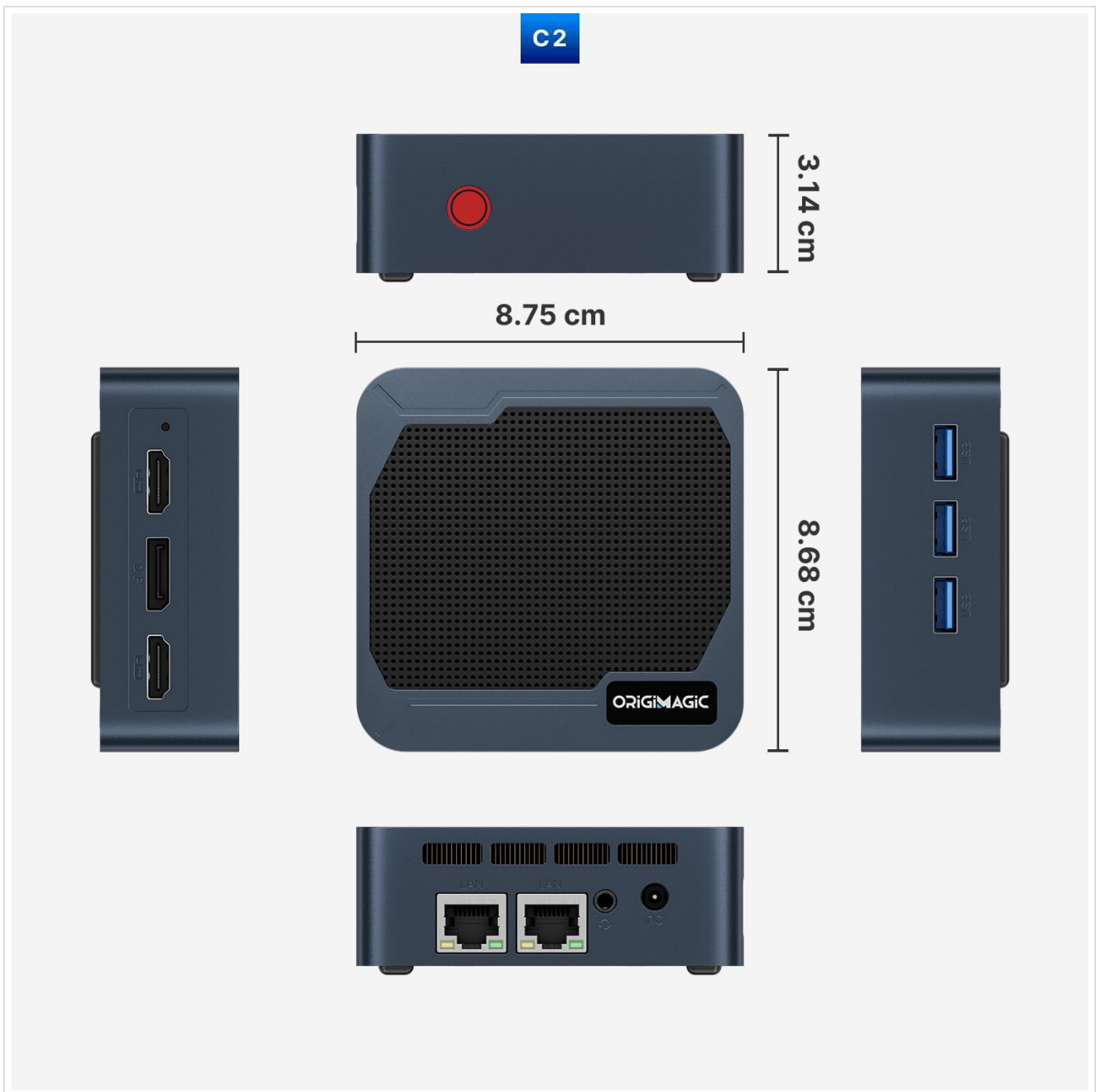
Image showing the dimensions of the Origimagic C2 Neo Mini PC from multiple angles. The top view shows 8.75 cm width and 8.68 cm depth. The side view shows 3.14 cm height.