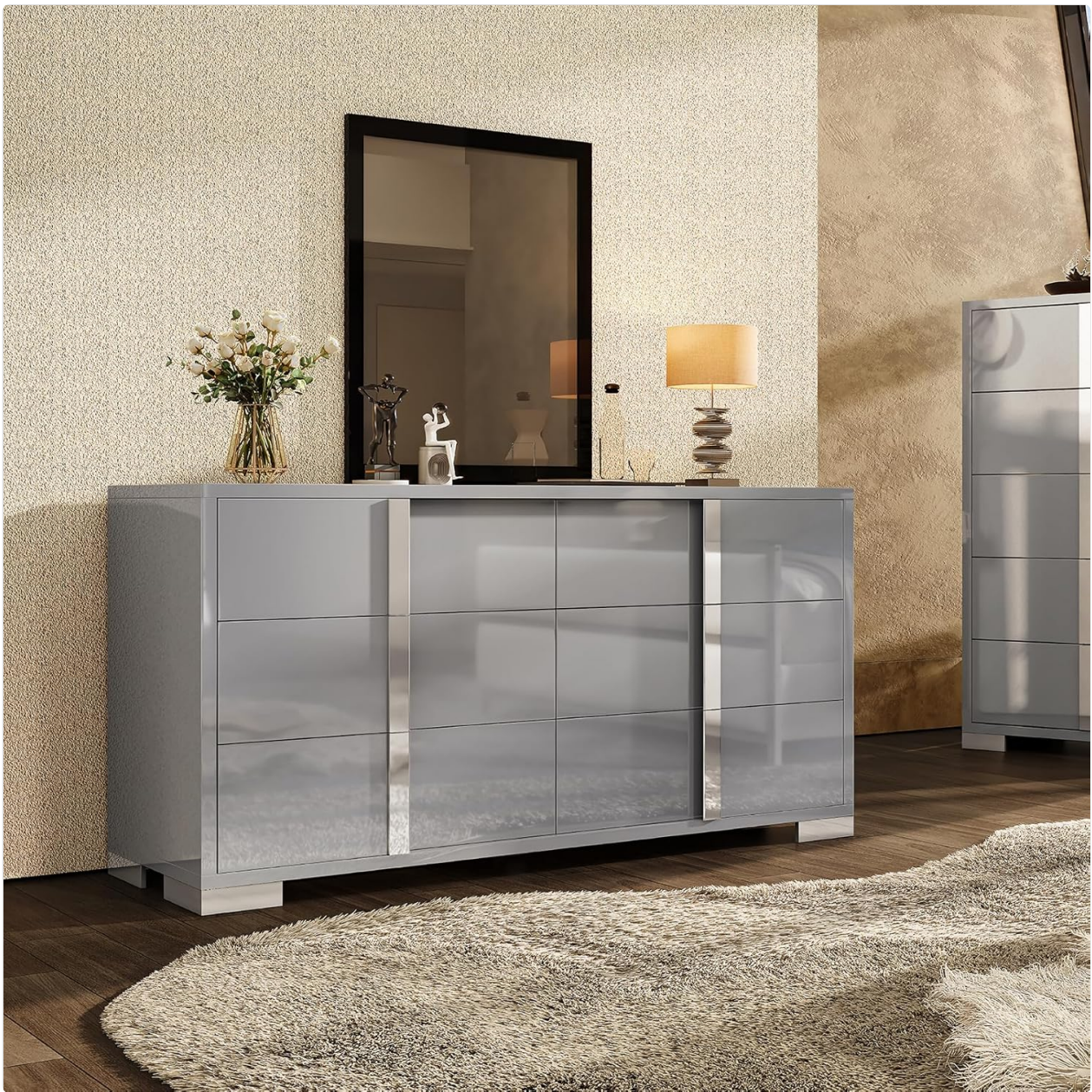
Image 2.1: The AMERLIFE 54-inch High Gloss 6-Drawer Dresser in a bedroom setting.