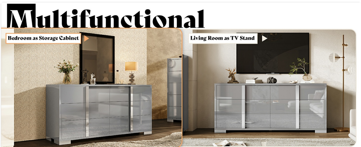
Image 5.3: Demonstrating the dresser's versatility as both a bedroom storage cabinet and a living room TV stand.

Video 5.1: Official product video demonstrating the features of the AMERLIFE High Gloss Dresser CNS068, including its