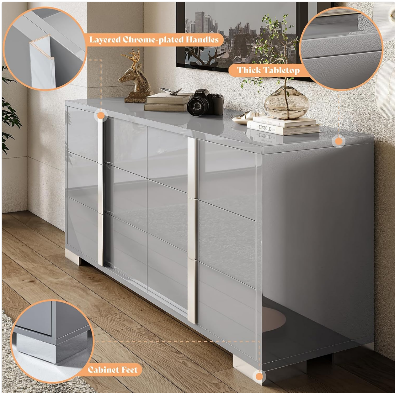
Image 8.1: Detailed view of the dresser's layered chrome-plated handles, thick tabletop, and cabinet feet.