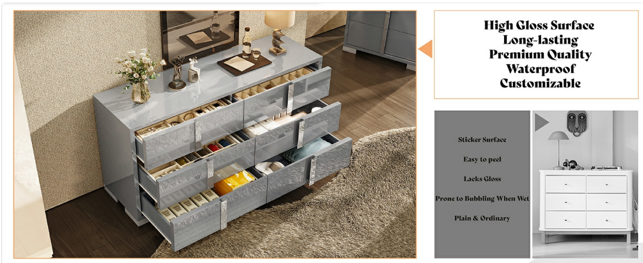
Image 6.1: Highlighting the durable, high-gloss surface of the dresser.