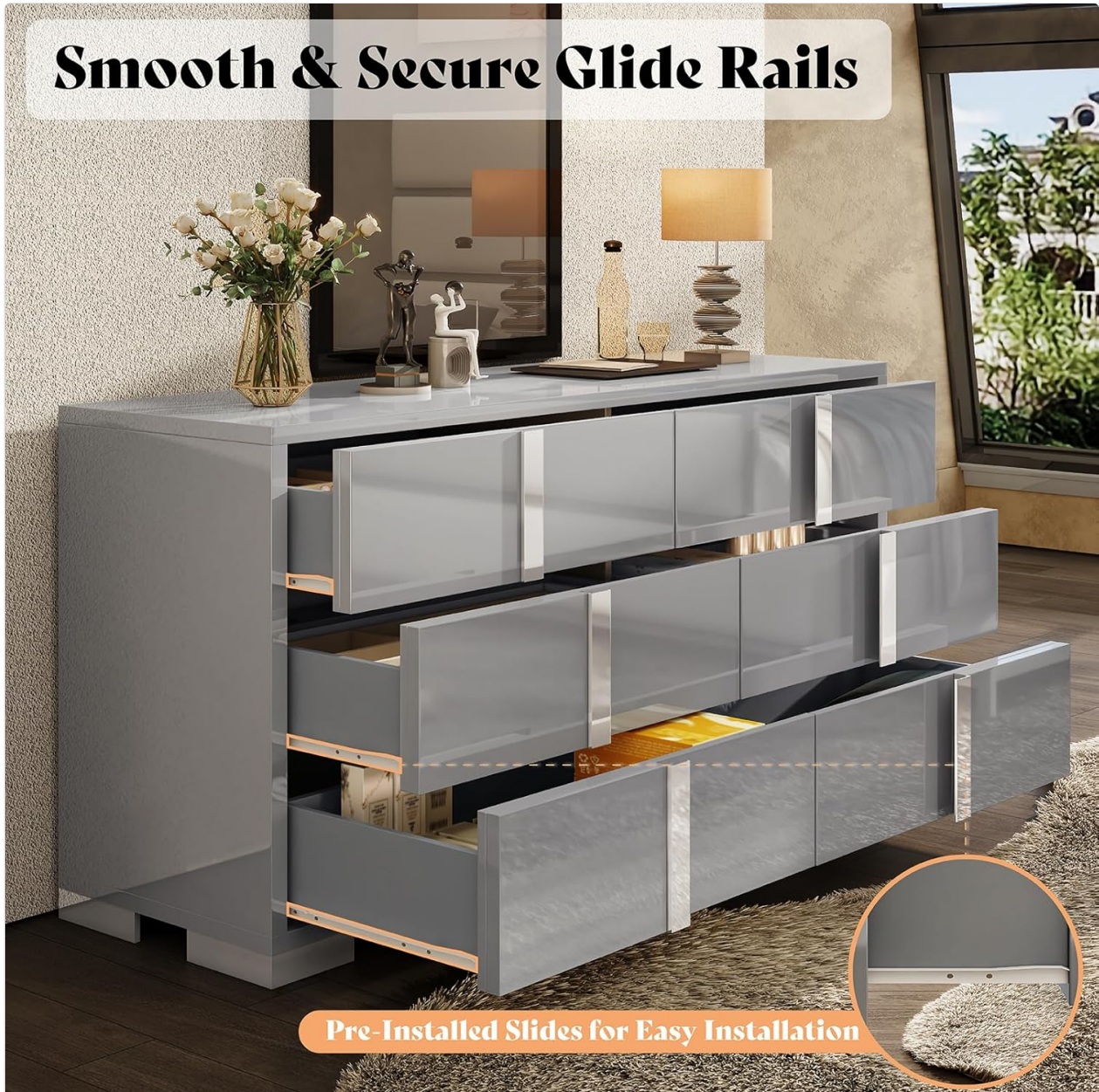
Image 5.1: Detail of the smooth and secure glide rails for drawers.

The drawers are equipped with pre-installed smooth slide rails for easy opening and closing. To open a drawer, gently pull the silver grooved handle. To close, push the drawer firmly until it is fully seated. The anti-slip device on the rails prevents accidental over-extension.