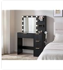
Image 9.1: Visual guide to the dresser's safety features, including the anti-tip device.