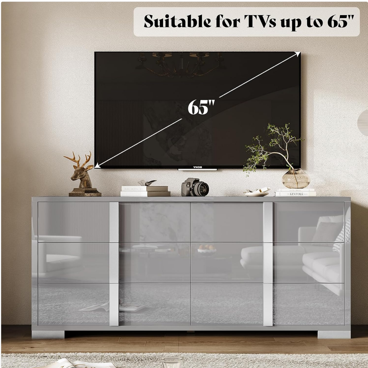
Image 5.2: The dresser functioning as a TV stand, supporting a 65-inch television.