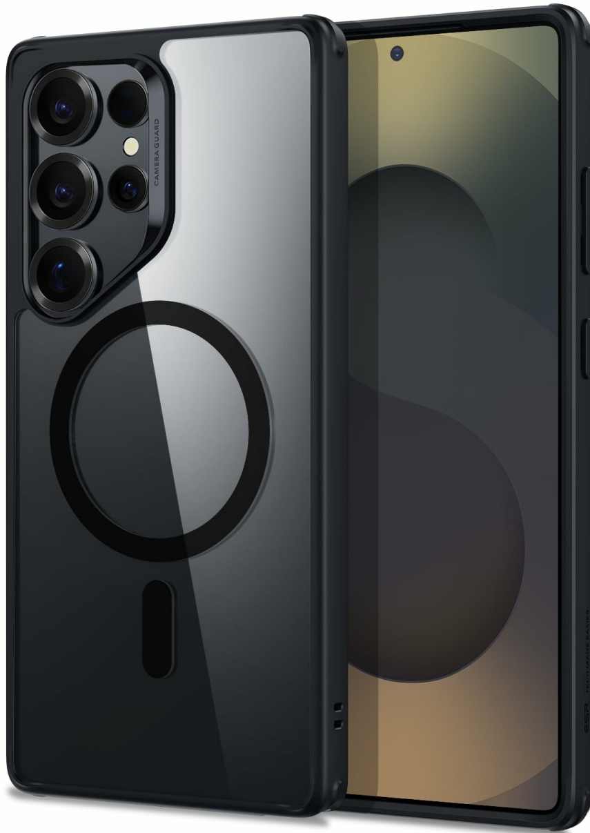
Image 1.1: ESR HaloLock Classic Hybrid Case in Clear Black for Samsung Galaxy S25 Ultra.