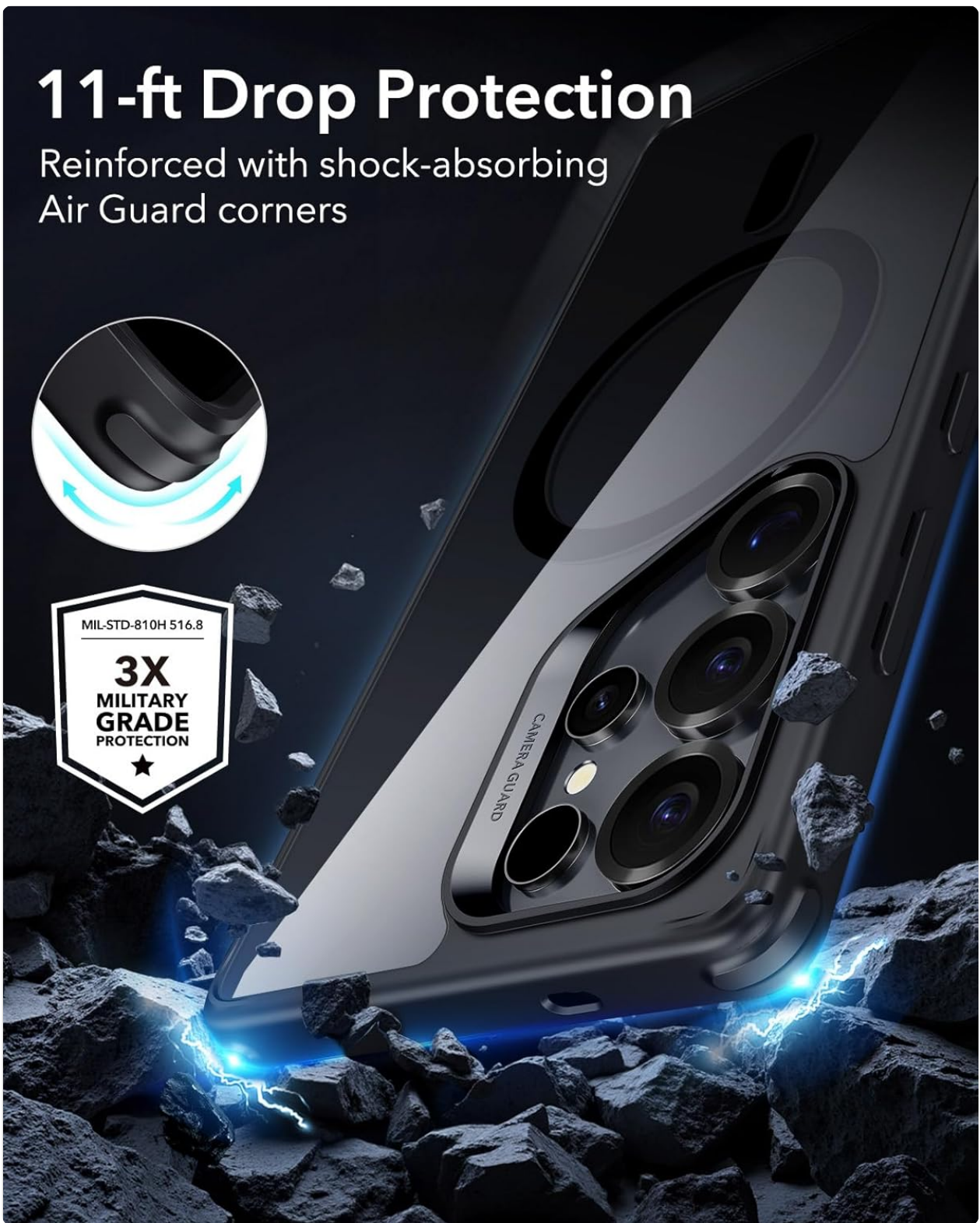
Image 2.2: Visual representation of the case's 11-ft drop protection, highlighting reinforced Air Guard corners.