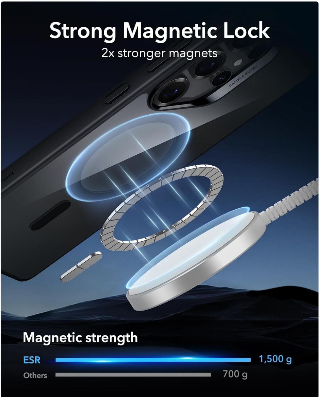
Image 2.1: Illustration of the strong magnetic lock, demonstrating 1,500g of holding force compared to standard 700g magnets.