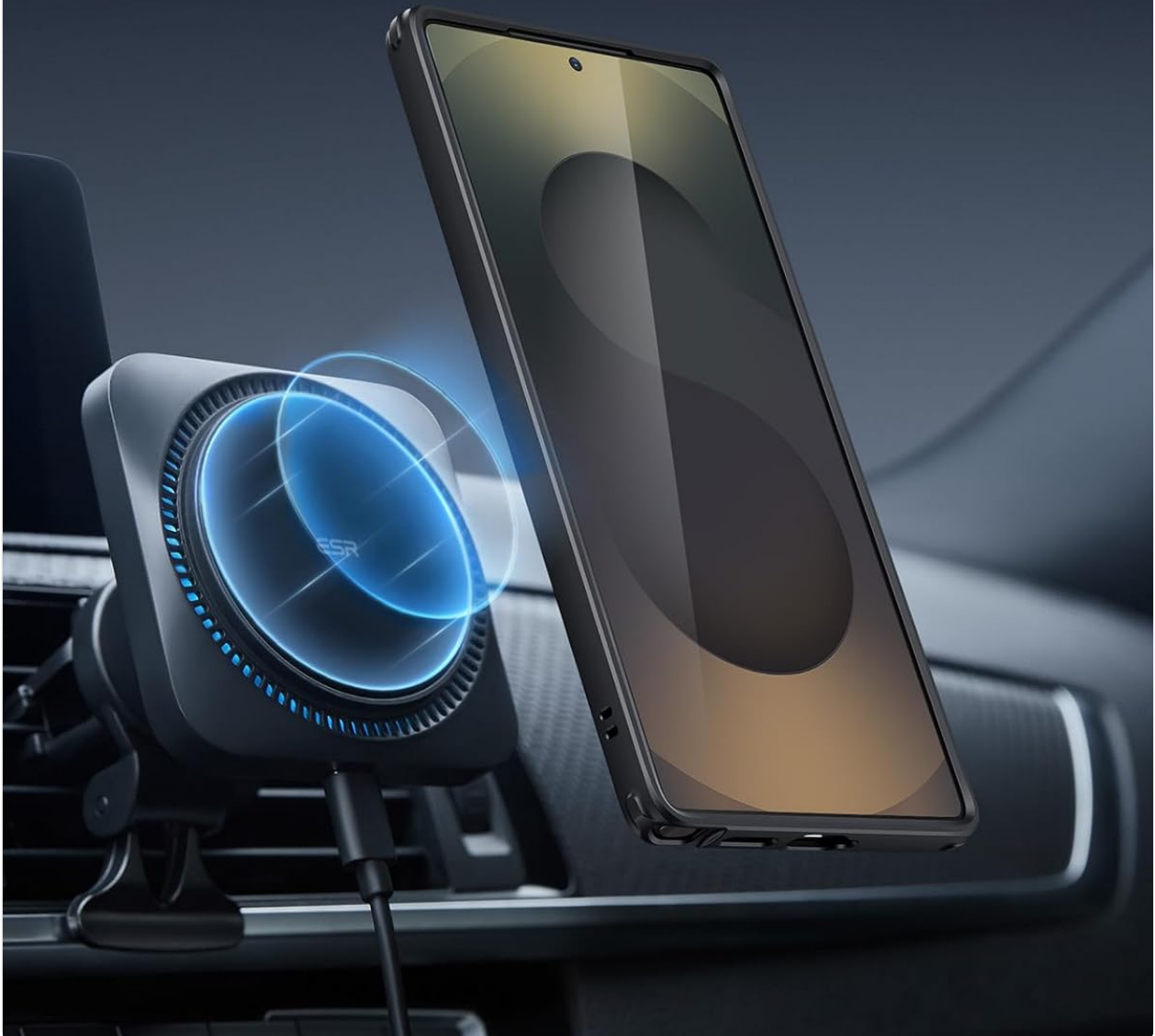
Image 4.2: A Samsung Galaxy S25 Ultra in its ESR HaloLock case mounted on a car vent, demonstrating secure MagSafe attachment.

Built-in magnetic ring lets you attach a variety of magnetic accessories