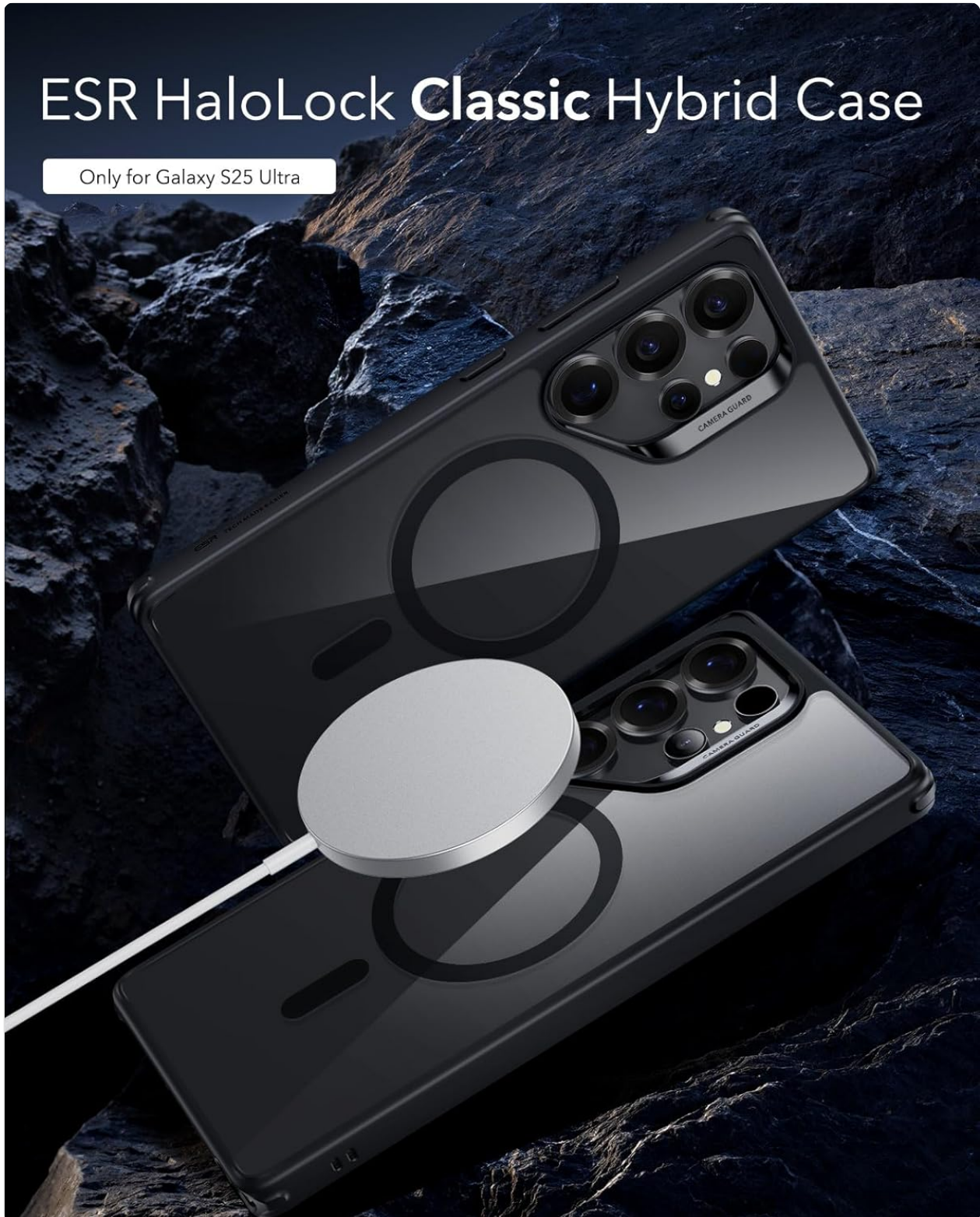
Image 4.1: The ESR case on a Samsung Galaxy S25 Ultra with a MagSafe wireless charger securely attached to the magnetic ring.

The ESR HaloLock Classic Hybrid Case features a powerful magnetic ring that enables seamless compatibility with MagSafe accessories. Simply align your MagSafe charger, wallet, or car mount with the magnetic ring on the back of the case for a secure and efficient connection.