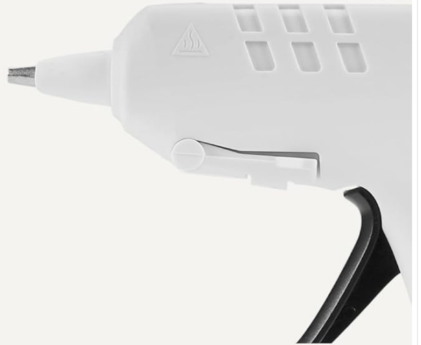
Image 1.1: The Amazon Basics Hot Glue Gun highlighting its key features.

Fast drying and compatible with multiple surface types