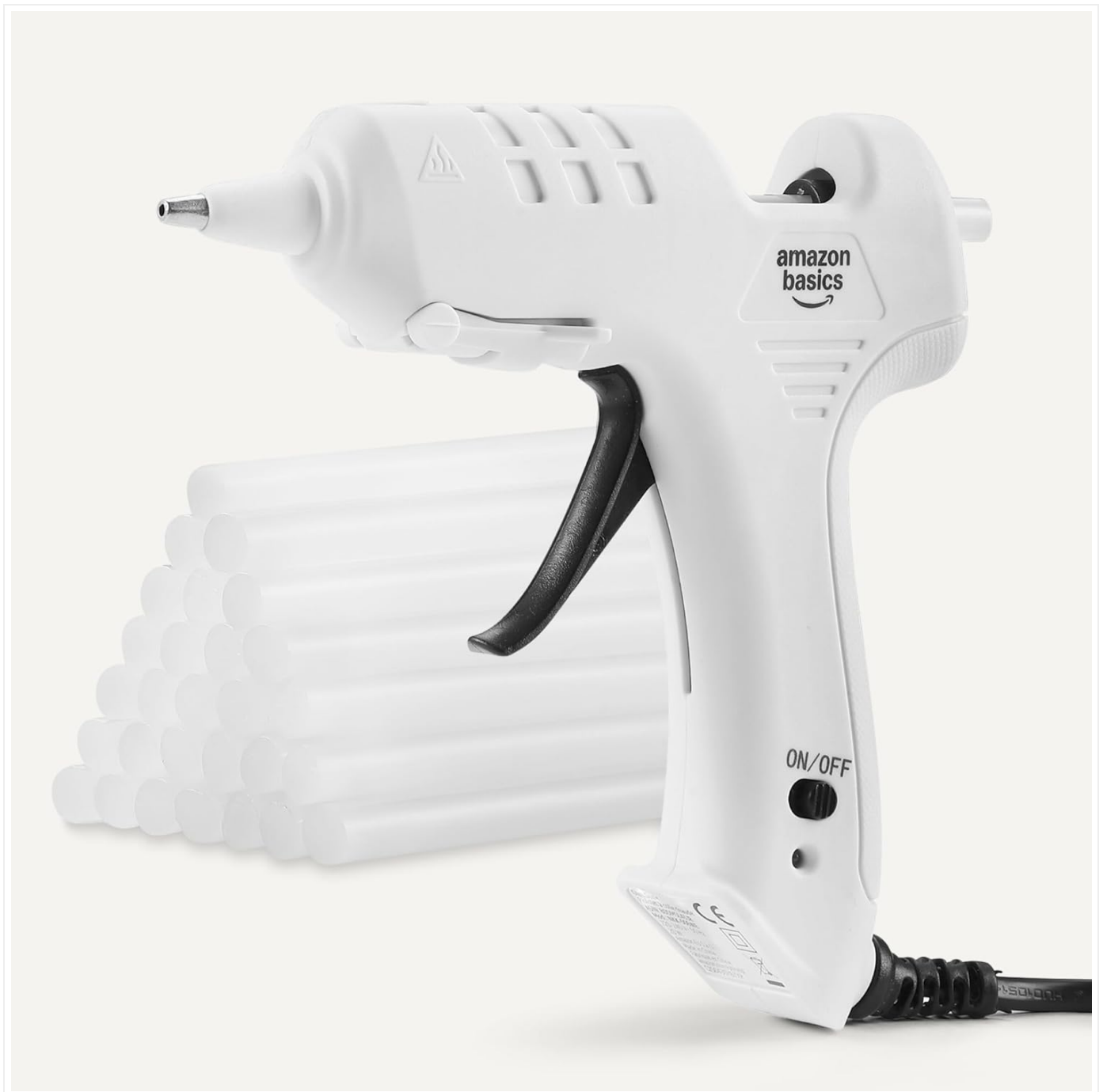
Image 2.1: The hot glue gun kit, including the glue gun and a supply of glue sticks.

6. Preheat: Allow the glue gun to preheat for 1-2 minutes. The nozzle will become hot during this time.