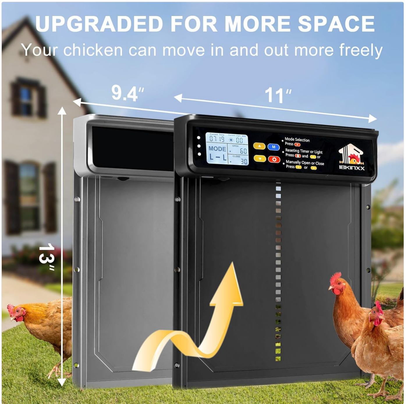
Figure 2: Upgraded Door Dimensions for More Space