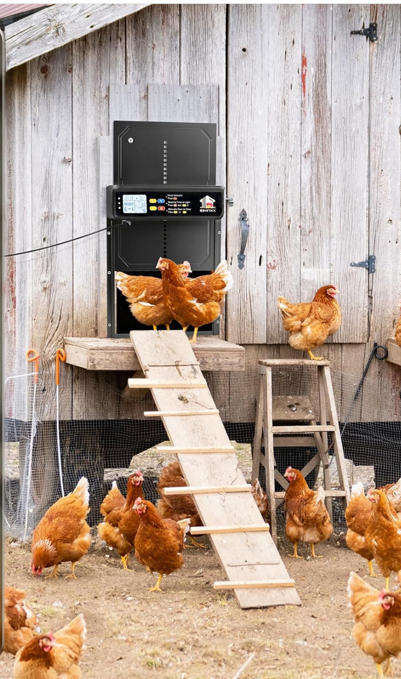
Figure 7: Backup Manual and Remote Control Options