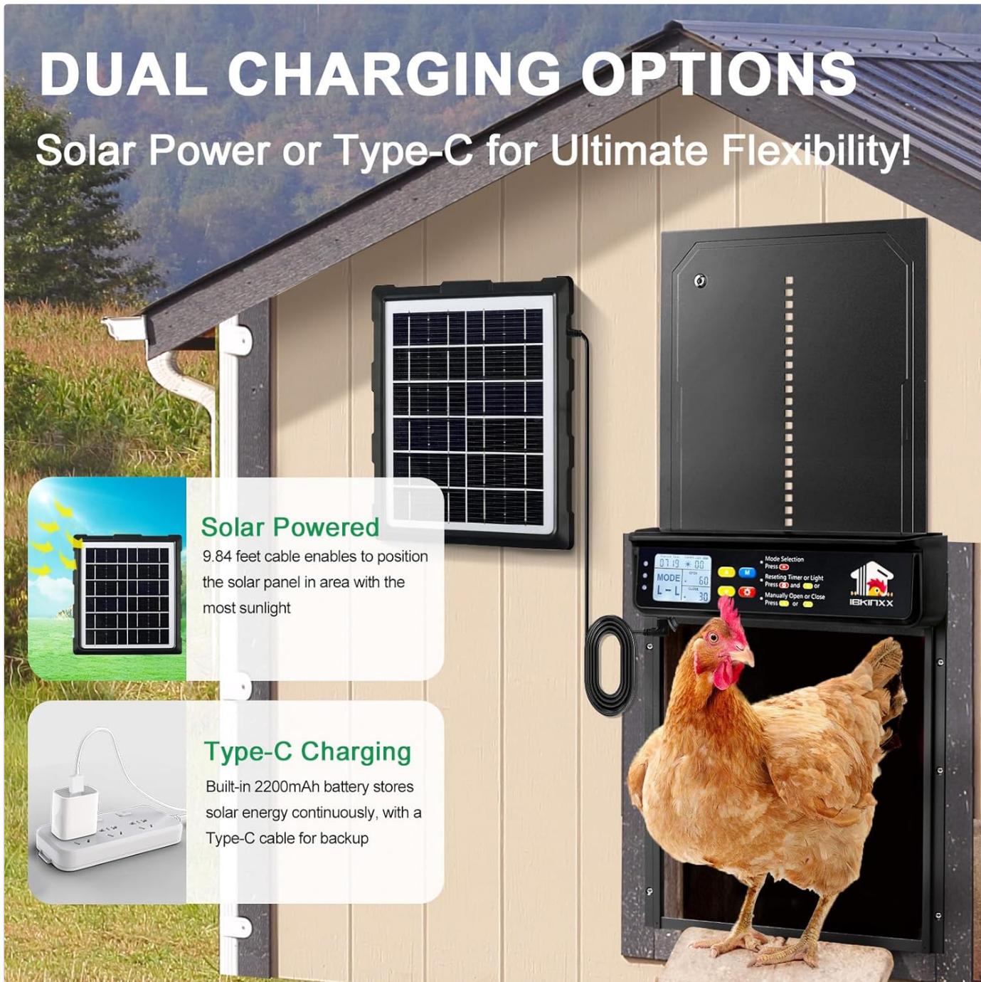
Figure 8: Dual Charging Options

Solar Power or Type-C for Ultimate Flexibility!