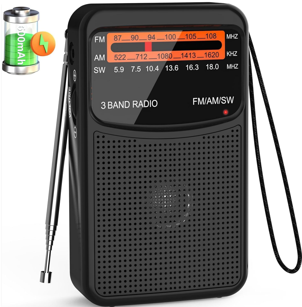
Image: Front view of the Jazmm Portable AM FM SW Radio, showing the speaker grille, tuning dial, and band indicators.