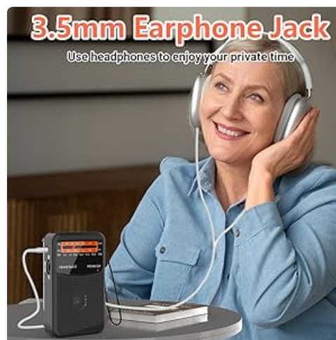
Image: A person wearing headphones, with the Jazmm radio shown connected via its 3.5mm earphone jack for private listening.

For private listening, plug standard 3.5mm earphones (not included) into the earphone jack located on the side of the radio. The internal speaker will automatically mute when earphones are connected.