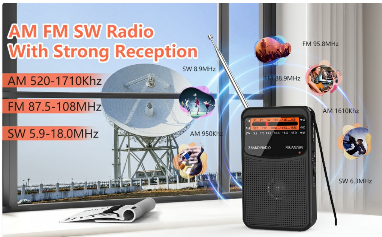
Image: Diagram illustrating the radio's reception range for AM (520-1710KHz), FM (87.5-108MHz), and SW (5.9-18.0MHz) bands, with the antenna extended.