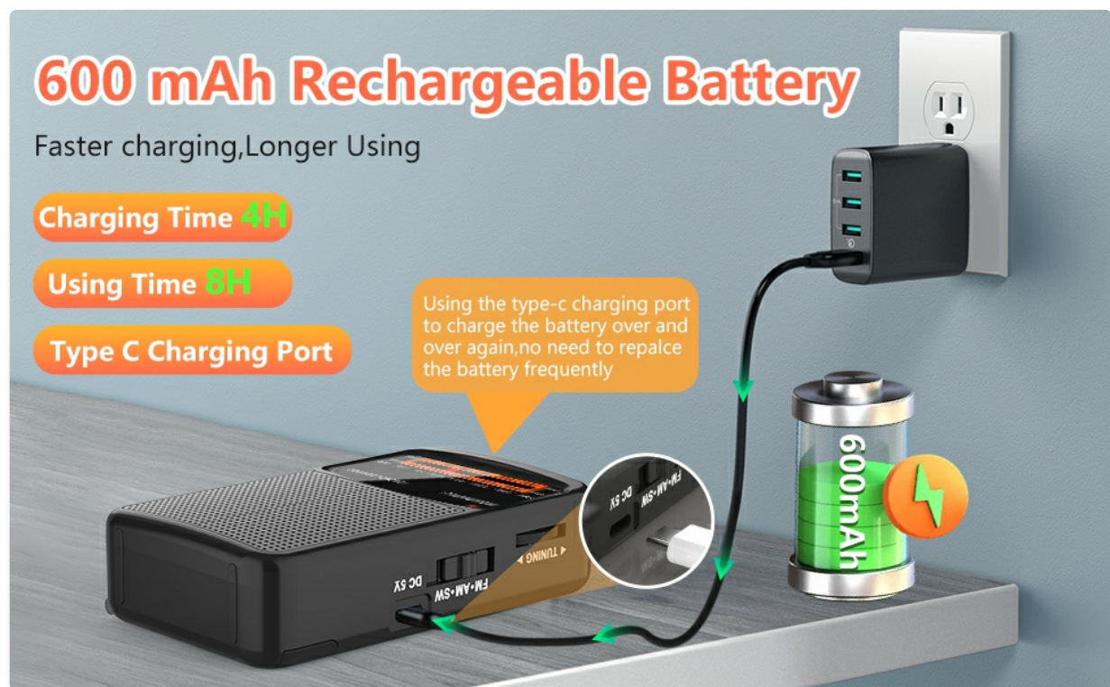
Image: Illustration showing the Jazmm radio being charged via its Type-C port, with an estimated charging time of 4 hours and usage time of 8 hours.