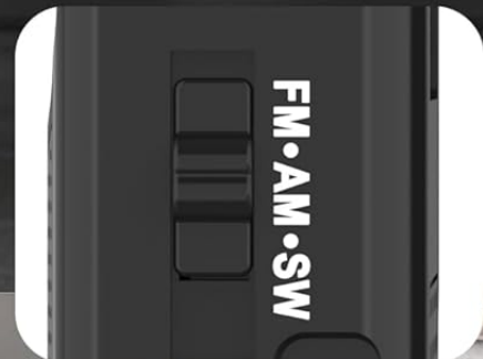
AM FM SW Band

Image: Close-up view of the radio's controls, highlighting the volume knob, tuning knob, and the AM/FM/SW band selector switch.