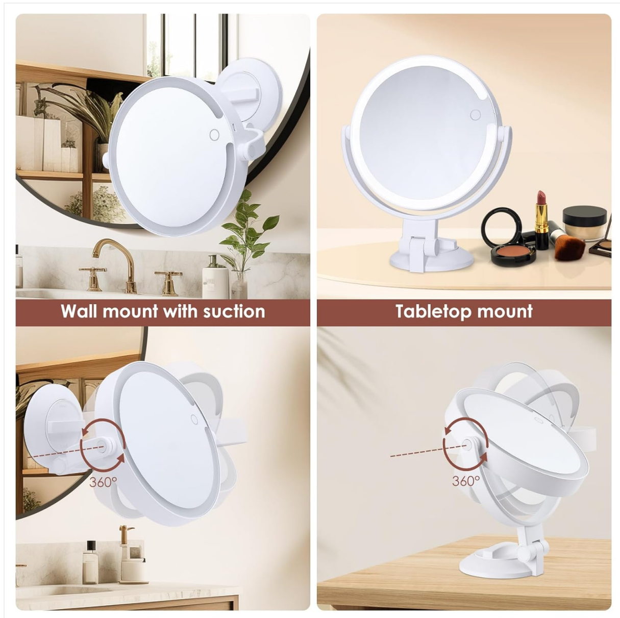
Image: The LUKYMIRO M30 mirror configured for wall mounting with suction cup and as a tabletop mirror.

Note: For optimal adhesion, periodically re-tighten the suction cup nut (e.g., every 2-3 months). The suction cup is washable; do not wipe it with tissue or cloth as this may shorten its lifespan.