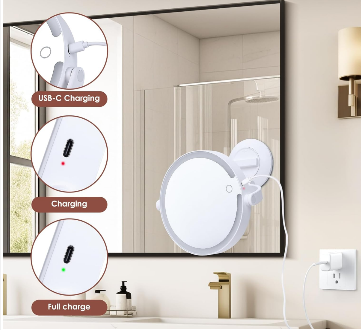
Image: The LUKYMIRO M30 mirror illustrating its USB-C charging port and the red/green indicator lights for charging status.