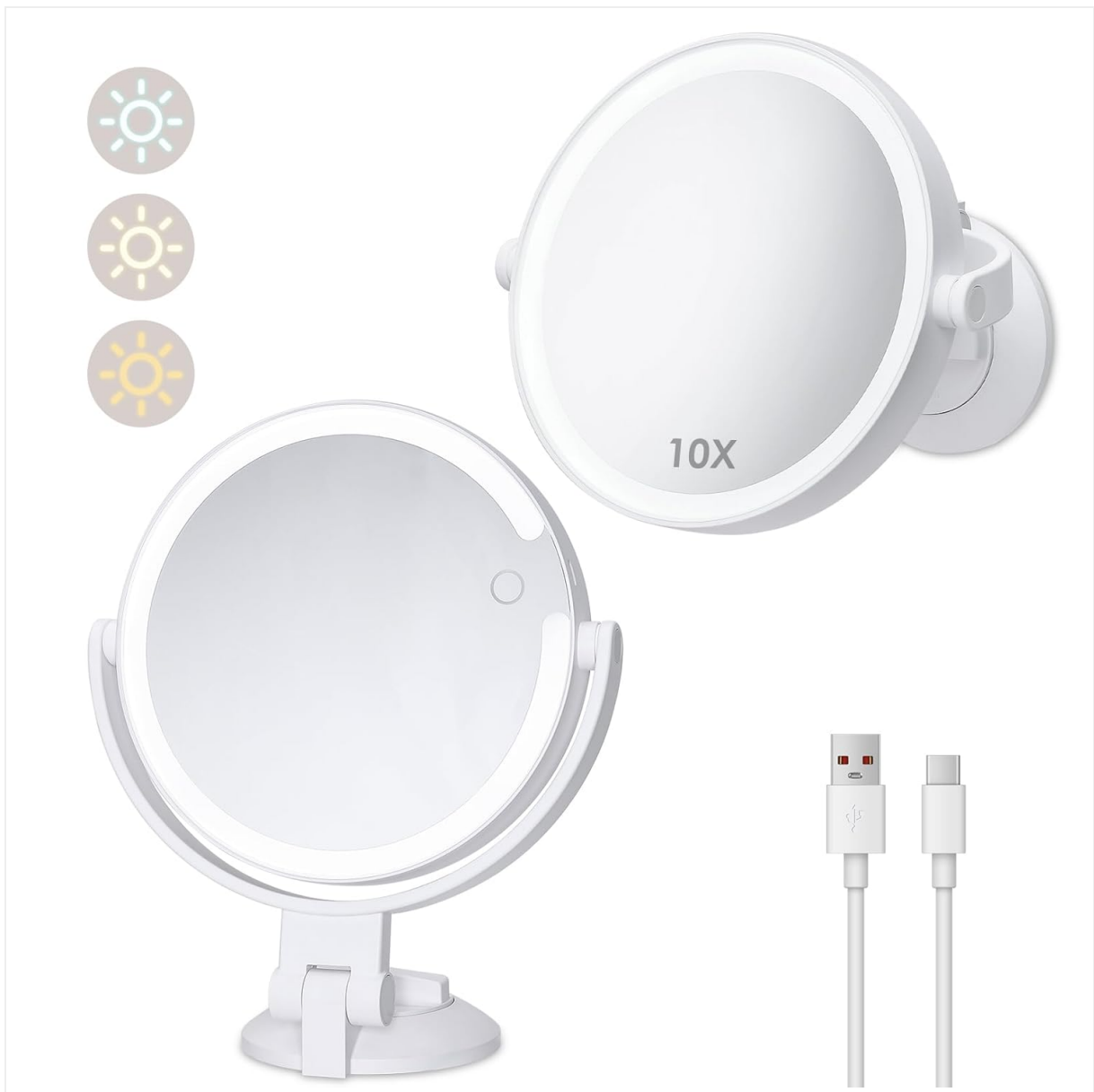
Image: LUKYMIRO M30 mirror in tabletop and wall-mounted positions, alongside its USB-C charging cable.