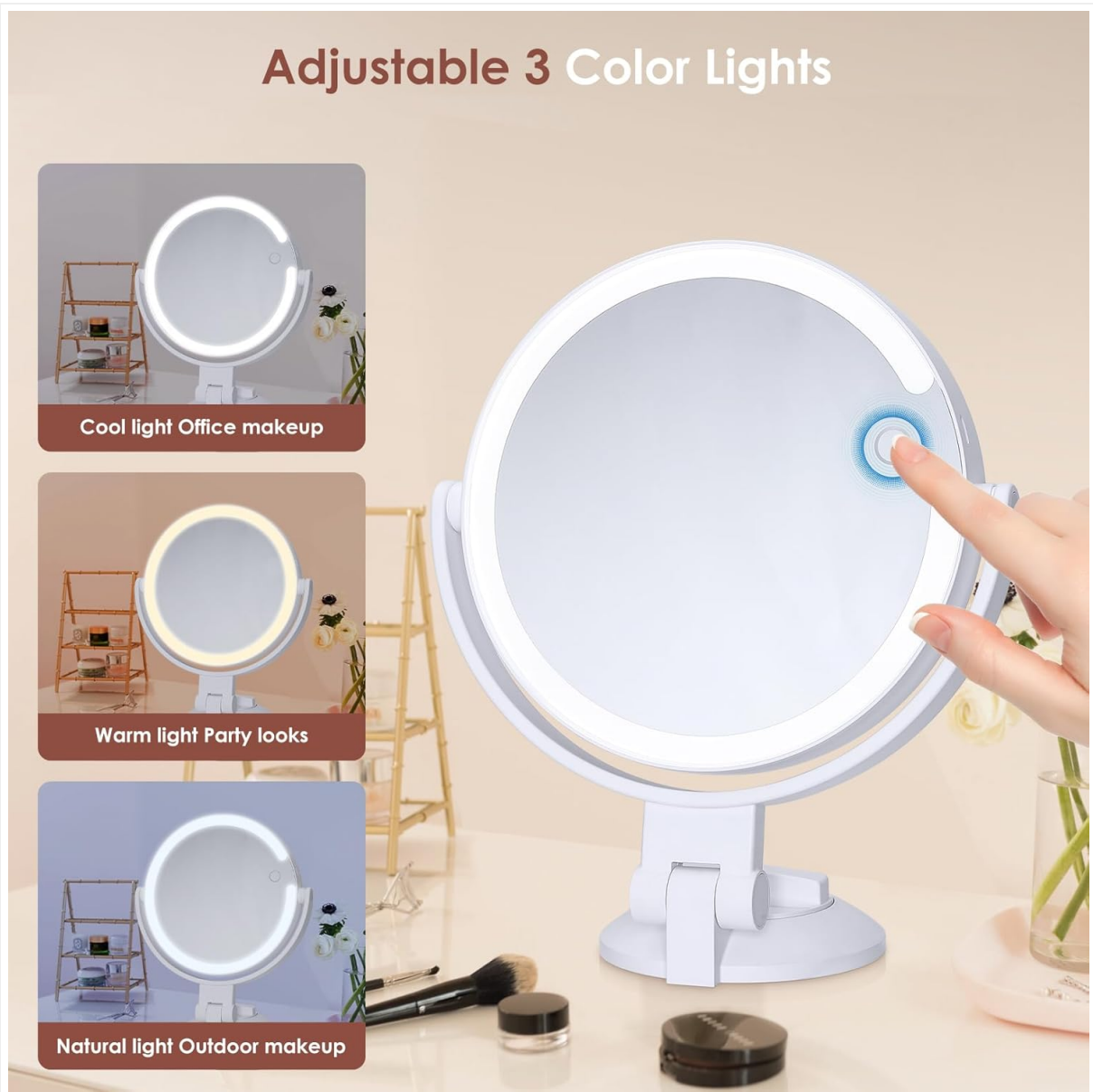
Image: The LUKYMIRO M30 mirror displaying its three adjustable light color settings: cool light, warm light, and natural light.