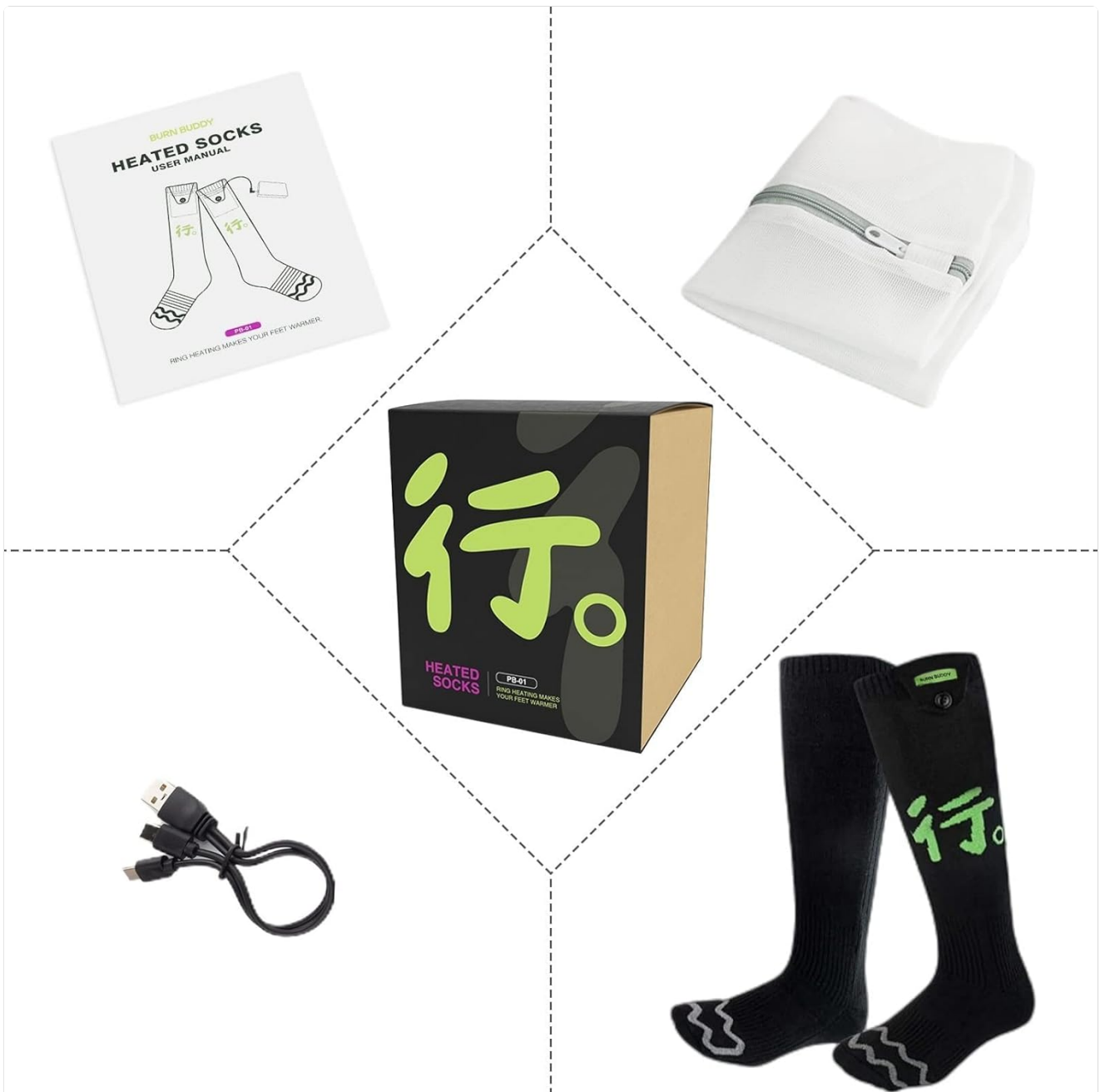
Image: Overview of items included in the product package, such as socks, batteries, charging cable, laundry bag, and user manual.