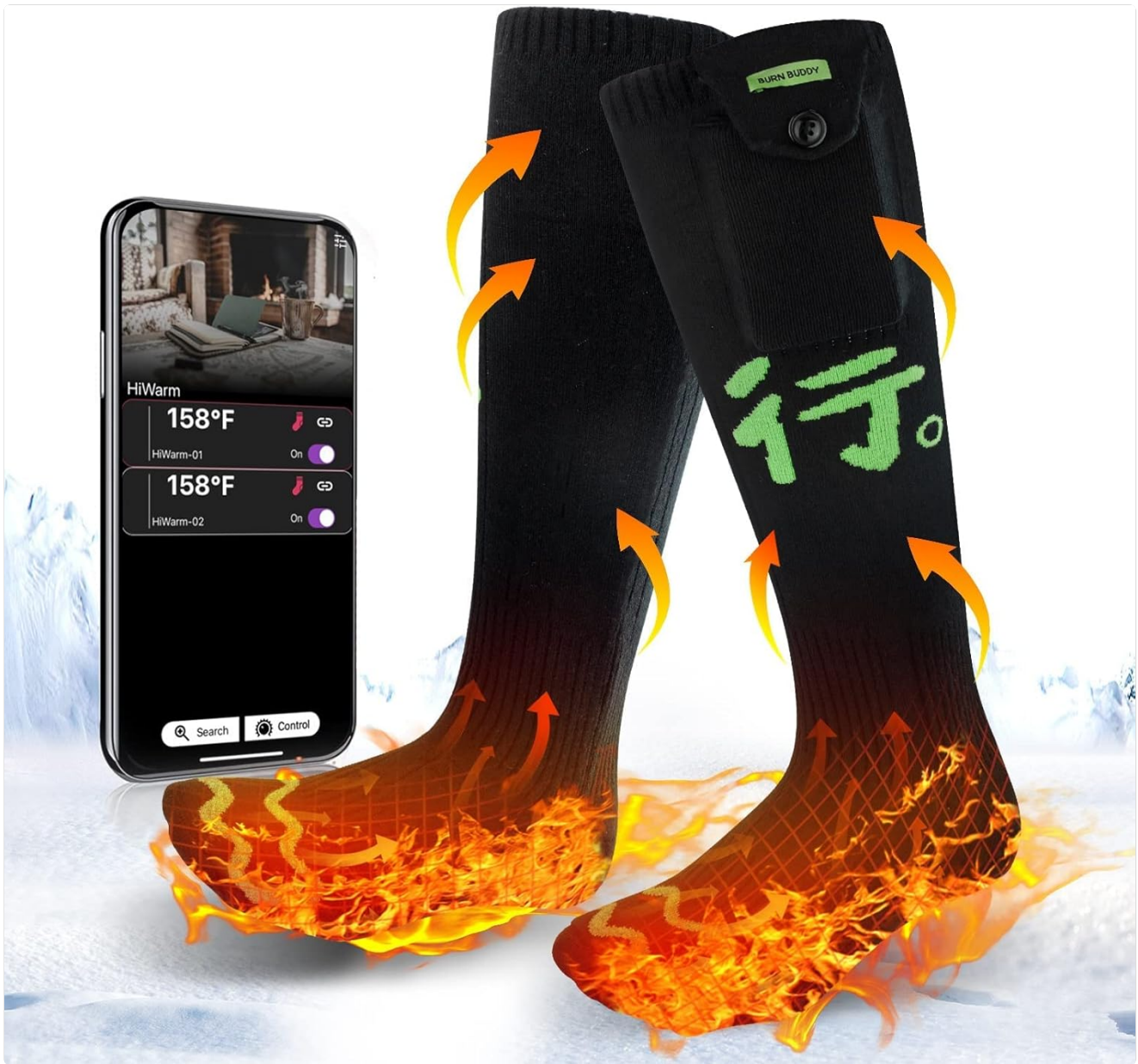
Image: Bubbacare Heated Socks demonstrating heating zones and smartphone application control.