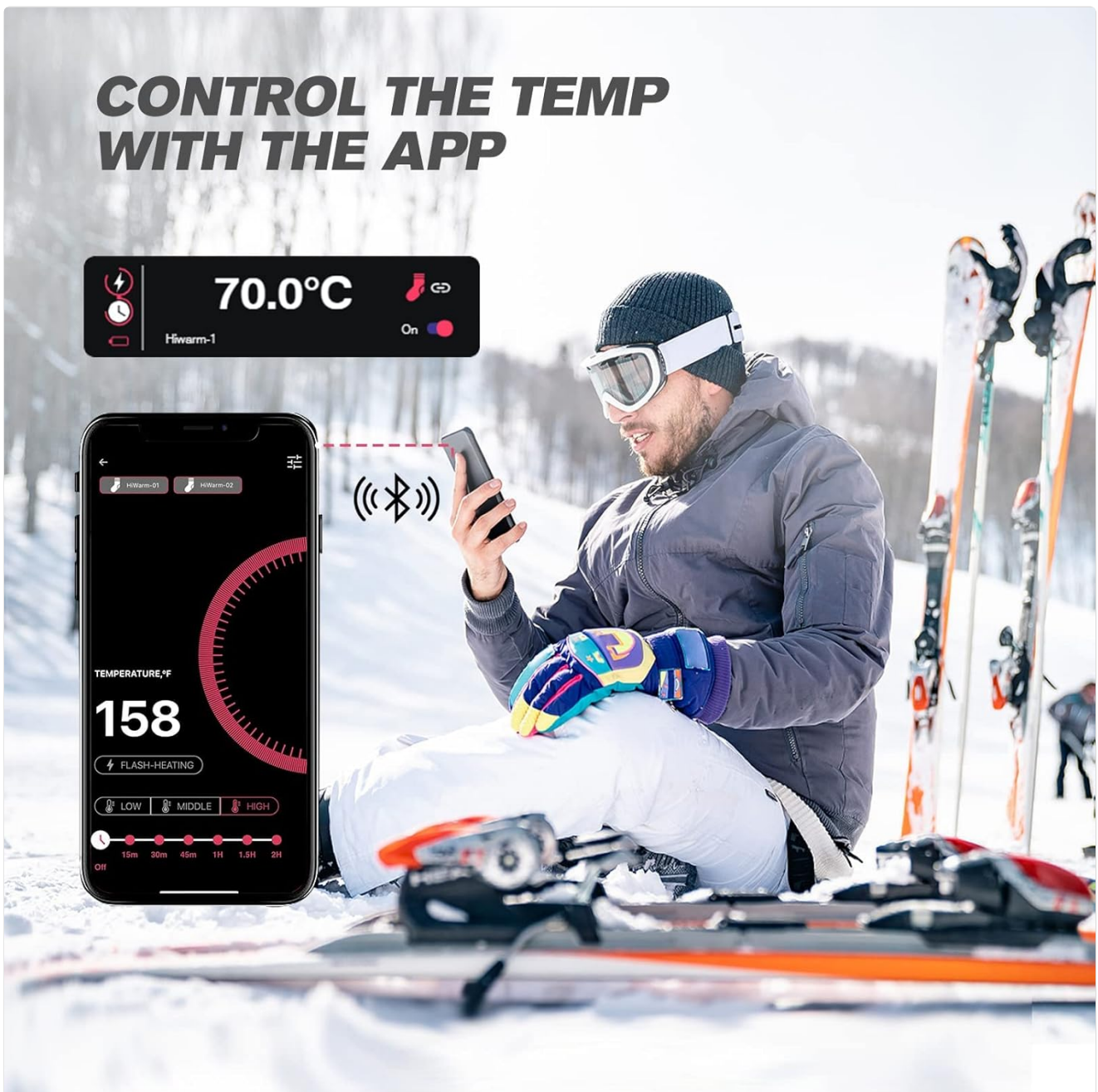
Image: A person using a smartphone to connect and control the heated socks via the dedicated application.