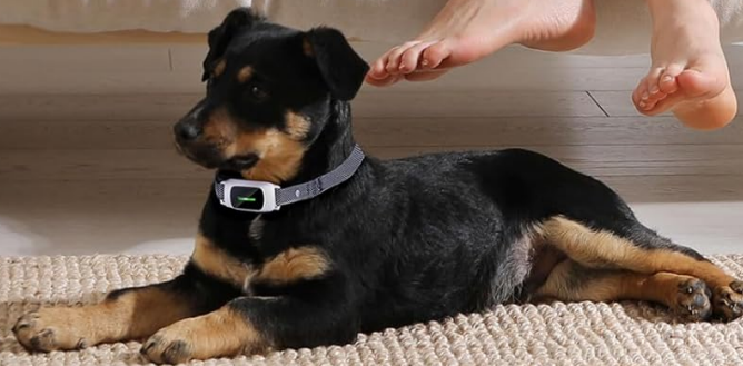
Image: The remote transmitter and collar receiver.