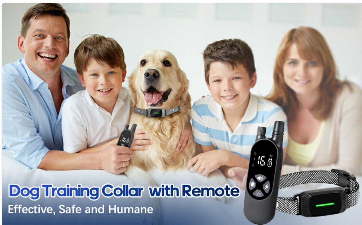
Image: The Thunbest Dog Training Collar with its remote, designed for effective, safe, and humane training.

This manual provides detailed instructions for the safe and effective use of your Thunbest Dog Training Collar. This device is designed to assist in training small, medium, and large dogs (5lbs to 110lbs) through humane and adjustable modes: Beep, Vibration, and Static Shock. Please read this manual thoroughly before use to ensure proper operation and the well-being of your pet.