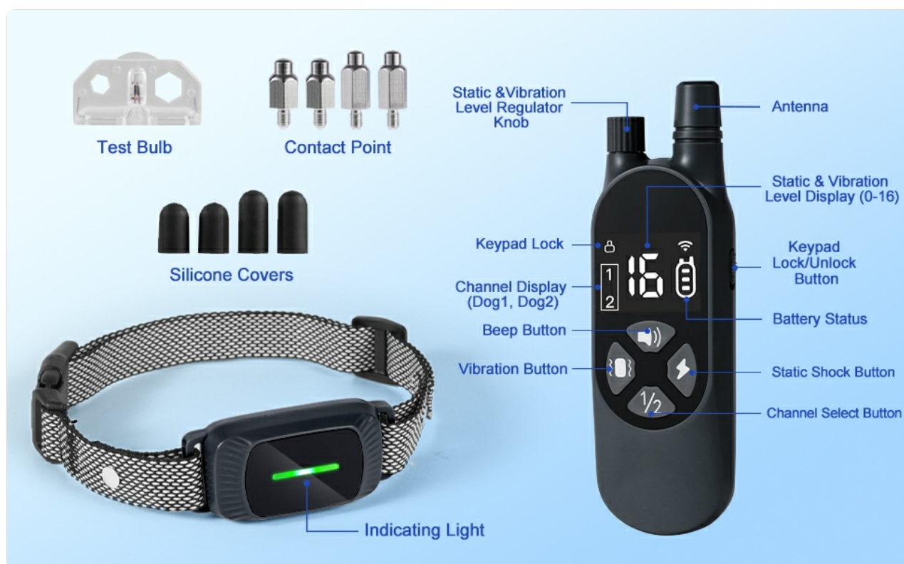
Image: Detailed view of the remote and collar components, including buttons, display, and accessories.