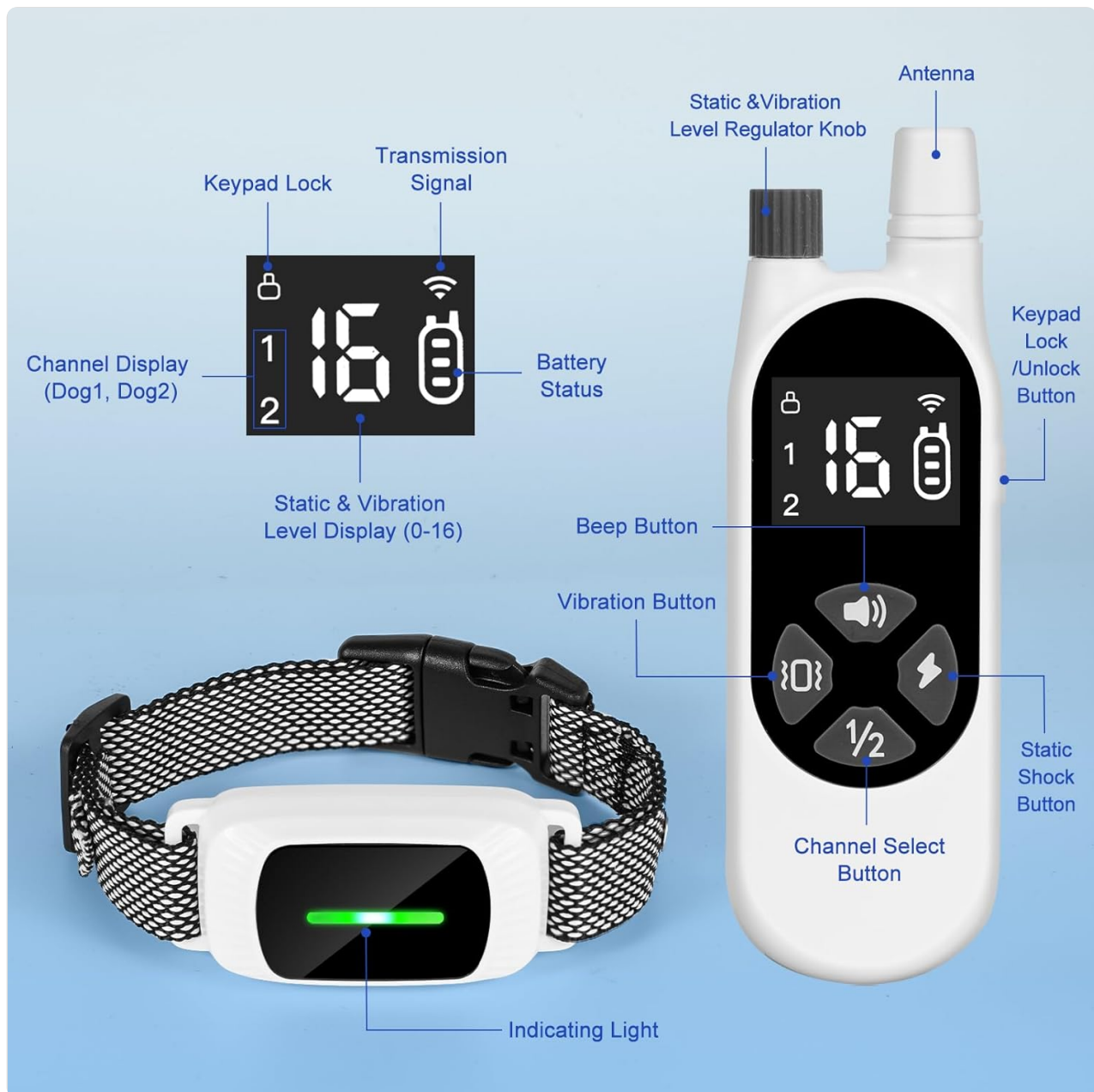
Image: Both the remote and receiver feature long-lasting battery life and convenient USB Type-C charging.