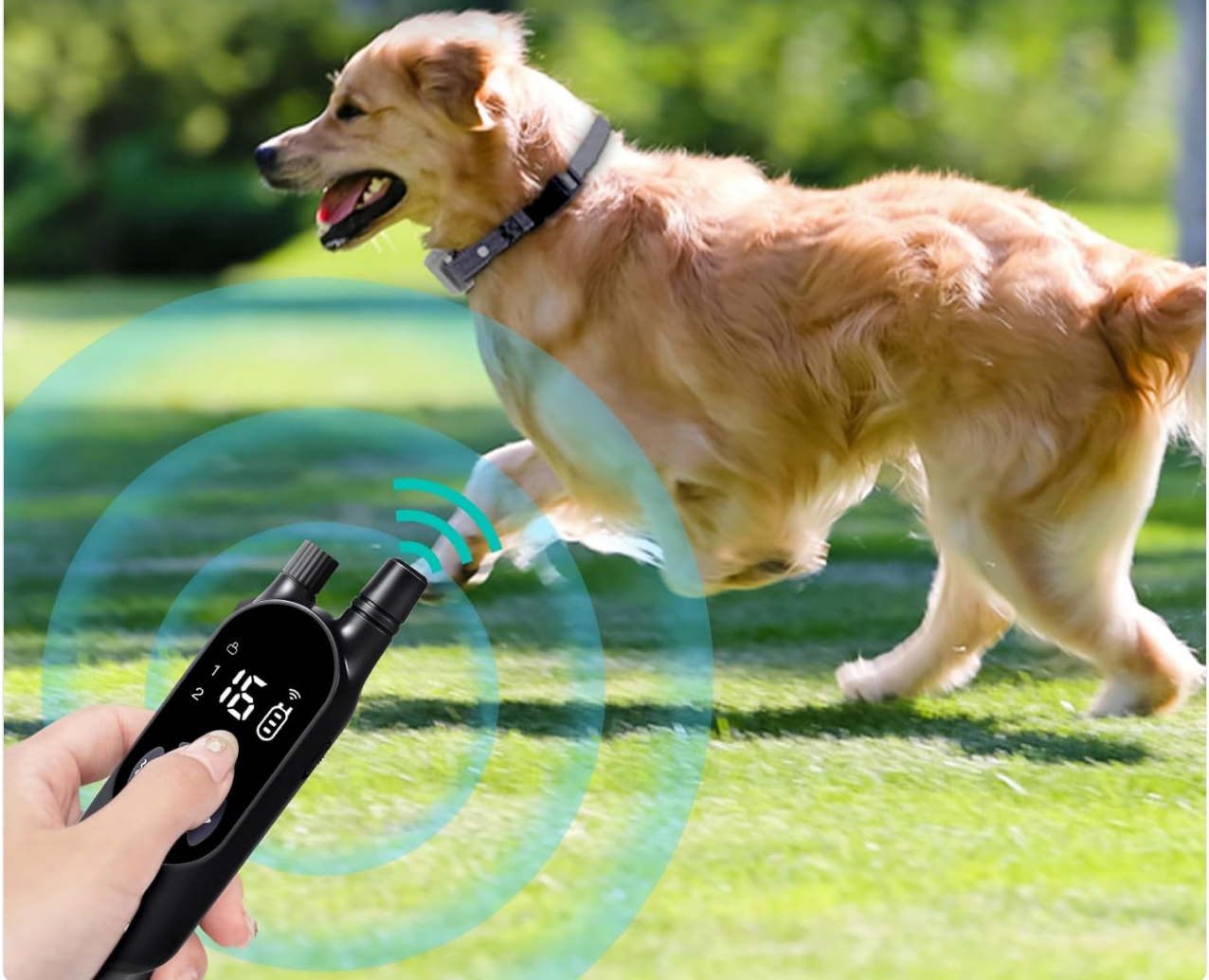
Image: The three training modes available on the collar.

Make training your dogs outdoors easier and free