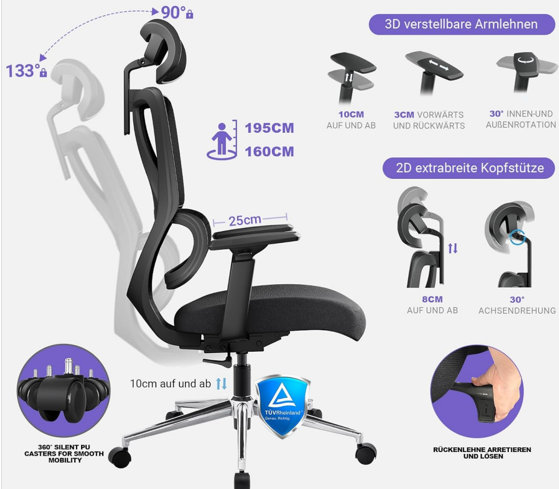
Illustration of the recline function, headrest, and armrest adjustments.