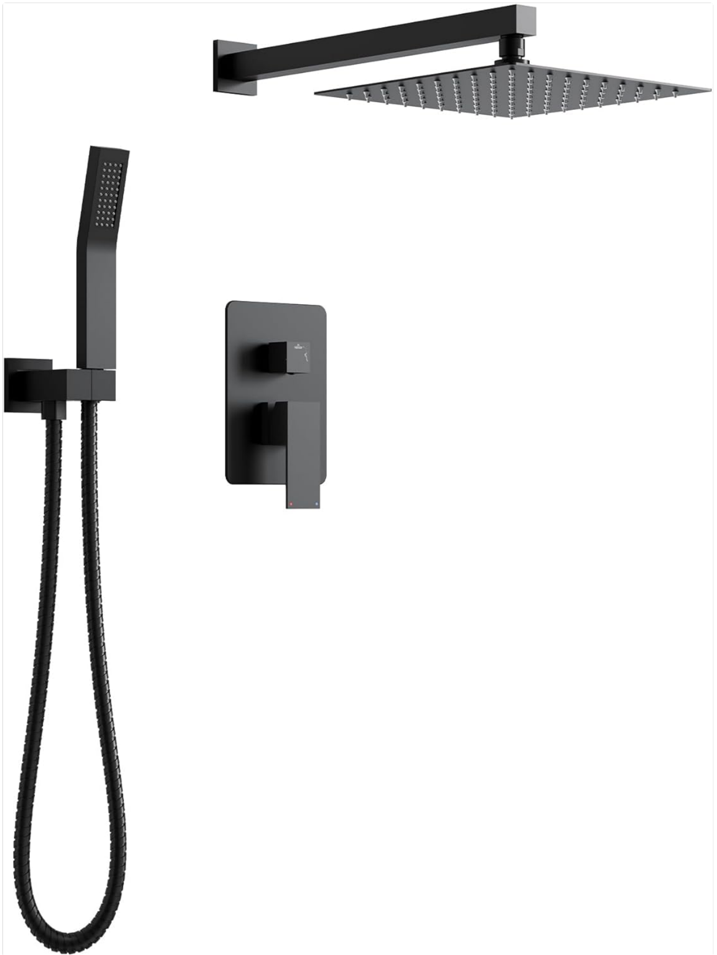
Image: All components of the Longriver Shower Faucet Set, including the rainfall shower head, handheld spray, mixer valve, and wall-mounted arm, displayed in matte black finish.