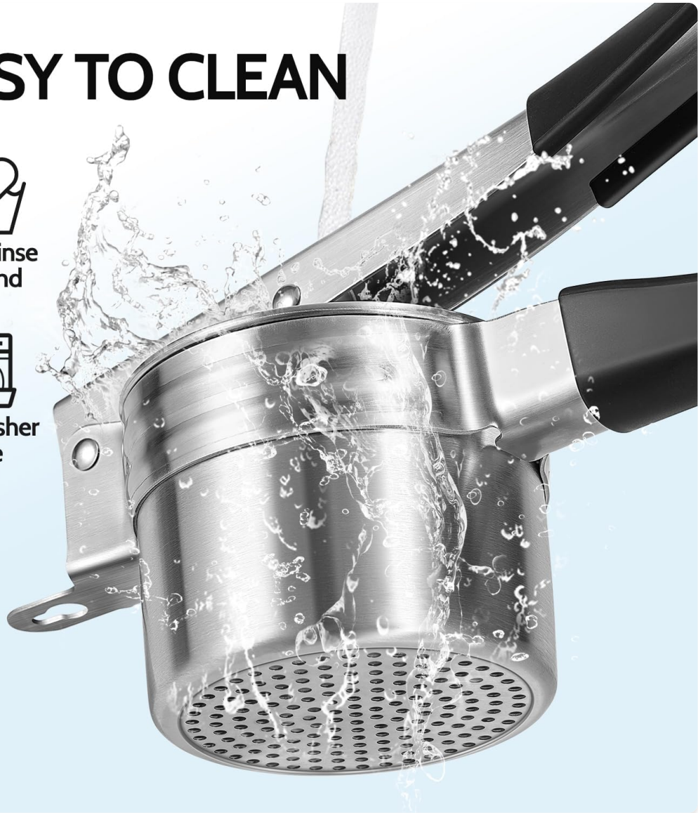
Image: The potato ricer being rinsed under running water, illustrating its easy-to-clean design and dishwasher-safe feature.