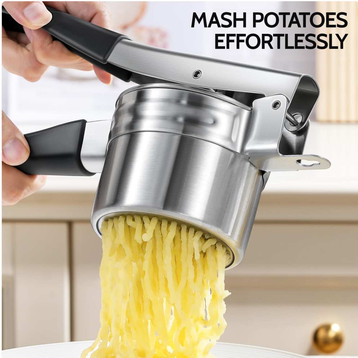
Image: The Sopito Potato Ricer shown with its three interchangeable discs, offering versatility for different textures.