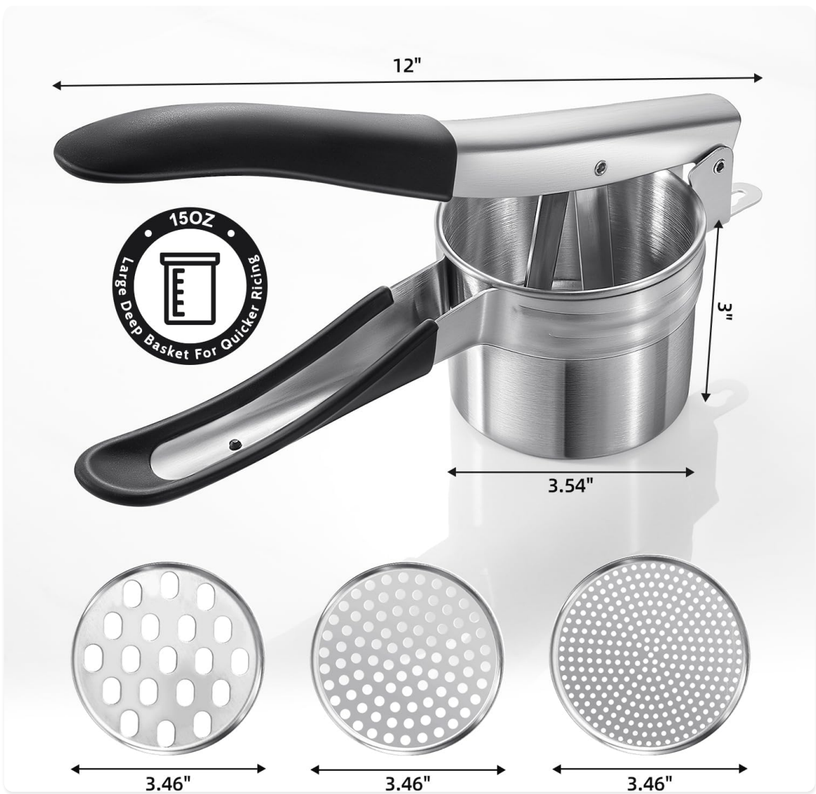
Image: A visual representation of the potato ricer's dimensions, including the 12-inch handle and the 3.46-inch diameter of the discs.