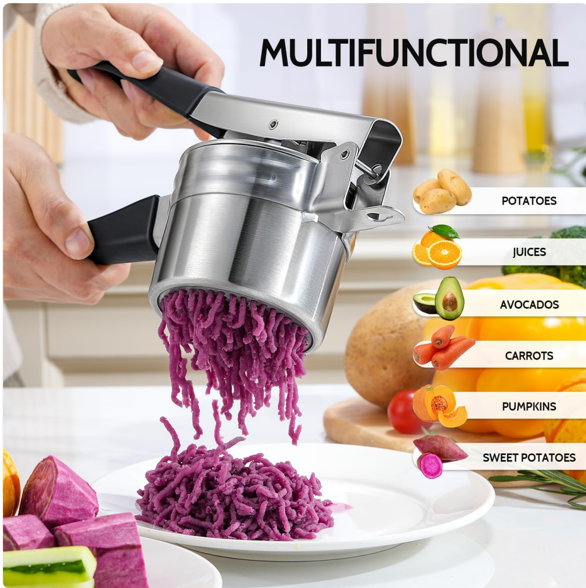
Image: The ricer processing purple sweet potatoes, highlighting its multifunctional use for various foods like potatoes, juices, avocados, carrots, pumpkins, and sweet potatoes.