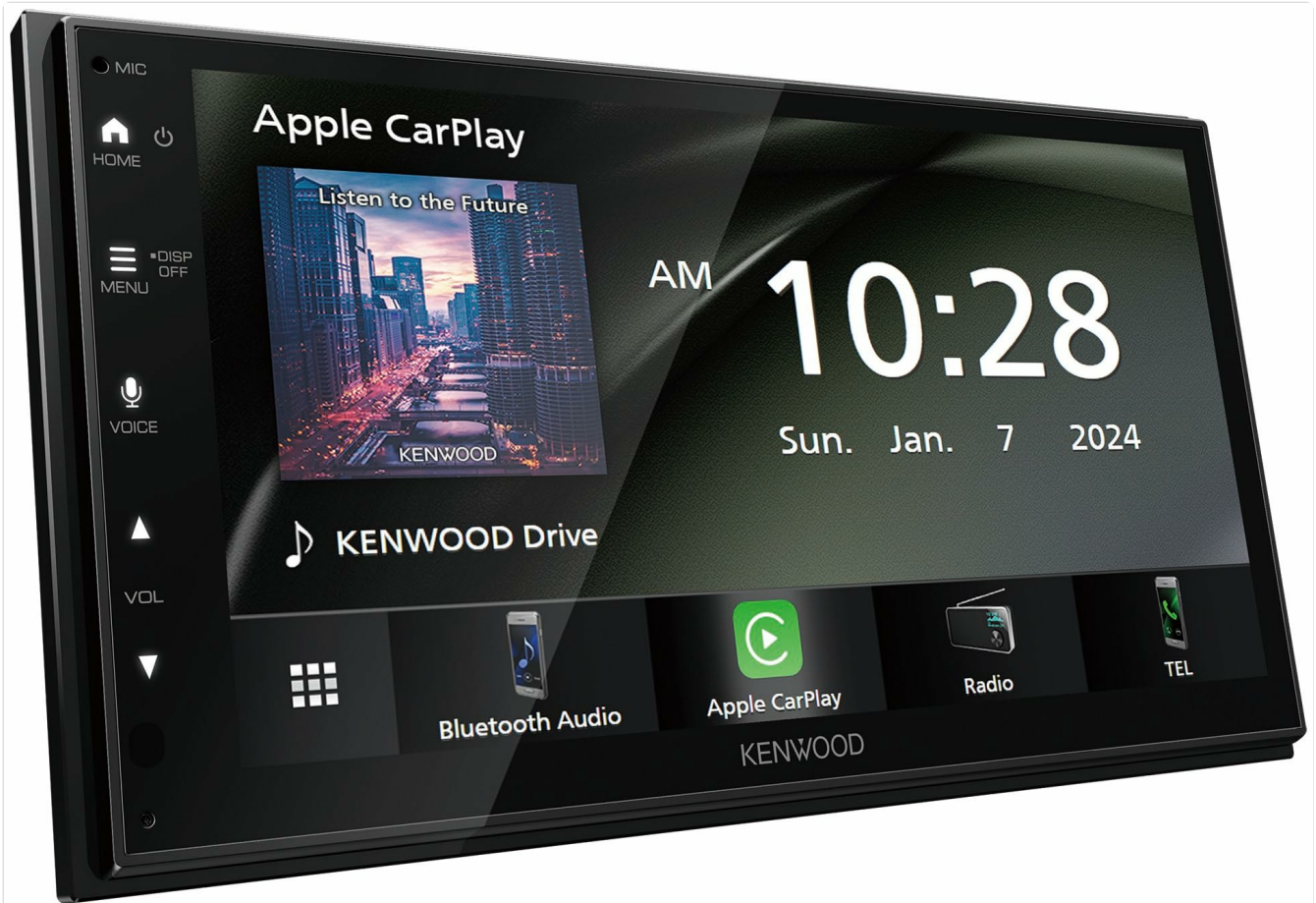
Figure 1: Kenwood DMX5523S 7-inch Display Audio System

Thank you for purchasing the Kenwood DMX5523S 7-inch Display Audio System. This manual provides essential information for the safe and efficient use of your new device. The DMX5523S offers advanced features including wireless Apple CarPlay and Android Auto, wireless mirroring, a high-resolution WSVGA capacitive touch panel, and compatibility with steering wheel remote controls, enhancing your in-car entertainment and connectivity experience.