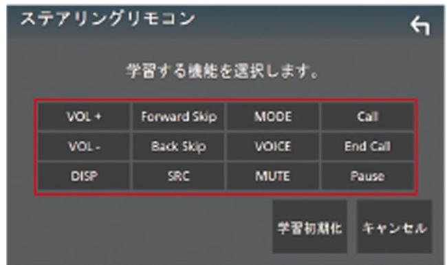
Figure 6: Steering Wheel Remote Control