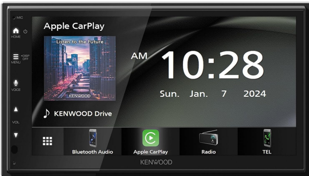
Figure 3: Apple CarPlay Interface

Video 1: Kenwood DMX5523S Wireless CarPlay, Android Auto, and Voice Control Overview. This video demonstrates the seamless wireless connectivity for smartphone integration and the convenience of voice commands.