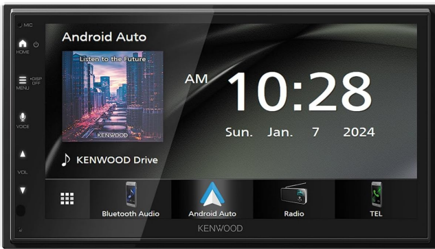
Figure 2: Android Auto Interface