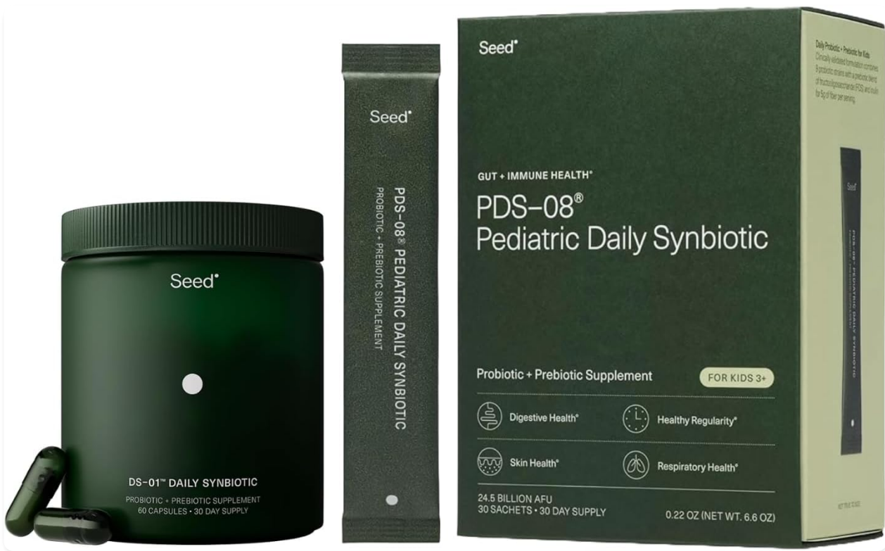
Image: The Seed Probiotic & Prebiotic Bundle, featuring the DS-01 Daily Synbiotic for adults and the PDS-08 Pediatric Daily Synbiotic for children.