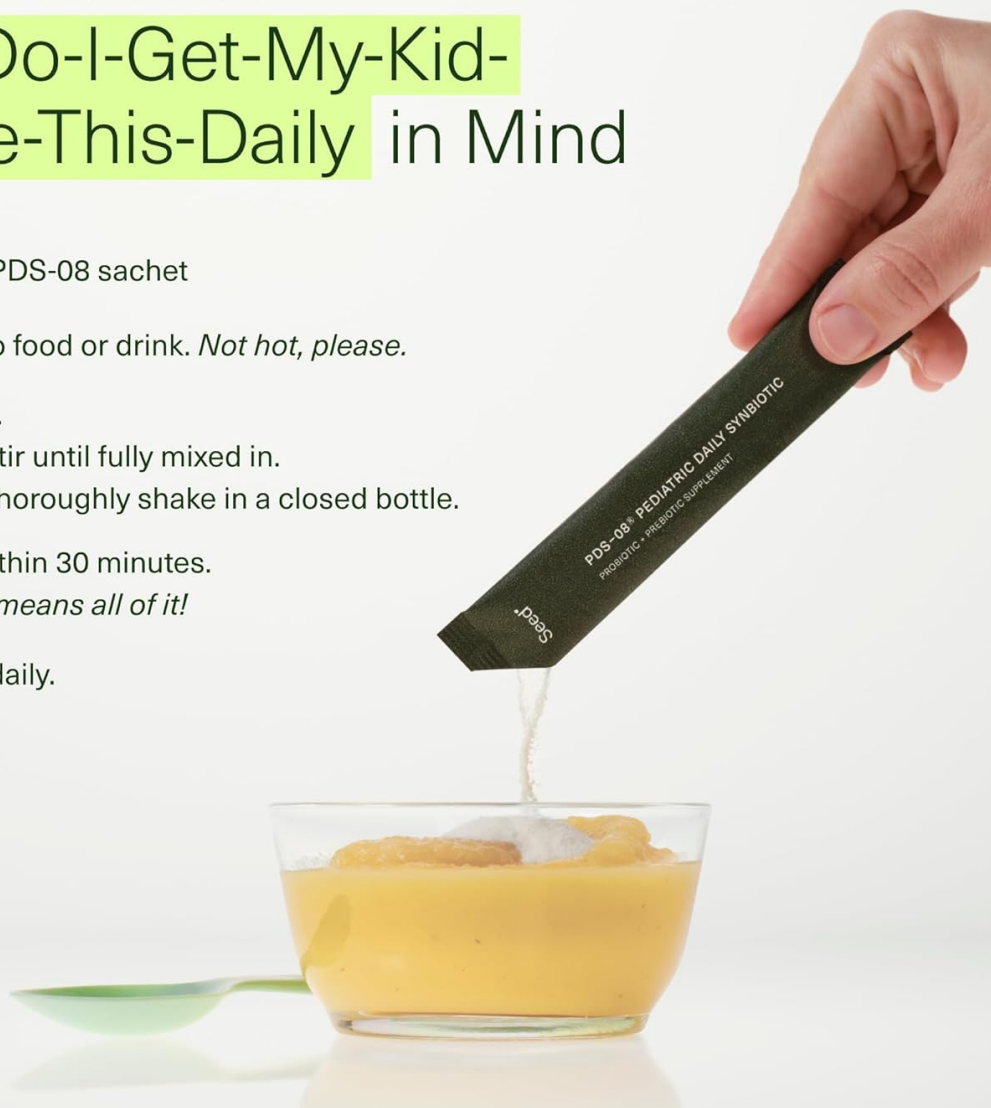
Image: Step-by-step guide on how to prepare PDS-08 Pediatric Daily Synbiotic by mixing it into food.