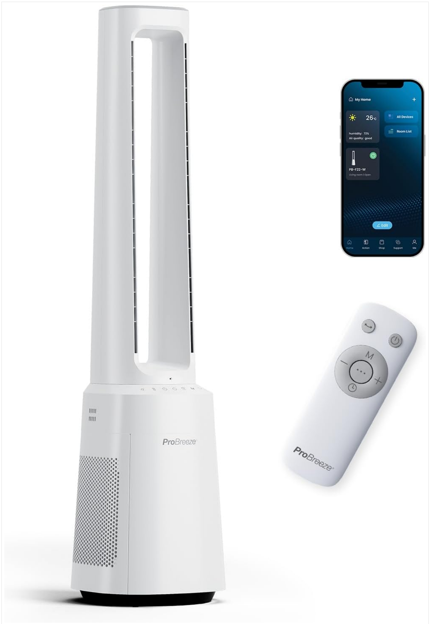
The Pro Breeze OmniAir Bladeless Tower Fan, shown with its remote control and a smartphone displaying the control app interface.