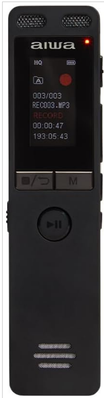
Image: Front view of the Aiwa DVR-A400 Digital Voice Recorder, showcasing its slim design and display.