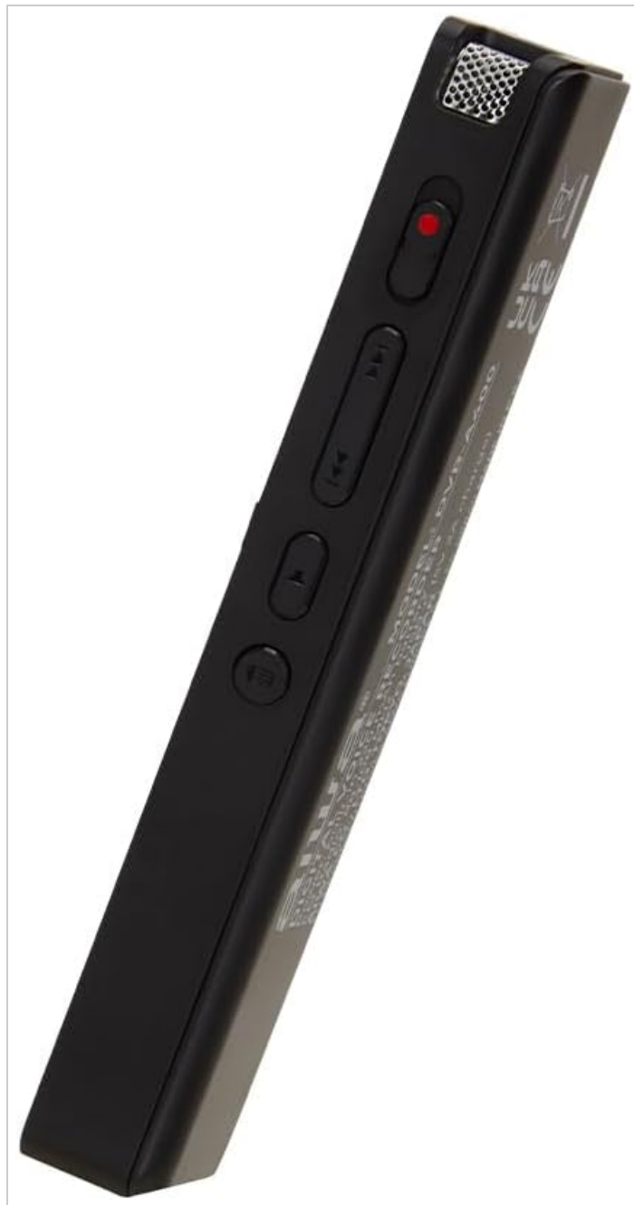
Image: Side view of the Aiwa DVR-A400, highlighting the control buttons and ports for user interaction.