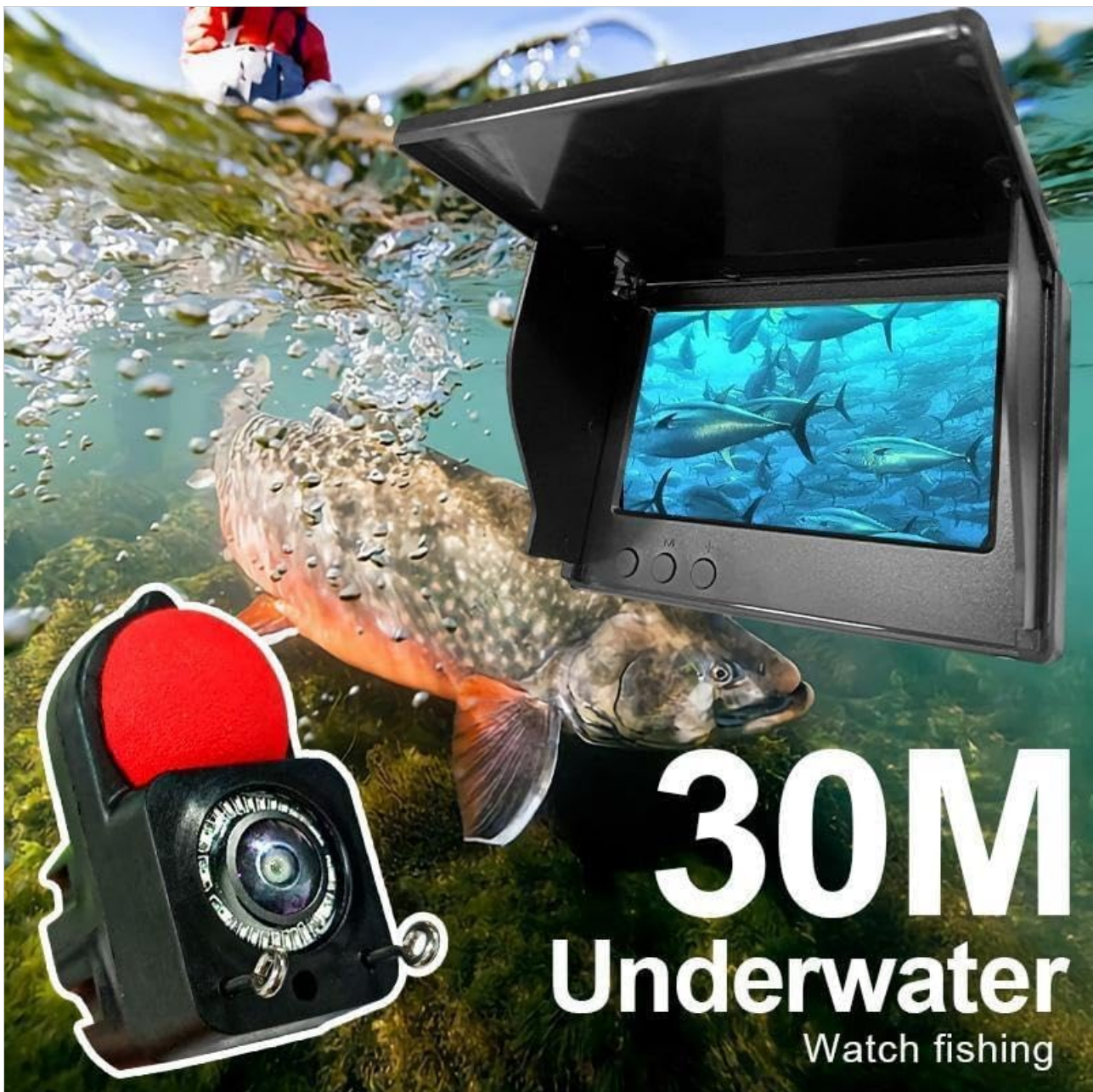
Image: The underwater camera and display unit in an active fishing scenario, showing a large fish and emphasizing the 30-meter cable length for underwater observation.