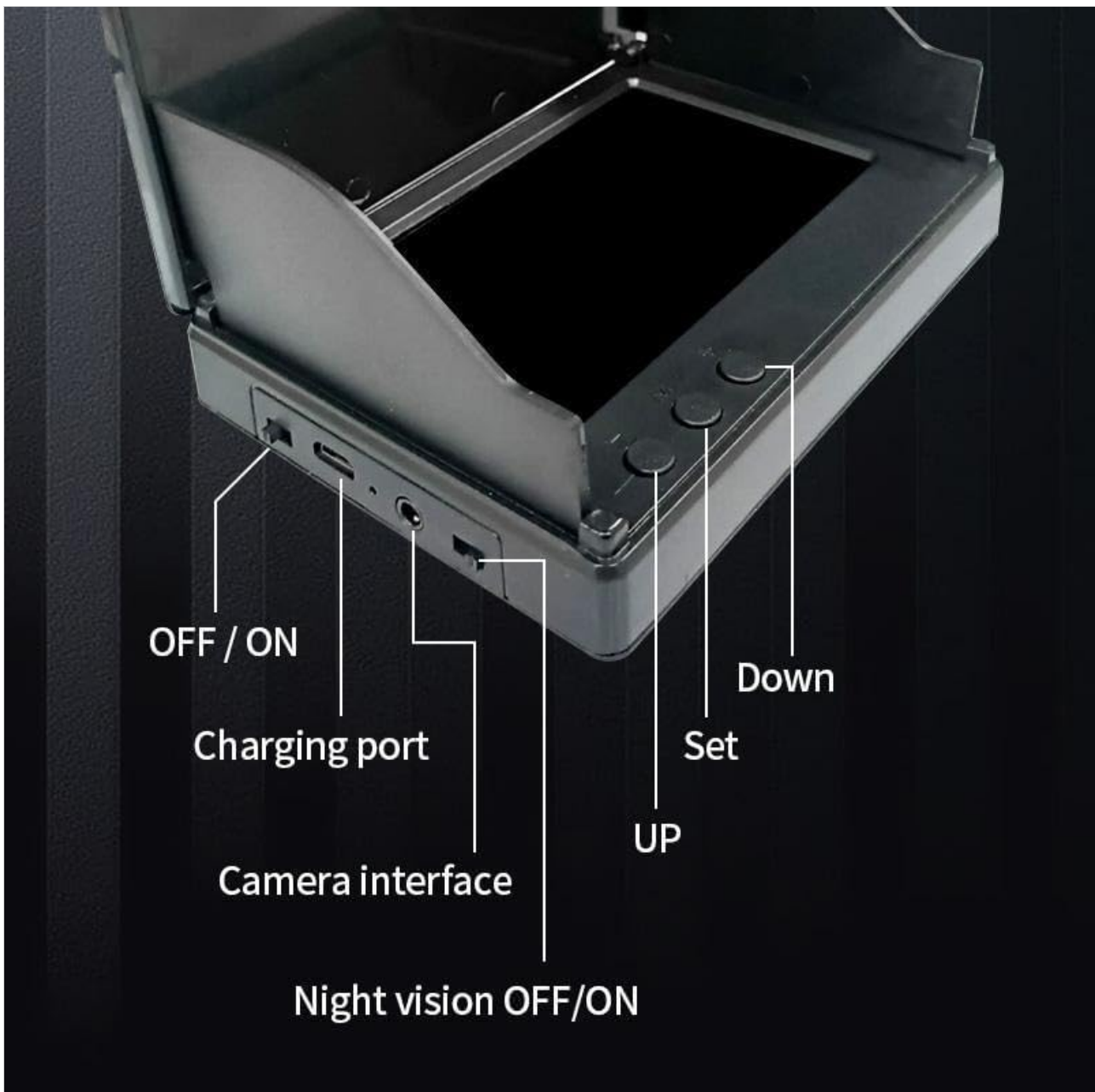
Image: A close-up view of the display unit's side, highlighting the OFF/ON switch, charging port, camera interface, and Night Vision OFF/ON switch.