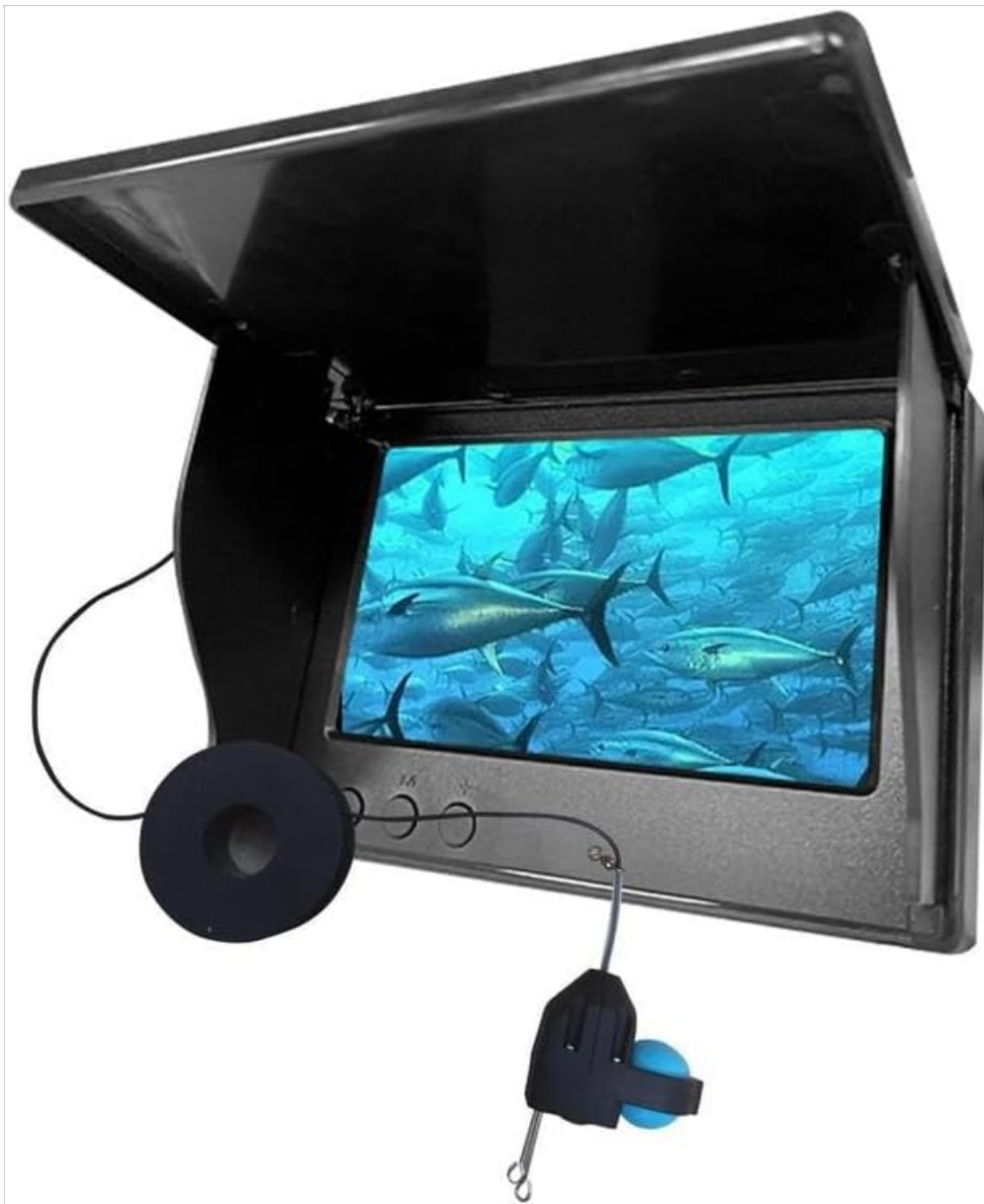
Image: The main unit of the Generic Underwater Fishing Camera and Fish Finder, showing the display screen with a sunshade and the camera cable with a reel.