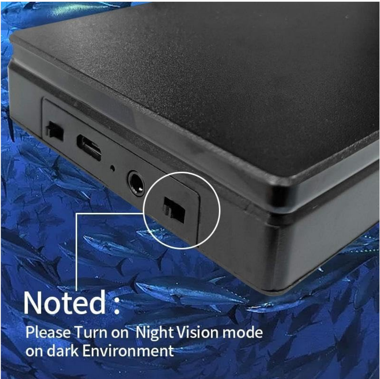
Image: A close-up of the display unit's side, with a highlighted area indicating the Night Vision ON/OFF switch and a note advising to turn on Night Vision mode in dark environments.