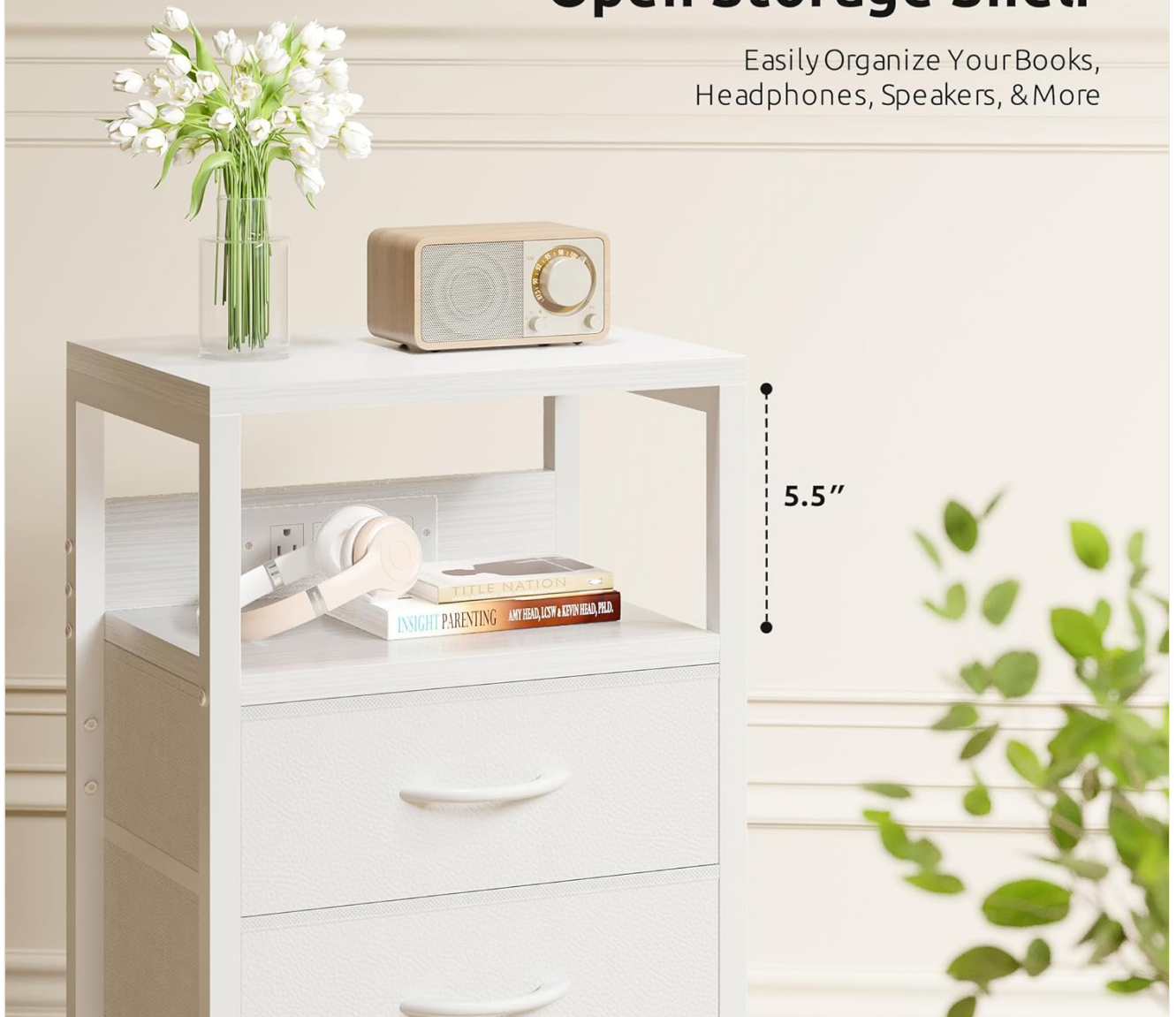
Image: Close-up view of the nightstand's open storage shelf, showing it used for books and headphones, with a dimension label of 5.5 inches height.

Easily Organize Your Books, Headphones, Speakers, & More