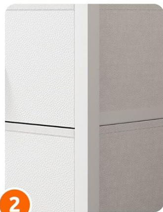
2 Robust Metal Frame