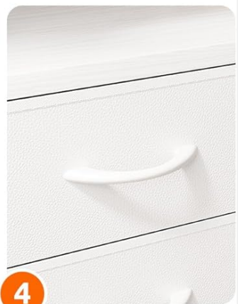
4 Sturdy Drawer Pulls

Image: Detailed view highlighting the adjustable footpads, robust metal frame, reliable anti-tip kit, and sturdy drawer pulls of the nightstand.