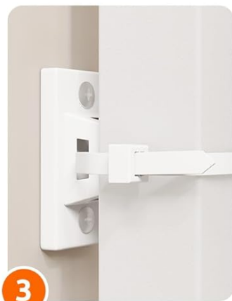
3 Reliable Anti-Tip Kit