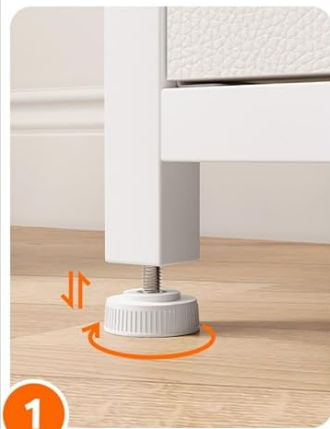
1 Adjustable Footpads