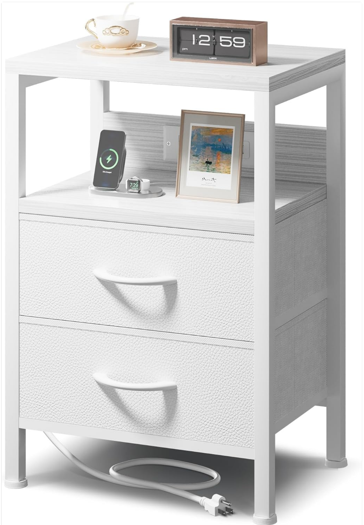
Image: Front view of the Lazzanto Nightstand with Charging Station, showcasing its white finish, two fabric drawers, open shelf, and