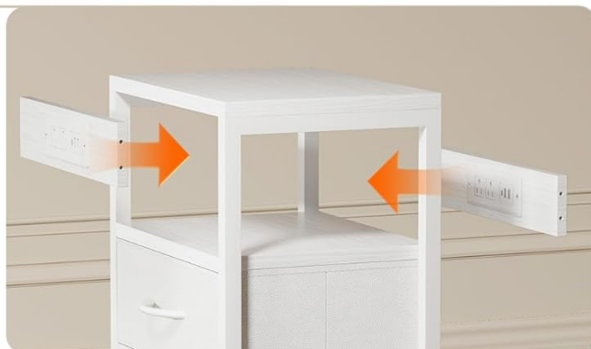
Image: Illustration showing the removable charging station being inserted into the nightstand, with arrows indicating flexible installation on either side.