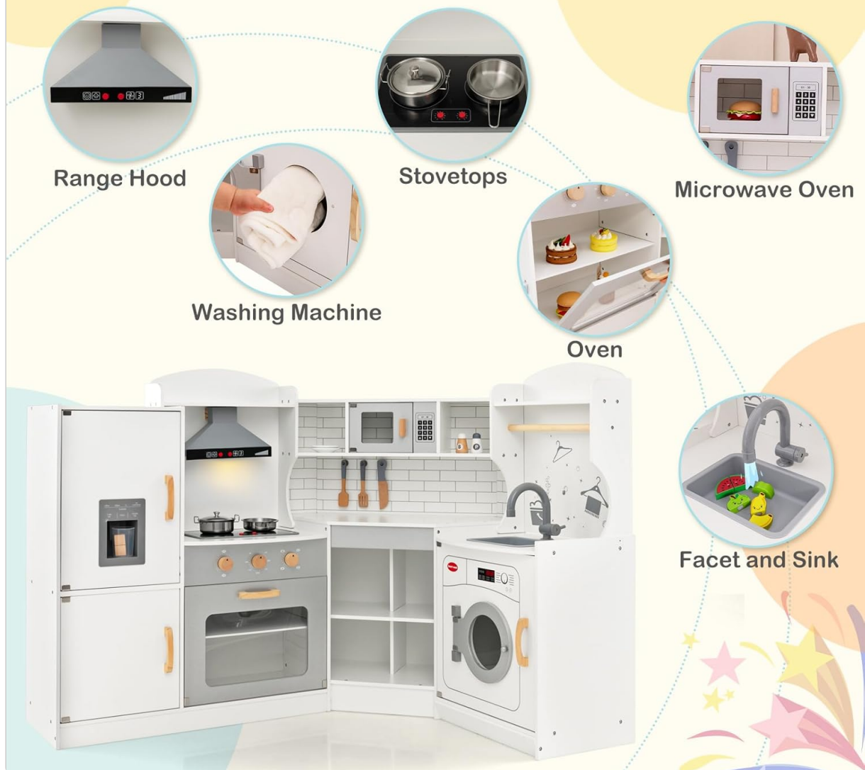
Image Description: An infographic highlighting the multifunctional features of the play kitchen set, including the range hood, stovetops, microwave oven, washing machine, oven, and faucet with sink.