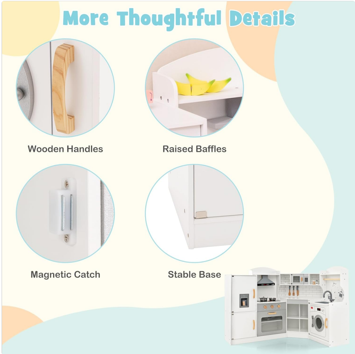
Image Description: A close-up image highlighting thoughtful design details such as wooden handles, raised baffles, magnetic catches for doors, and a stable base, contributing to the durability and functionality of the play kitchen.