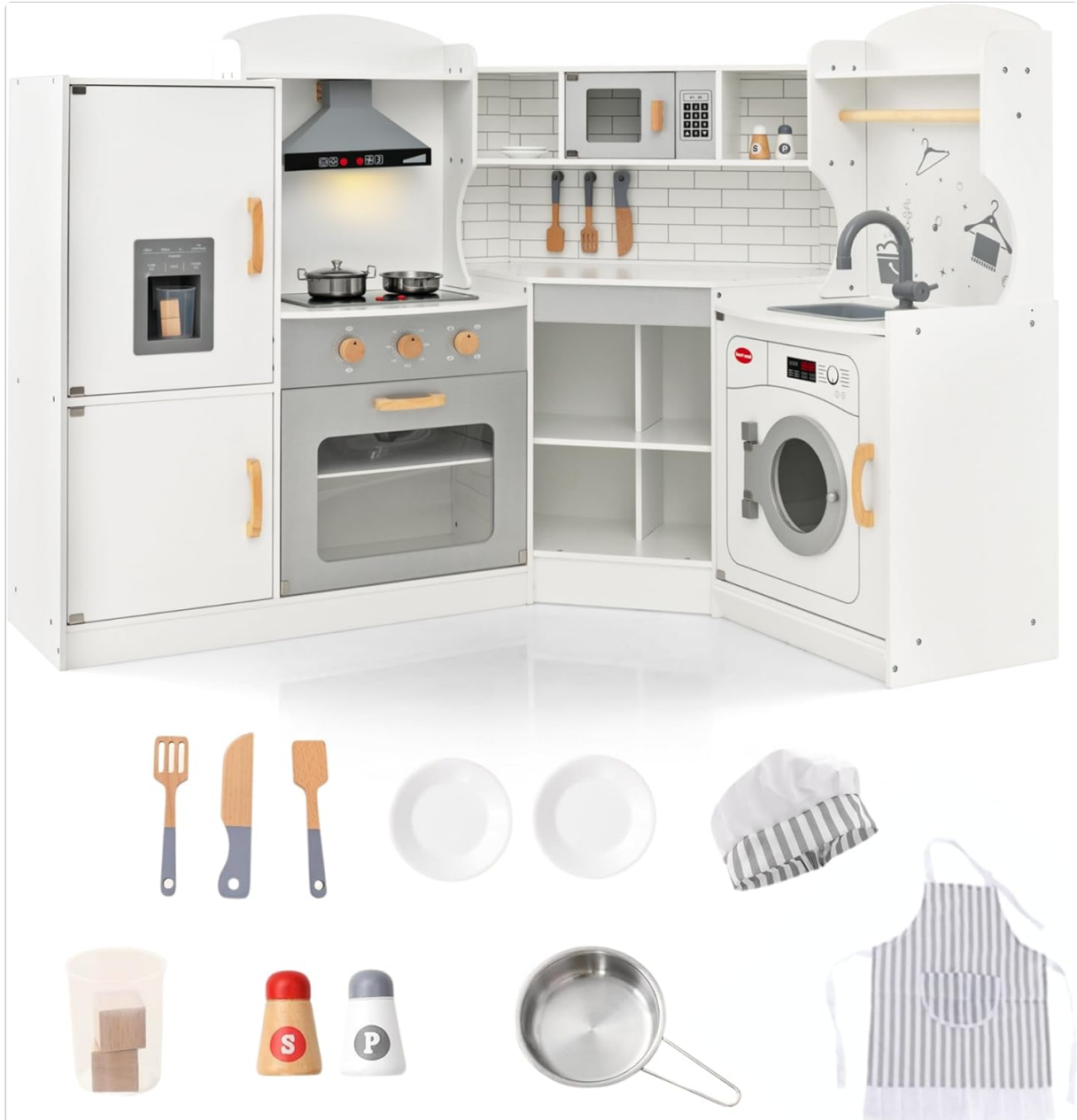
Image Description: The complete CHEFJOY Corner Wooden Play Kitchen Set, showcasing its L-shaped design and various play areas including a refrigerator, stove, oven, microwave, sink, and washing machine, along with included accessories.