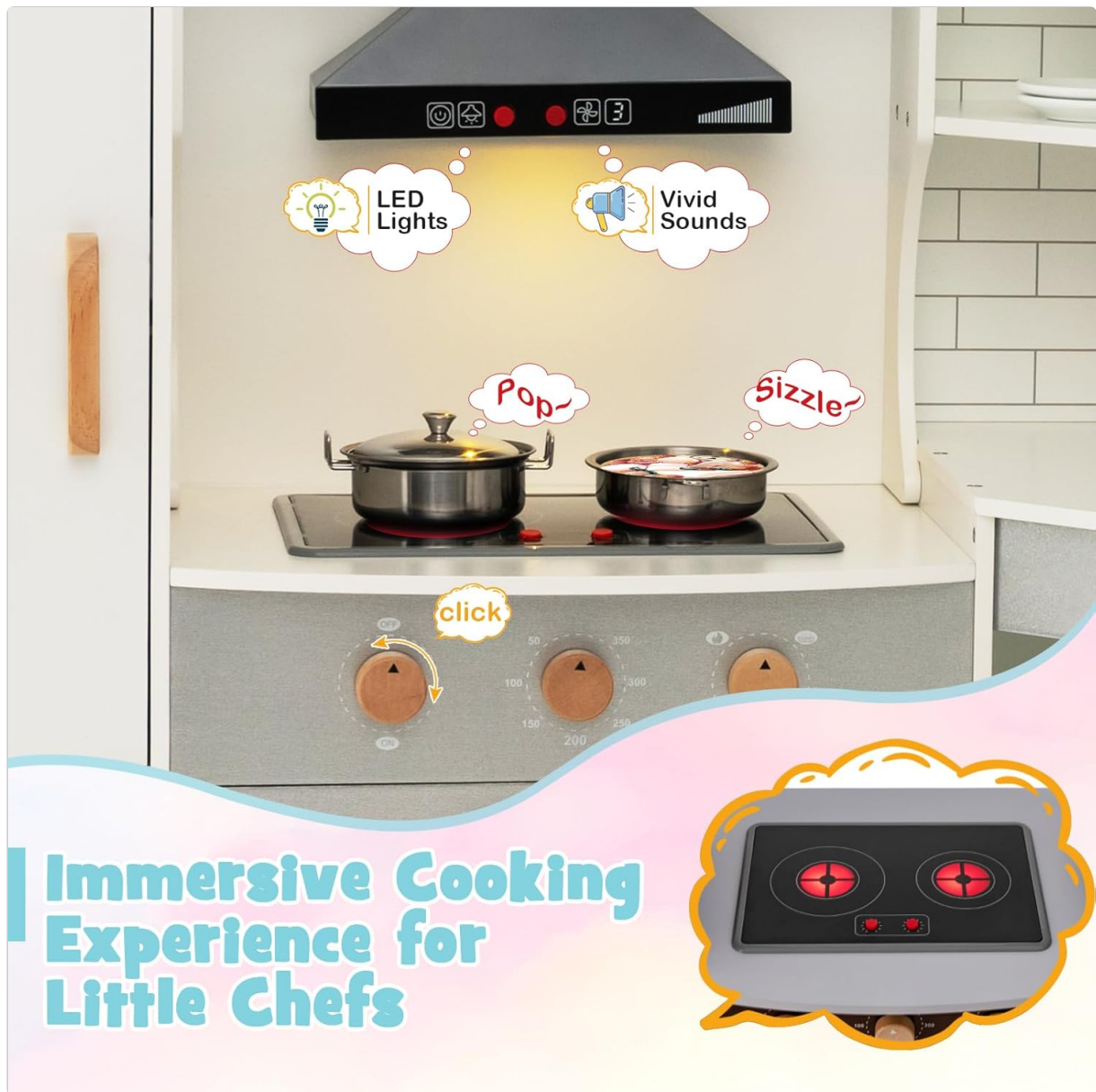
Image Description: A close-up of the play kitchen's stove area, showing LED lights and sound effects labeled "Pop~" and "Sizzle~" for an immersive cooking experience.