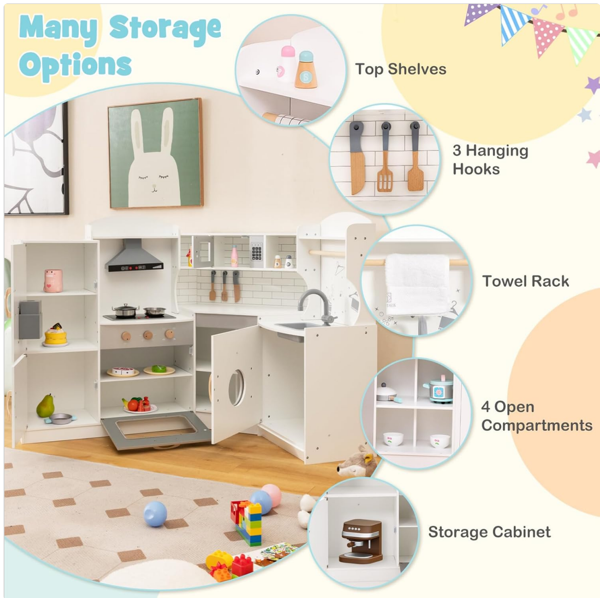
Image Description: An image showcasing the various storage options within the play kitchen, including top shelves, hanging hooks, a towel rack, open compartments, and storage cabinets.