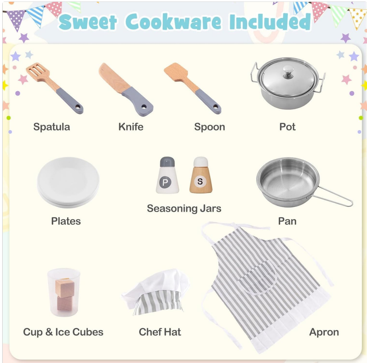
Image Description: A flat lay image displaying the various cookware and accessories included with the play kitchen set, such as pots, pans, utensils, plates, and seasoning jars.