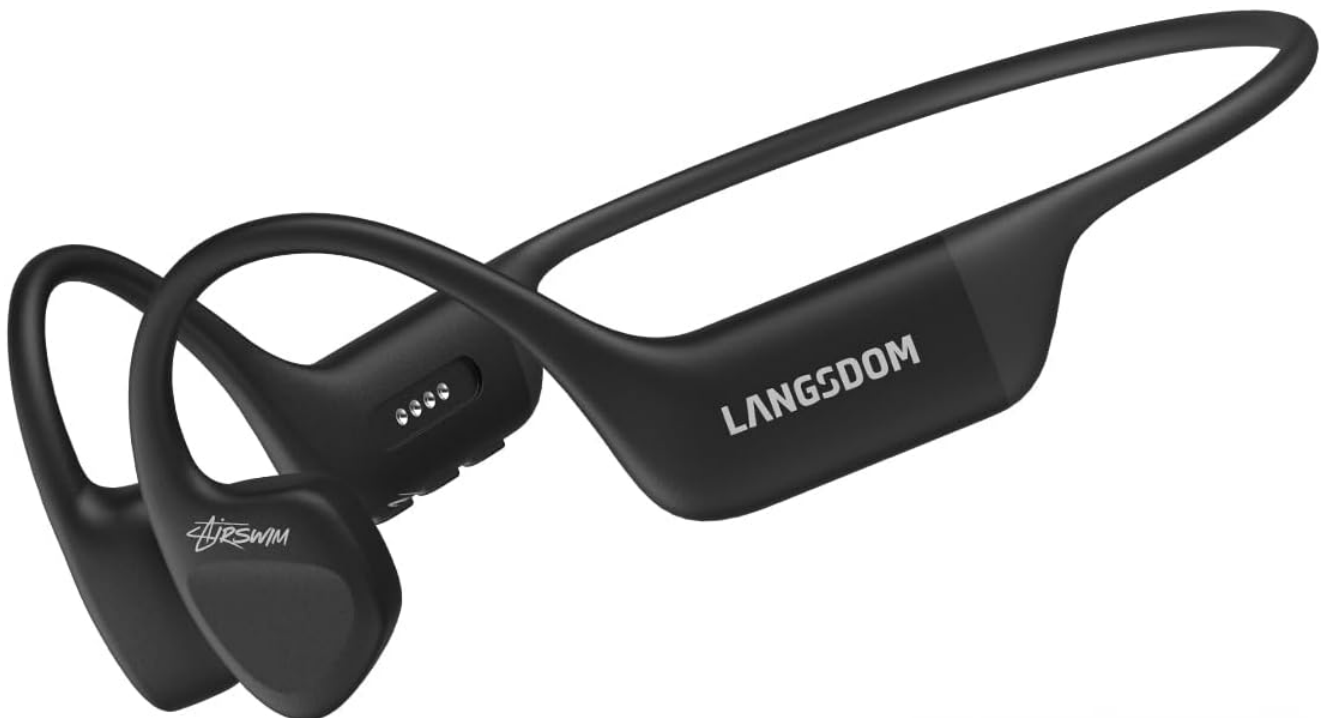
Image: The Langsdom AirSwim Bone Conduction Headphones in black, showcasing their sleek design.

The Langsdom AirSwim Bone Conduction Headphones are designed for versatile use, offering a premium audio experience both in and out of water. Featuring IPX8 waterproofing, a comfortable open-ear design, and dual Bluetooth and MP3 modes with 32GB of built-in memory, these headphones are ideal for sports, swimming, and daily listening. The bone conduction technology ensures clear sound while keeping your ears open to your surroundings for enhanced safety.