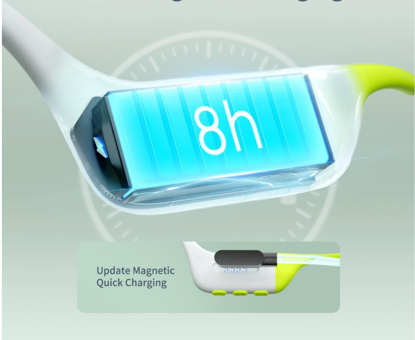
Image: An illustration highlighting the 8-hour battery life and the magnetic quick charging feature of the headphones.