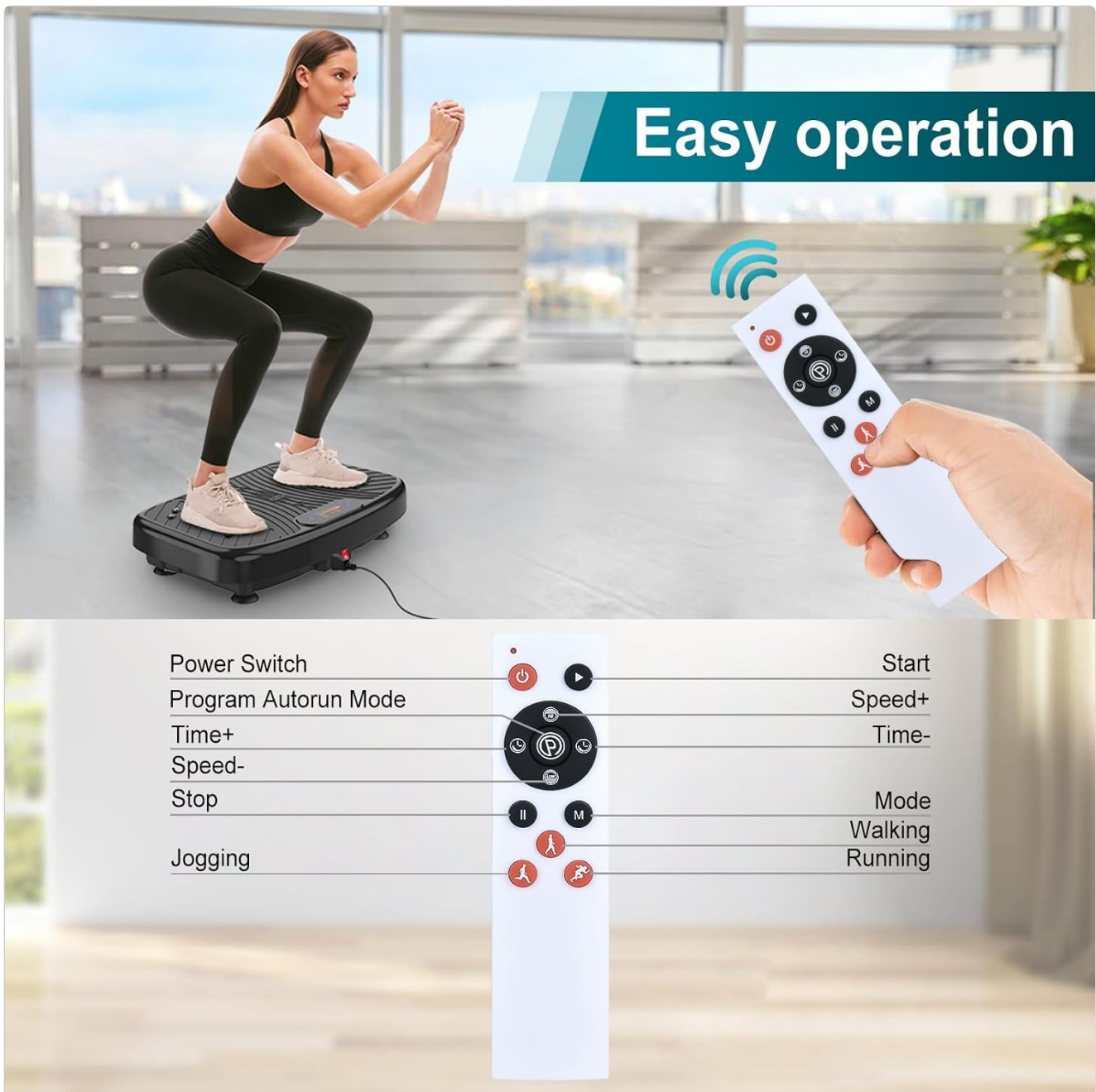
Image 3.1: Overview of the remote control, showing button labels and their respective functions for operating a vibration plate exercise machine.

The RETROSUN MW358 remote control features clearly labeled buttons for intuitive operation of your vibration plate exercise machine. Refer to the diagram below for a detailed overview of each button's function.