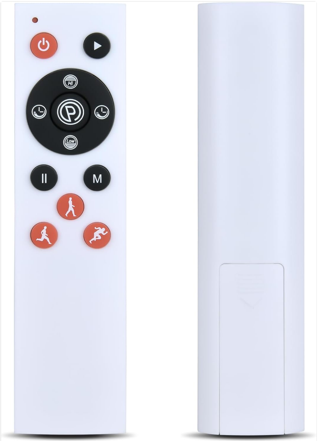
Image 1.1: Front and back view of the RETROSUN MW358 Replacement Remote Control, showing its ergonomic design and battery compartment.