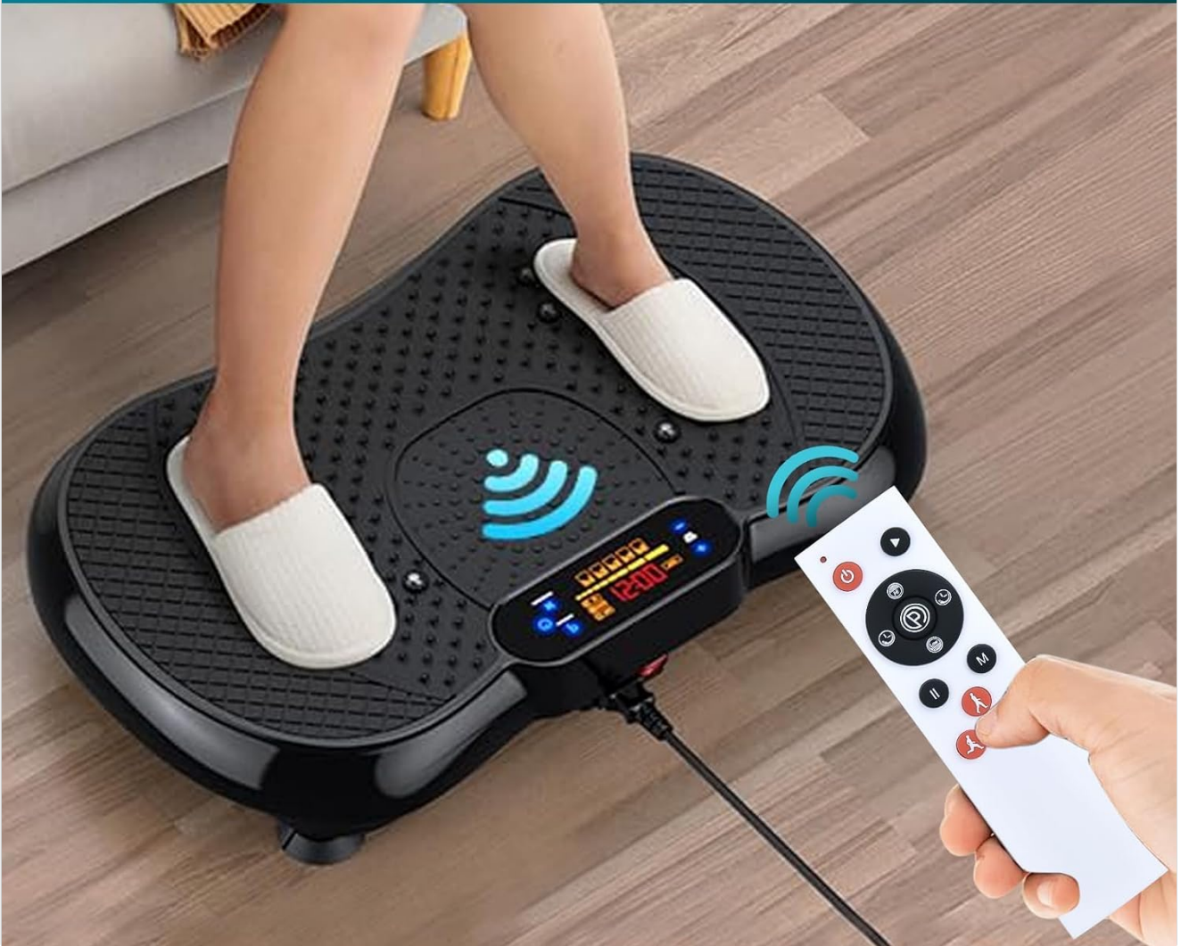
Image 3.2: Visual representation of the remote control's effective range and wide control angle.