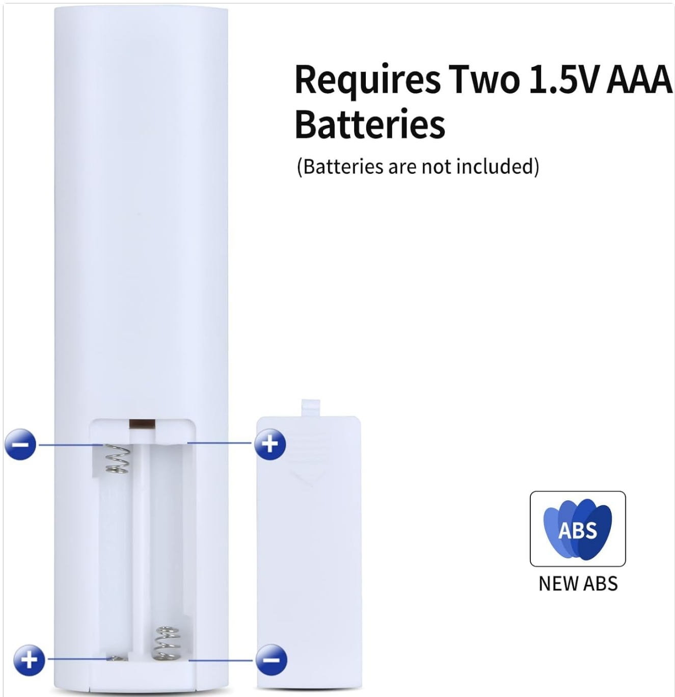
Image 2.1: Diagram illustrating the correct insertion of two AAA batteries into the remote control's battery compartment.

The remote is ready for use immediately after battery installation; no programming is required.