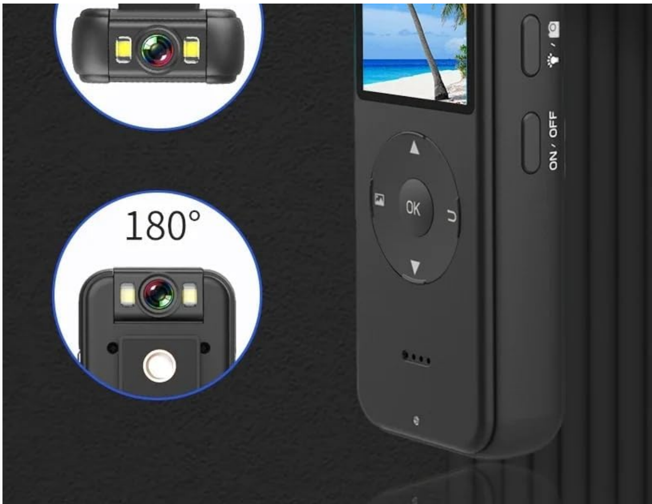
Image: The side view of the CS09 Mini Camera, highlighting the independent buttons for one-click recording and one-click photography.