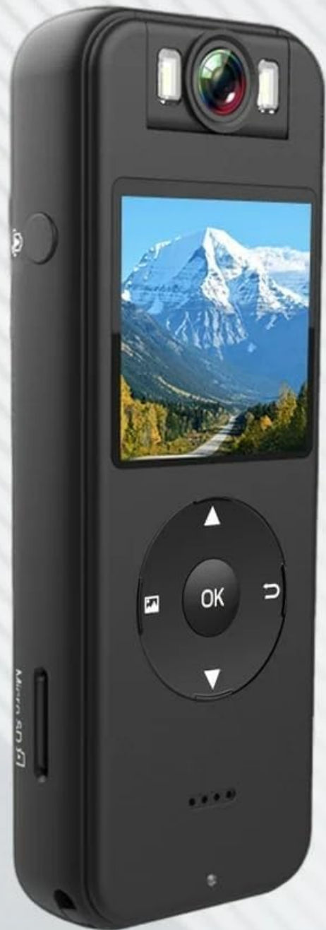
Image: The CS09 Mini Camera connected via its Type-C charging interface, emphasizing fast charging and data transmission.