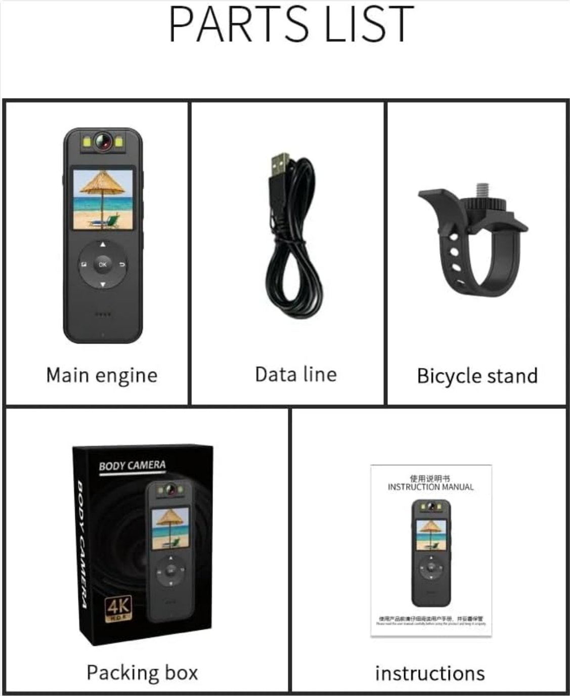
Image: Detailed diagram showing the different components and buttons of the CS09 Mini Camera.

Familiarize yourself with the various parts and controls of your CS09 Mini Camera: