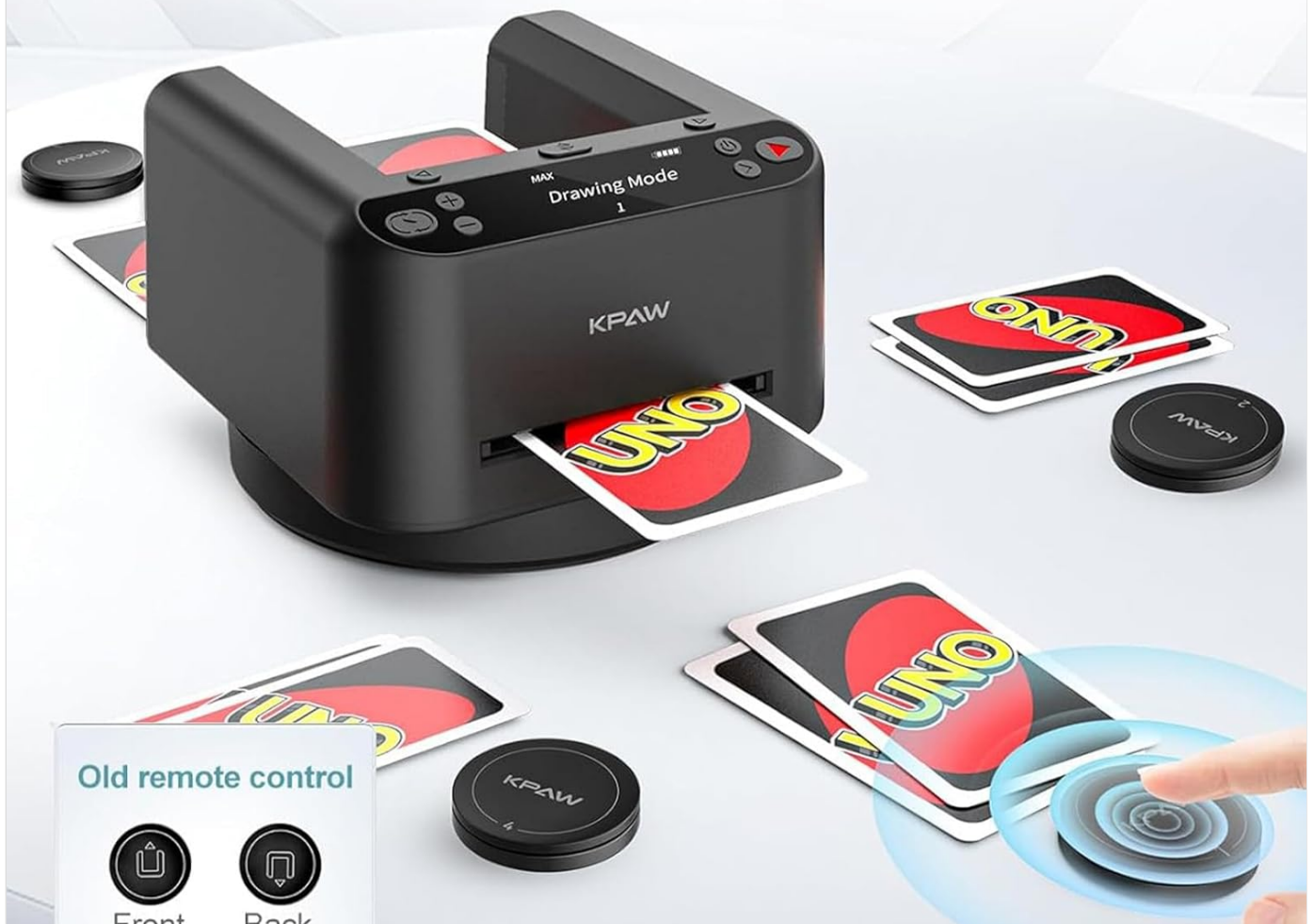
Image: An automatic card dealer machine dealing UNO cards, with several wireless remotes positioned around it, demonstrating its use with different card types.

Connects to 12 remote controls Free selection of positions