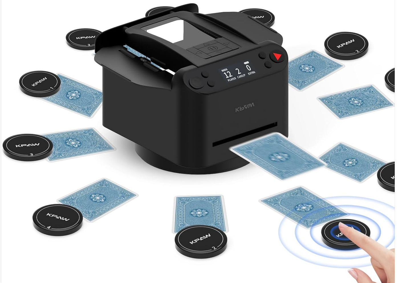
Image: An automatic card dealer machine centrally placed, surrounded by playing cards and multiple black wireless drawing remotes, illustrating a multi-player setup.