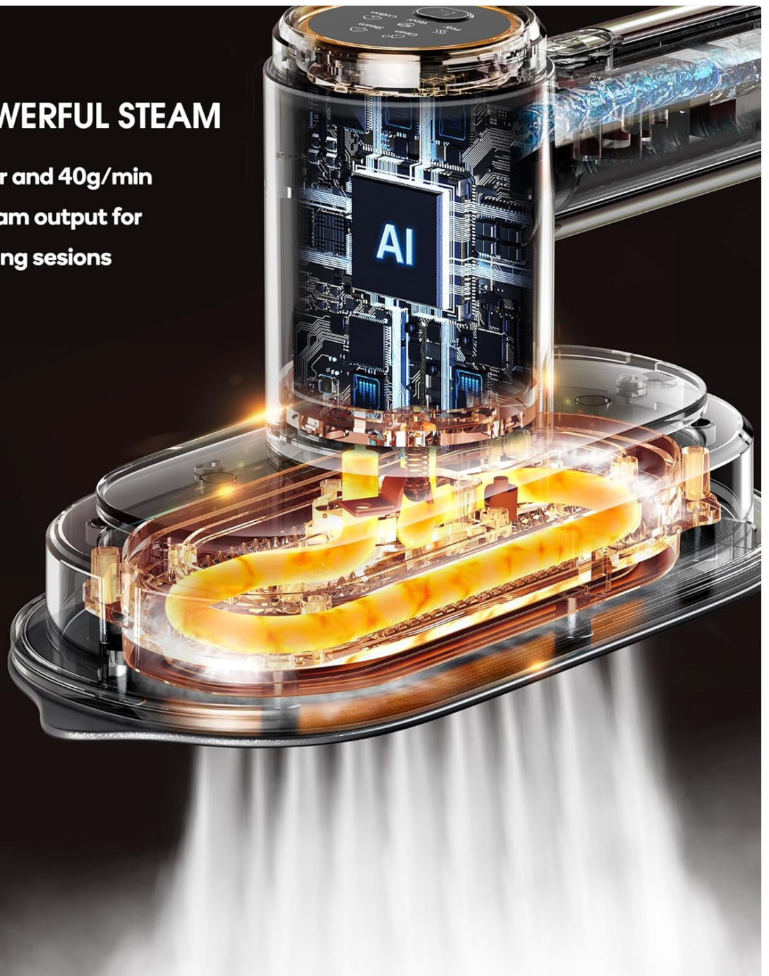
Image 4.1.1: Visual representation of the steam iron's rapid heating and powerful steam generation capabilities.