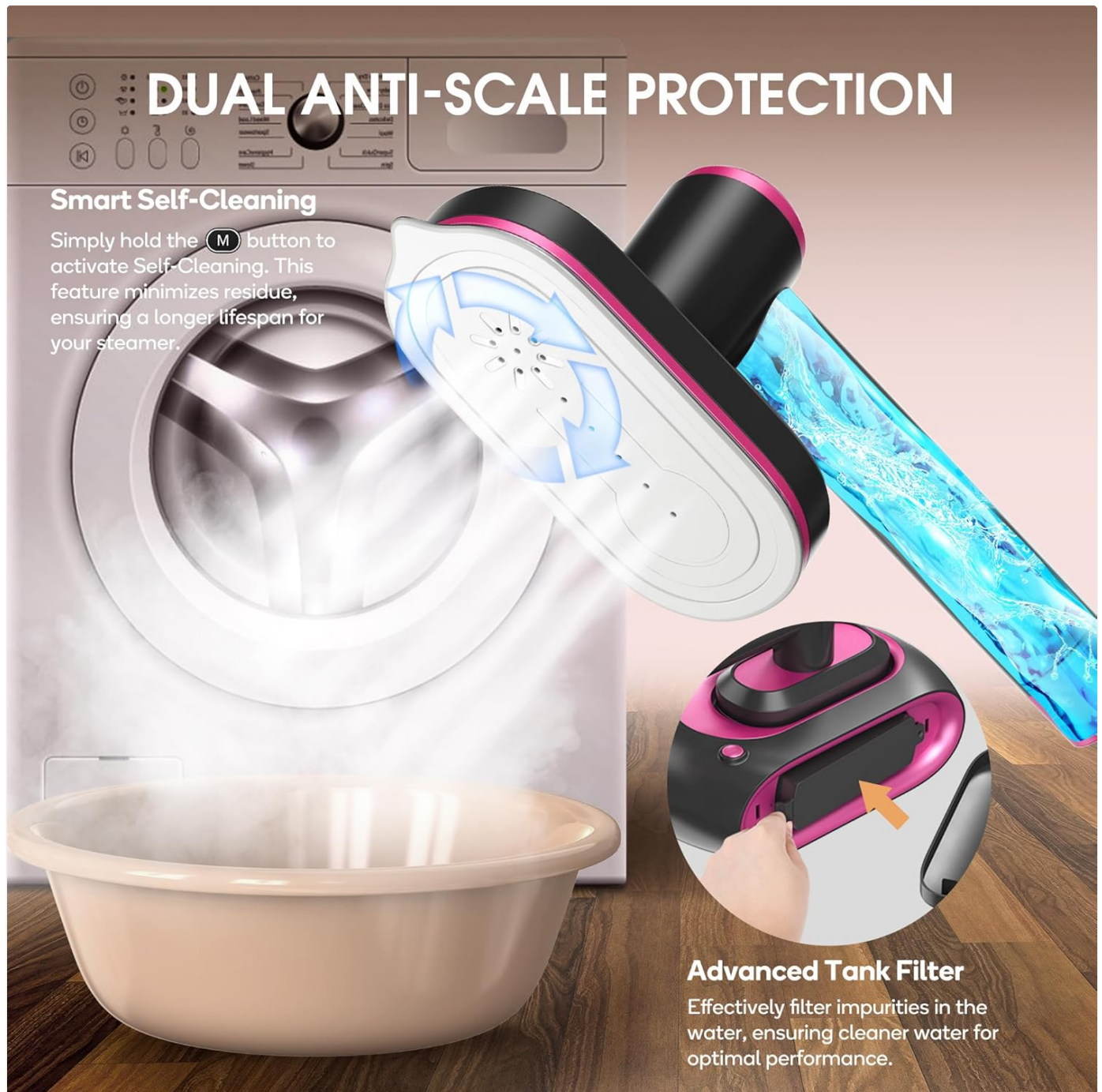
Image 5.1.1: Visual guide to the self-cleaning process, showing water being expelled from the soleplate, and the location of the advanced tank filter.

The appliance features a one-step self-cleaning function to minimize mineral residue and prolong its lifespan.