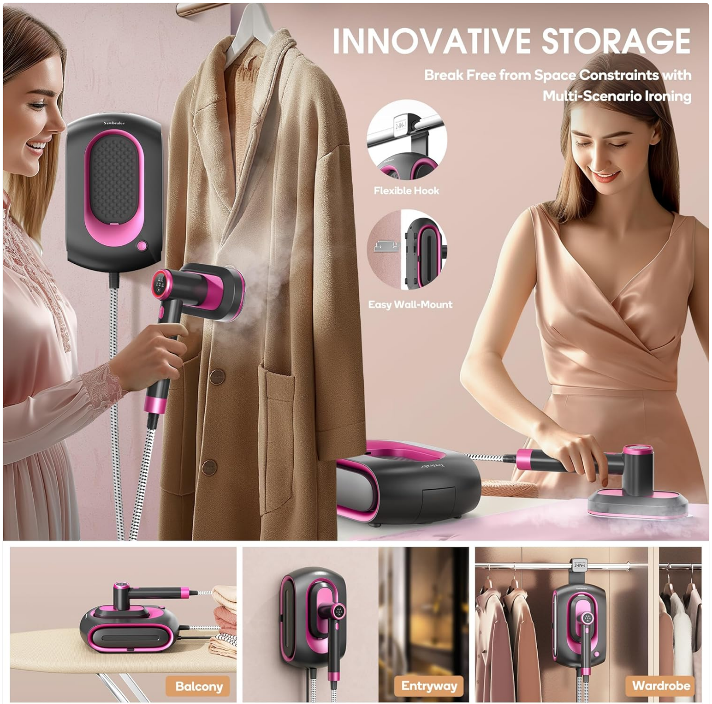
Image 3.3.1: Various innovative storage and usage scenarios for the steam iron, including hanging on a rod and wall-mounting.