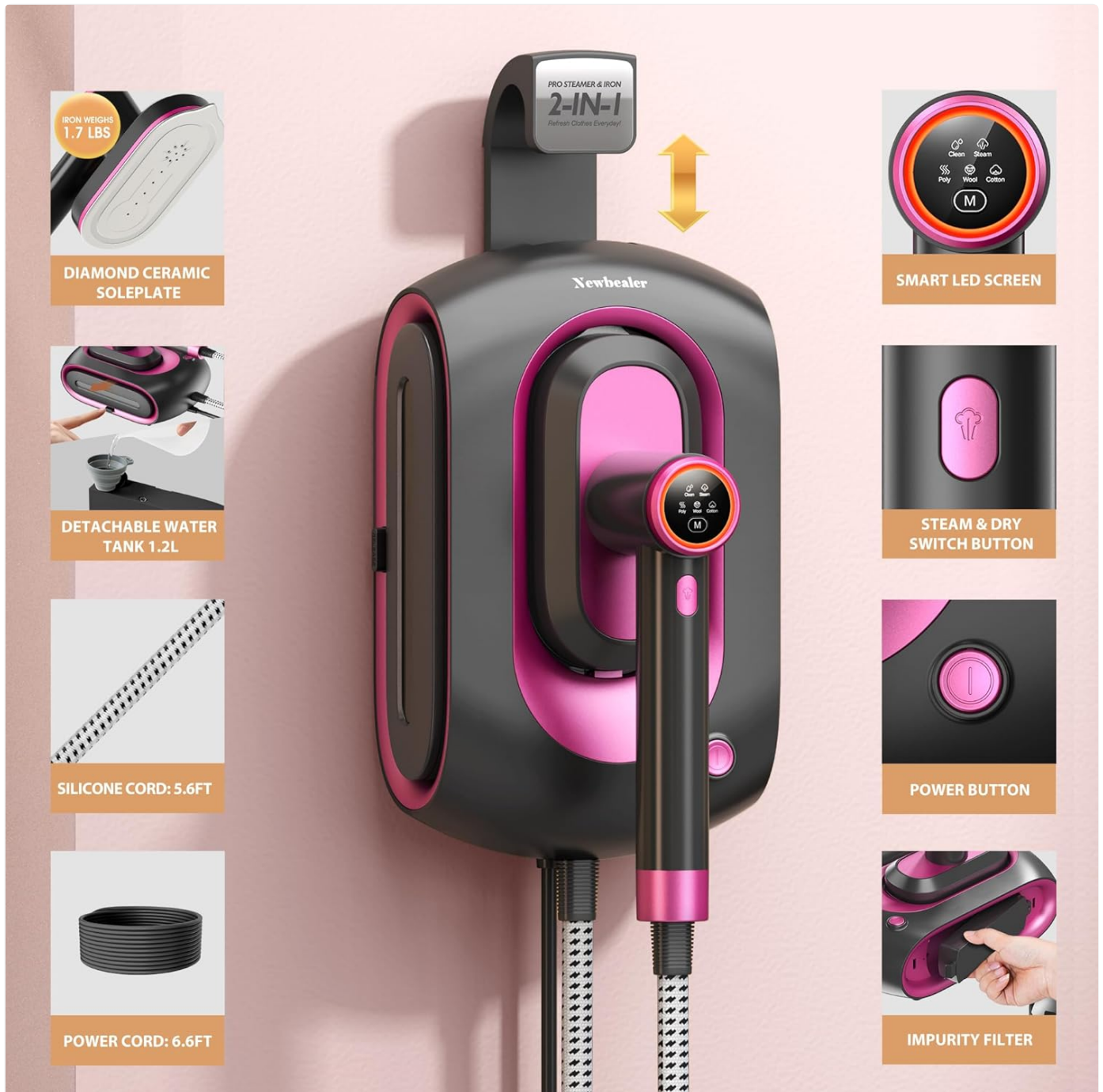
Image 2.2.1: Overview of the Newbealer 2-in-1 Pro Steam Station Iron components. This image highlights the main unit, the detachable handheld steamer, the 1.2L water tank, the smart LED screen for settings, the steam and dry switch button, the power button, and the impurity filter.

Familiarize yourself with the main components of your Newbealer Steam Station Iron: