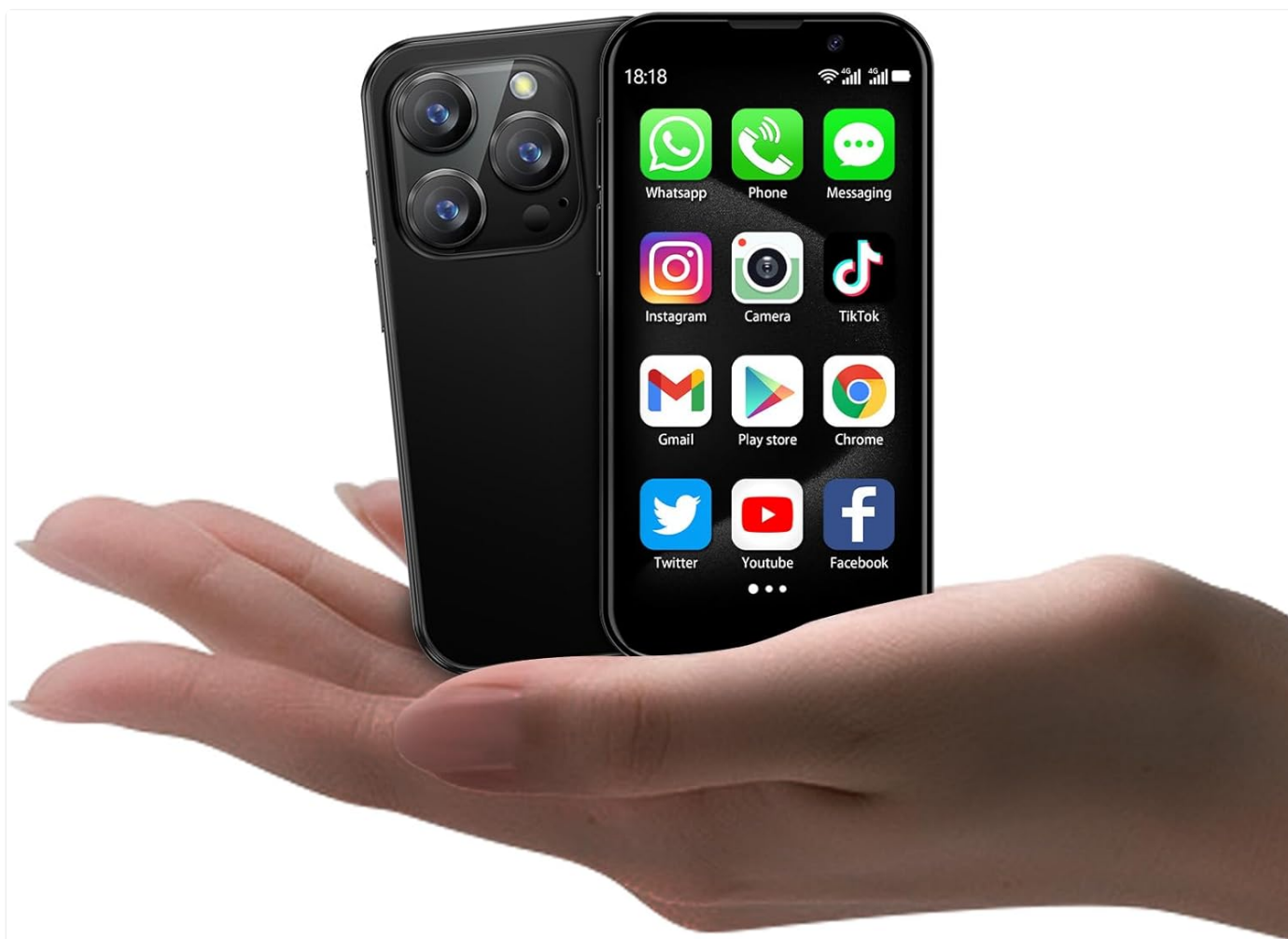
Image: The soyes Mini Smartphone, demonstrating its small size as it rests in the palm of a hand. The screen displays various app icons.

The soyes Mini Smartphone is designed to be the world's smallest and most compact mobile phone, offering essential smartphone functionalities in a pocket-sized device. Ideal for kids, students, or as a backup phone, it features a 3.0-inch HD touch screen, dual SIM support, and runs on Android 8.1. This manual provides comprehensive instructions for setting up, operating, and maintaining your device.