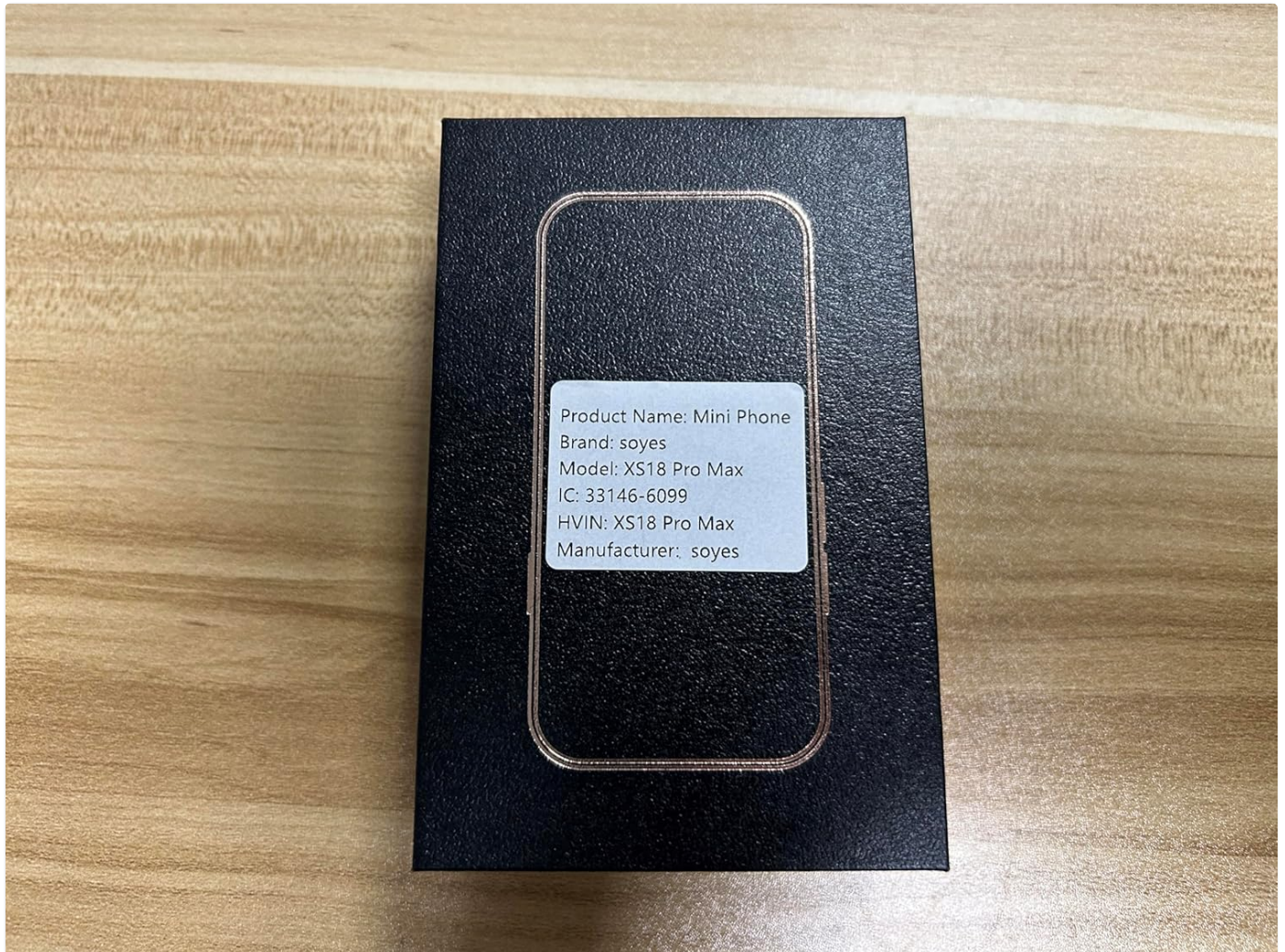
Image: The compact black packaging box for the soyes Mini Smartphone, with product details visible on a label.