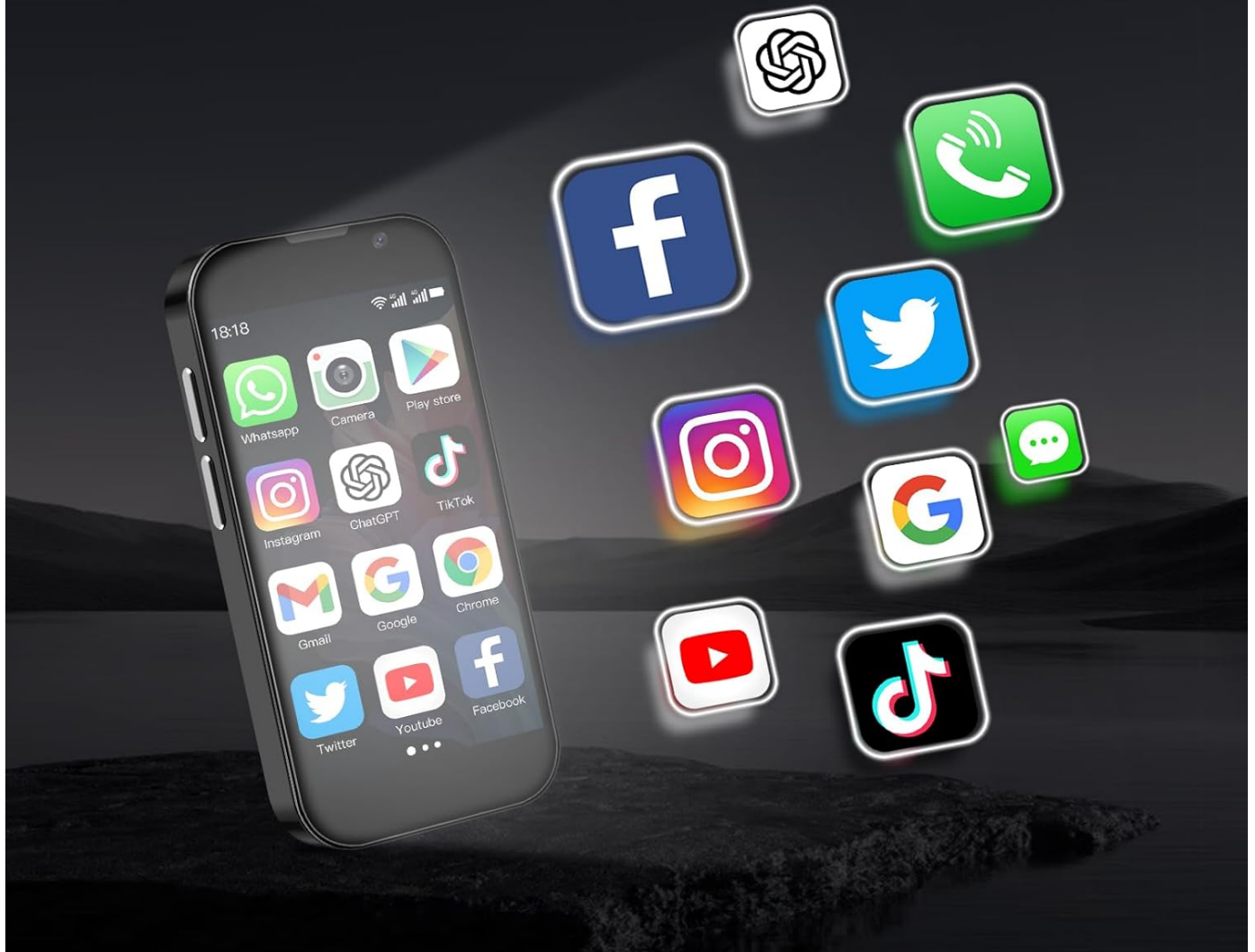
Image: The soyes Mini Smartphone screen showing a variety of popular applications, demonstrating its compatibility with mainstream apps on the Android platform.

Lightweight and compact body, pure Android system, compatible with various mainstream apps, smooth and fast multitasking operation, easy to meet daily needs.