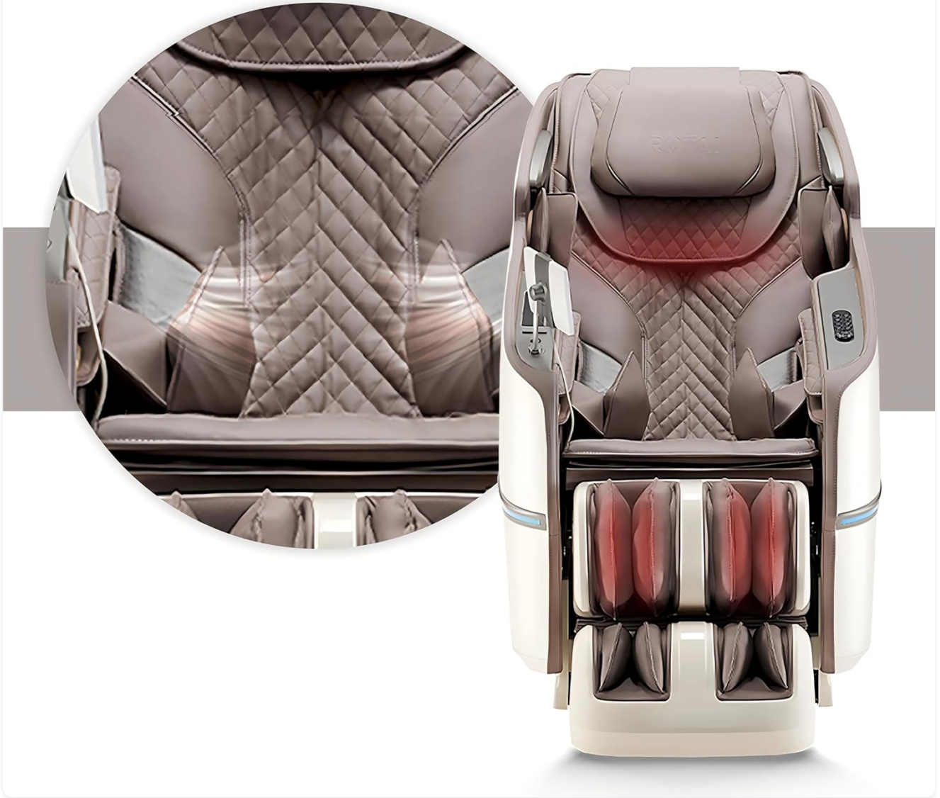
Image 5.2: Diagram showing the Zero Gravity recline feature, highlighting massage areas for hip, waist, back, head, neck, and shoulders.