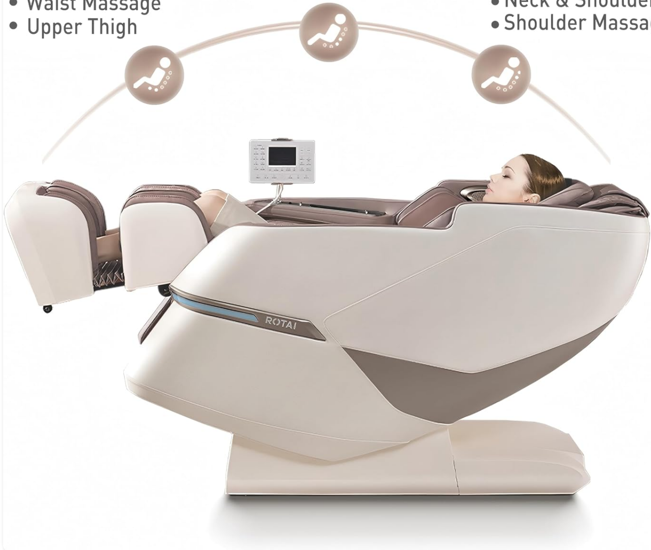
Image 1.1: The ROTAI 4D Massage Chair in a living room setting, with a person comfortably seated.