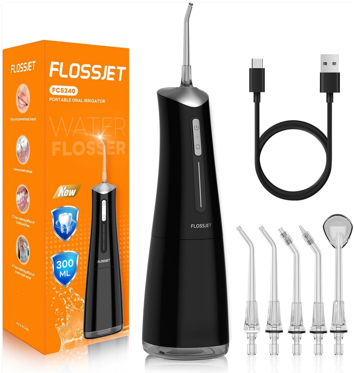
Image 1.1: FlossJet Cordless Oral Irrigator FC5240 with included tips and USB charging cable.