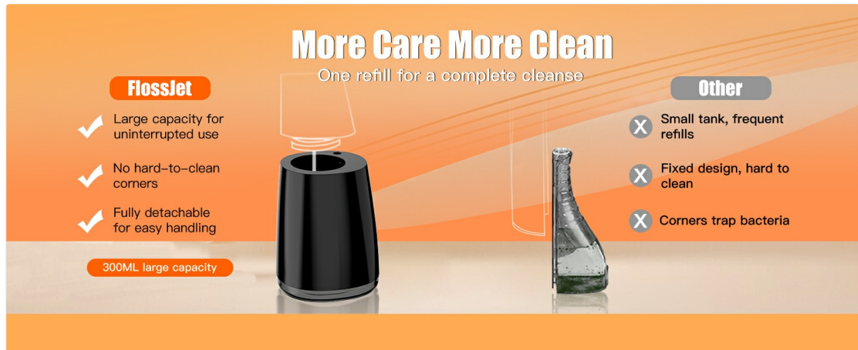
Image 6.1: The detachable water tank design of the FlossJet FC5240 facilitates easy cleaning and prevents residue accumulation.