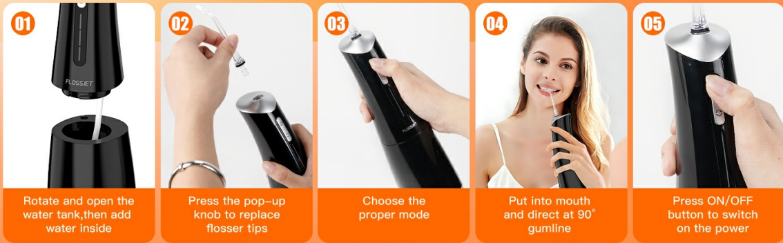
Image 4.3: Visual guide for setting up the FlossJet FC5240, including filling the tank and attaching tips.