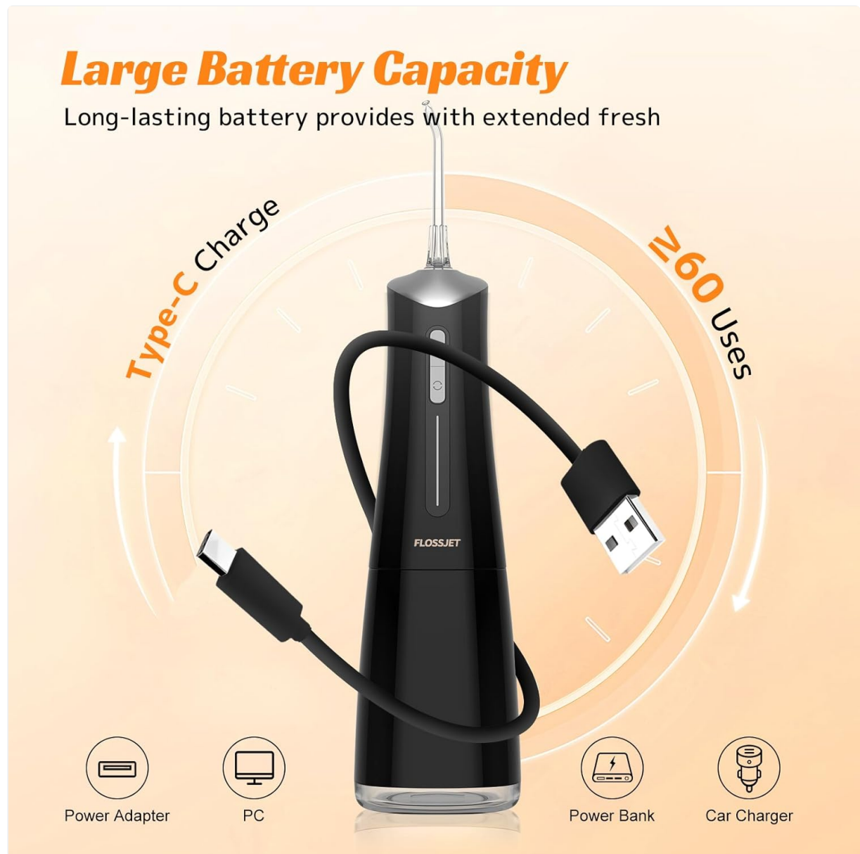
Image 4.1: The FlossJet FC5240 charging via USB-C, compatible with various power sources.

bank, or car charger. The charging indicator light will show the charging status. A full charge provides approximately 14 to 21 days of use, or up to 60 uses.