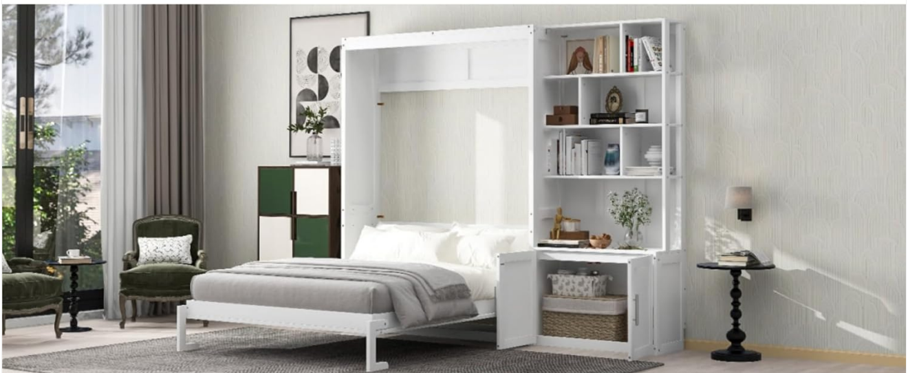
Figure 3: Illustration of the folding design, showing the bed in both extended and retracted positions, integrated with the storage unit.