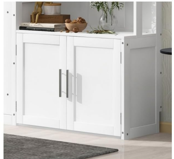
Figure 2: Detail of the integrated cabinet and shelves, designed for organizing books, ornaments, and other items.

Maximize storage with shelves and a cabinet beside the bed, keeping your room tidy by neatly stowing books, ornaments, clothes, and jewelry.