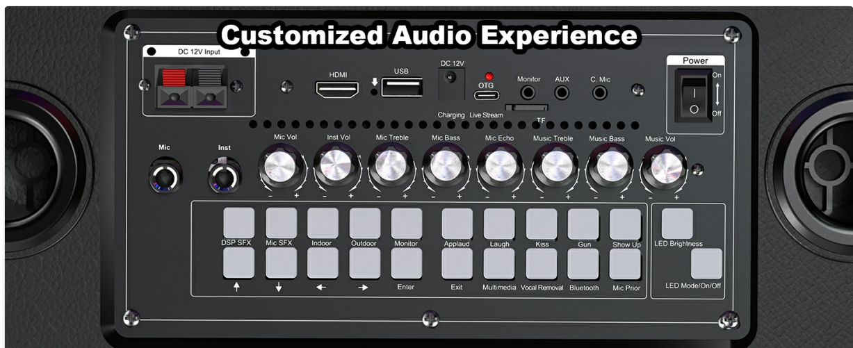
Image 4.3: Detailed view of the control panel for customized audio experience.

The control panel offers comprehensive sound customization: