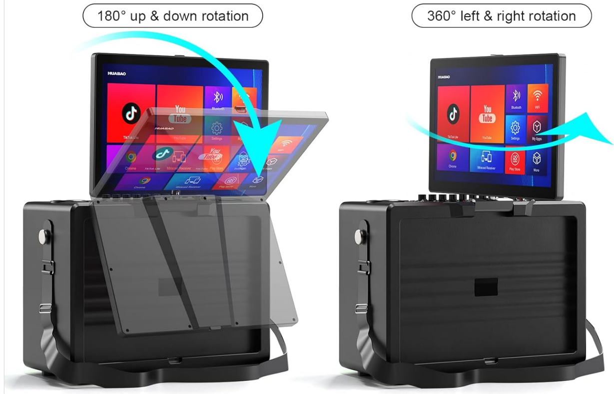
Image 2.3: Tablet rotation capabilities (180° vertical, 360° horizontal).

The large touchscreen is rotatable and it is convenient for you both in use and storage.