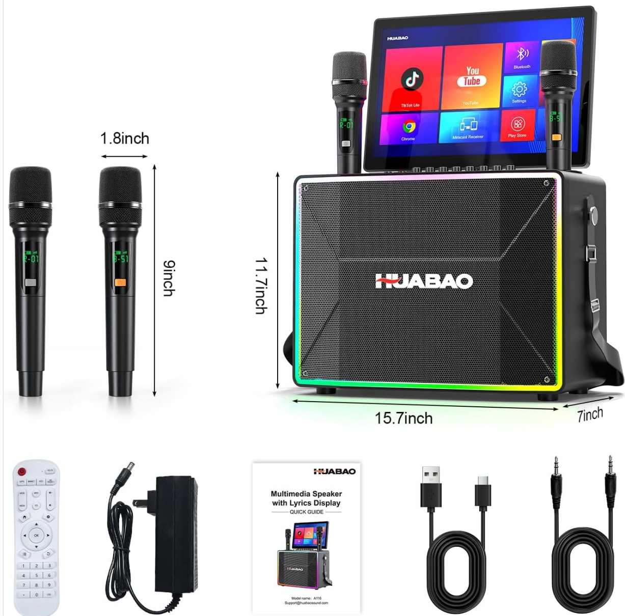
Image 2.1: All components included in the HUABAO Smart Karaoke Machine package.