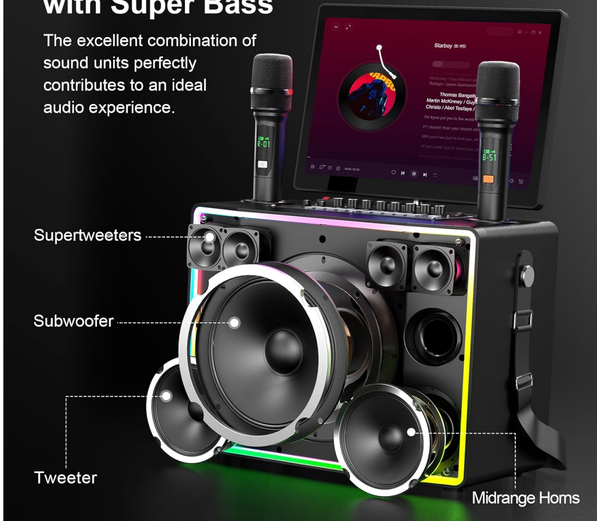
Image 2.4: Internal speaker configuration for optimal sound quality.

The excellent combination of sound units perfectly contributes to an ideal audio experience.