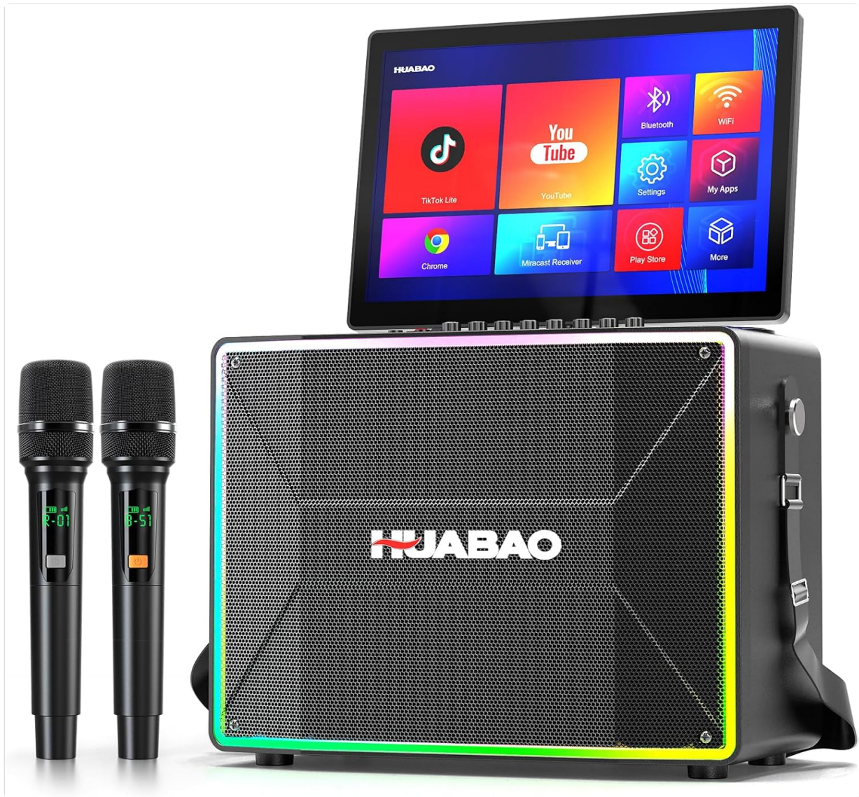
Image 1.1: HUABAO Smart Karaoke Machine (Model A116) with its 14-inch display and two wireless microphones.