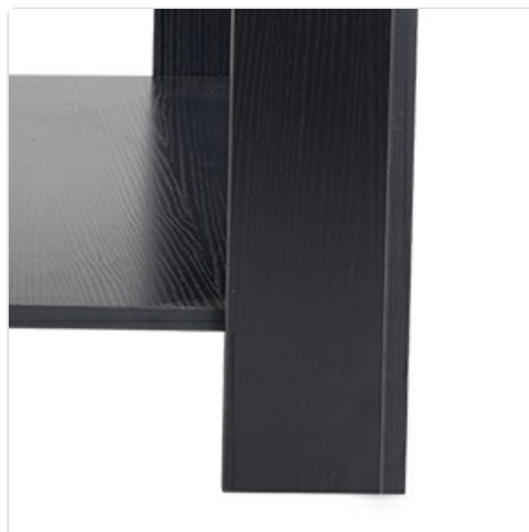
Image: A close-up view of one of the table's sturdy legs, showcasing the wood construction and finish.