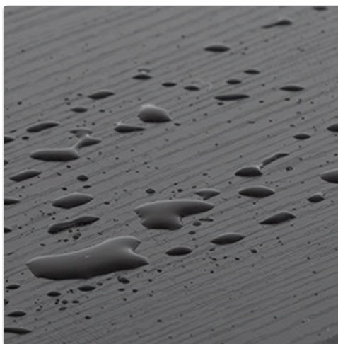
Image: A close-up shot of water beading on the table's surface, indicating its waterproof properties.