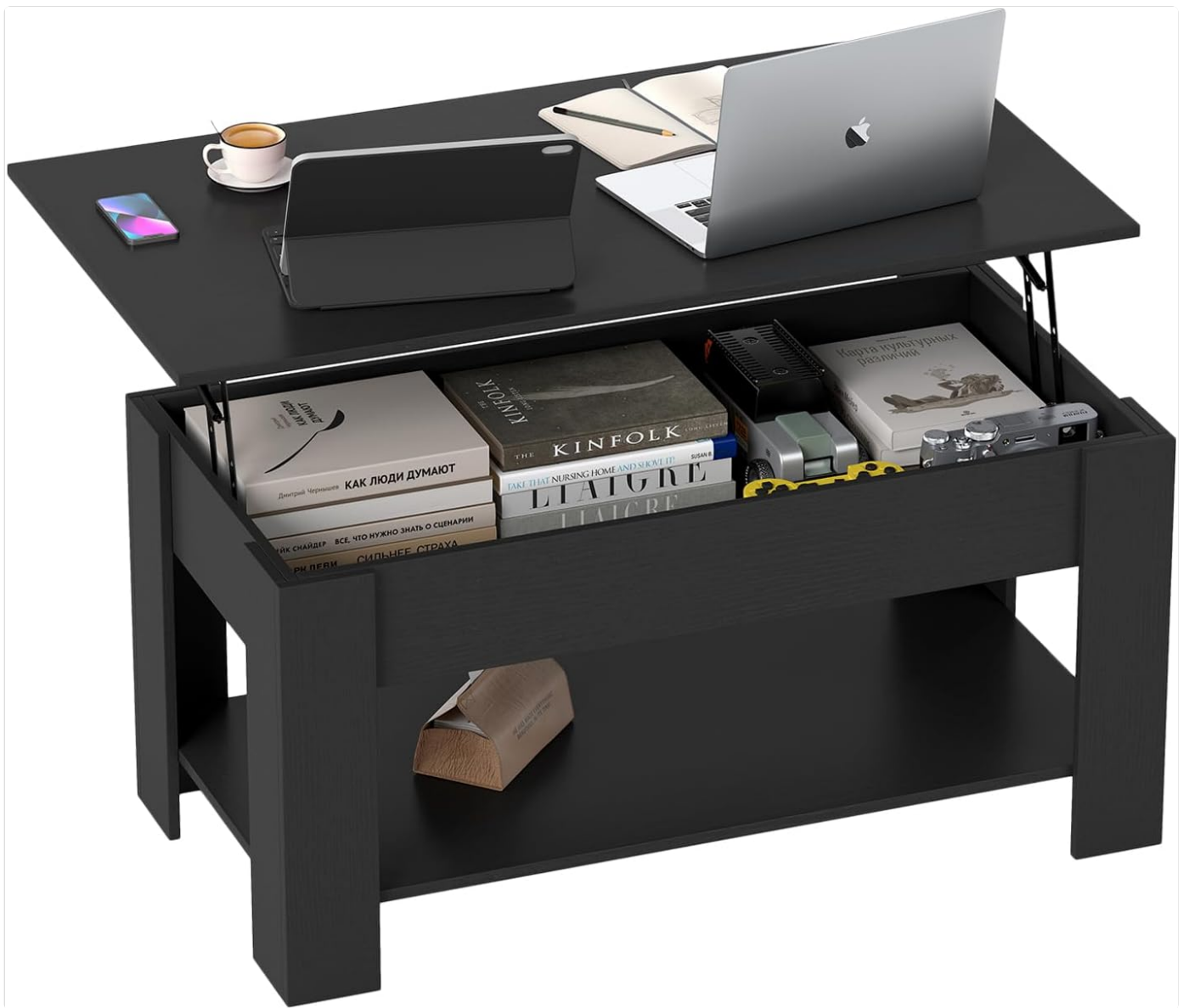
Image: The FDW Lift Top Coffee Table in its open configuration, revealing a spacious hidden storage compartment. A laptop and tablet are placed on the elevated tabletop, demonstrating its functionality as a workspace.