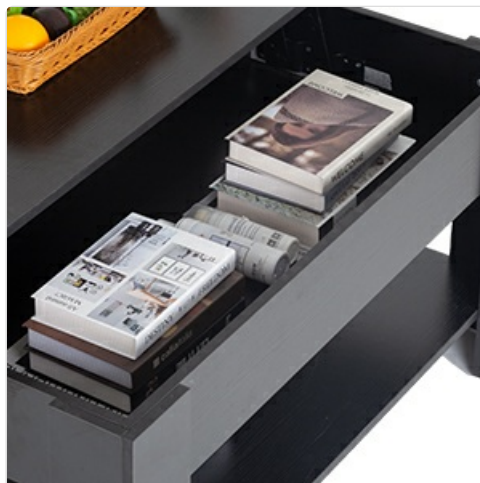
Image: A close-up of the hidden storage area, showing books neatly stored within the compartment.