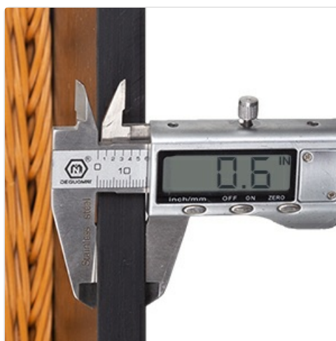
Image: A digital caliper measuring the tabletop thickness, confirming it is 0.6 inches.