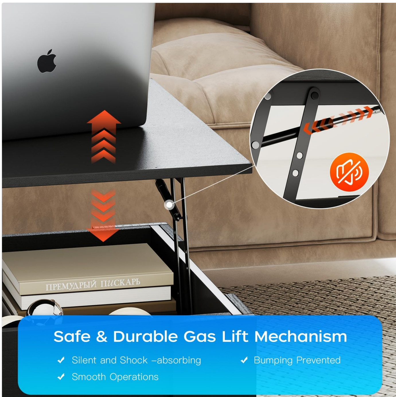
Image: A detailed view of the safe and durable gas lift mechanism, highlighting its silent, shock-absorbing, and smooth operation, designed to prevent bumping.