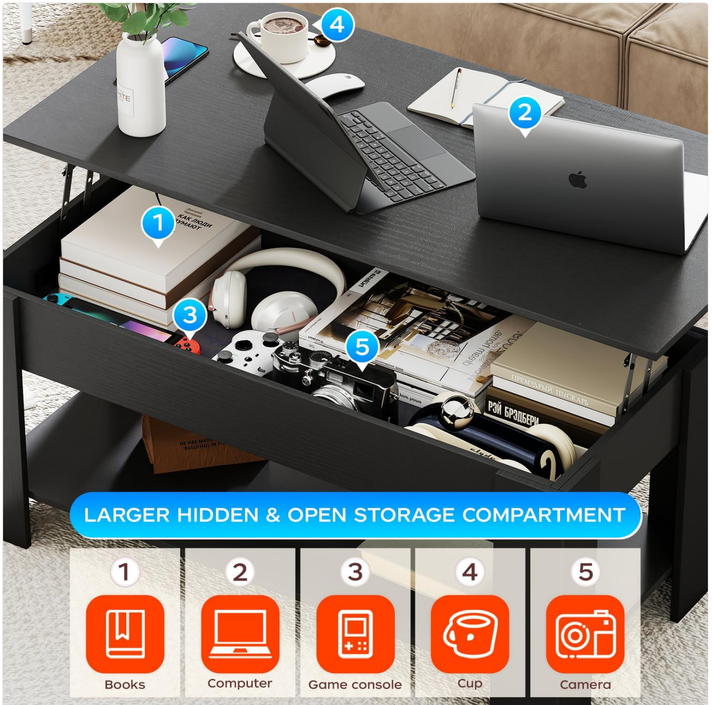
Image: An illustration of the spacious hidden storage compartment, demonstrating its capacity to hold books, a laptop, game console, cups, and a camera.