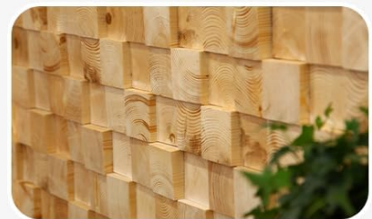
Selected high-quality wood