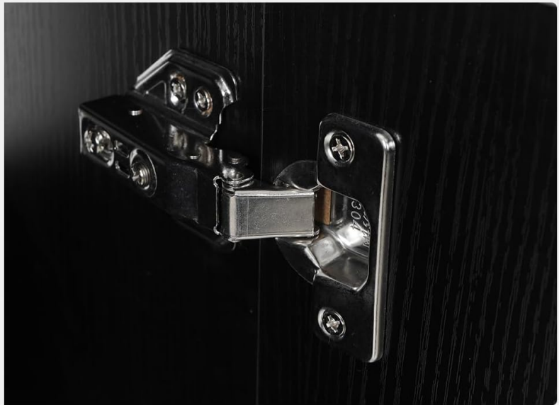
— 304 Stainless Steel Hinge

Image: Details of the zinc alloy handle and 304 stainless steel hinge, indicating component quality for assembly.