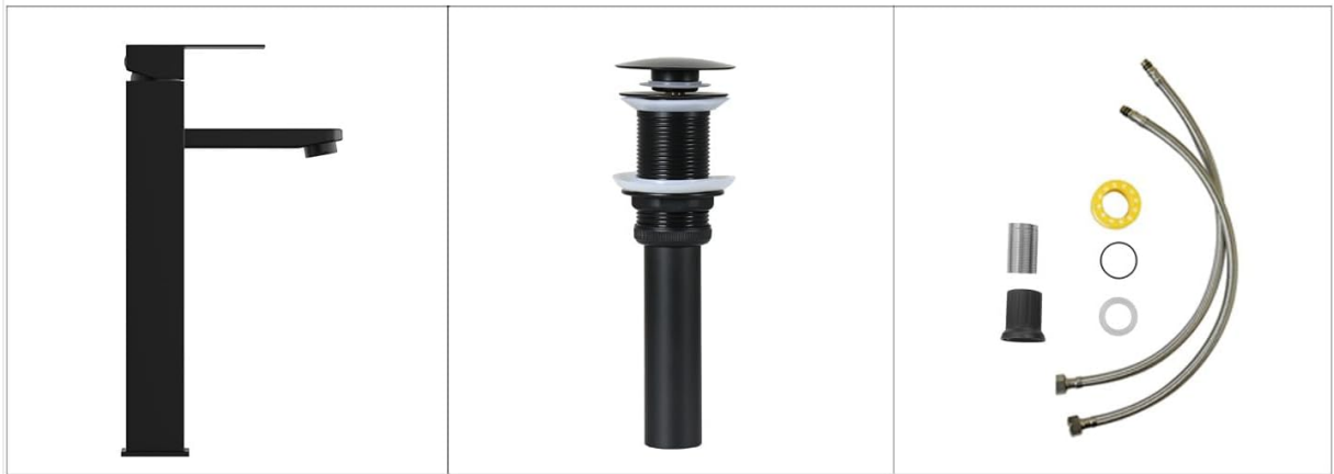
Image: Included faucet, pop-up drain, and hot/cold water lines for plumbing connections.