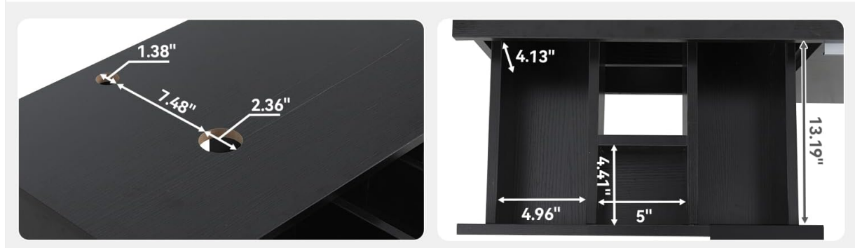
Image: Detailed dimensions of the vanity cabinet, including width, depth, height, and internal storage measurements.