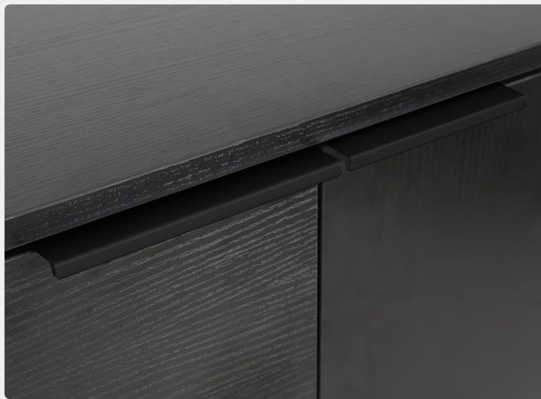
— Zinc Alloy Handle