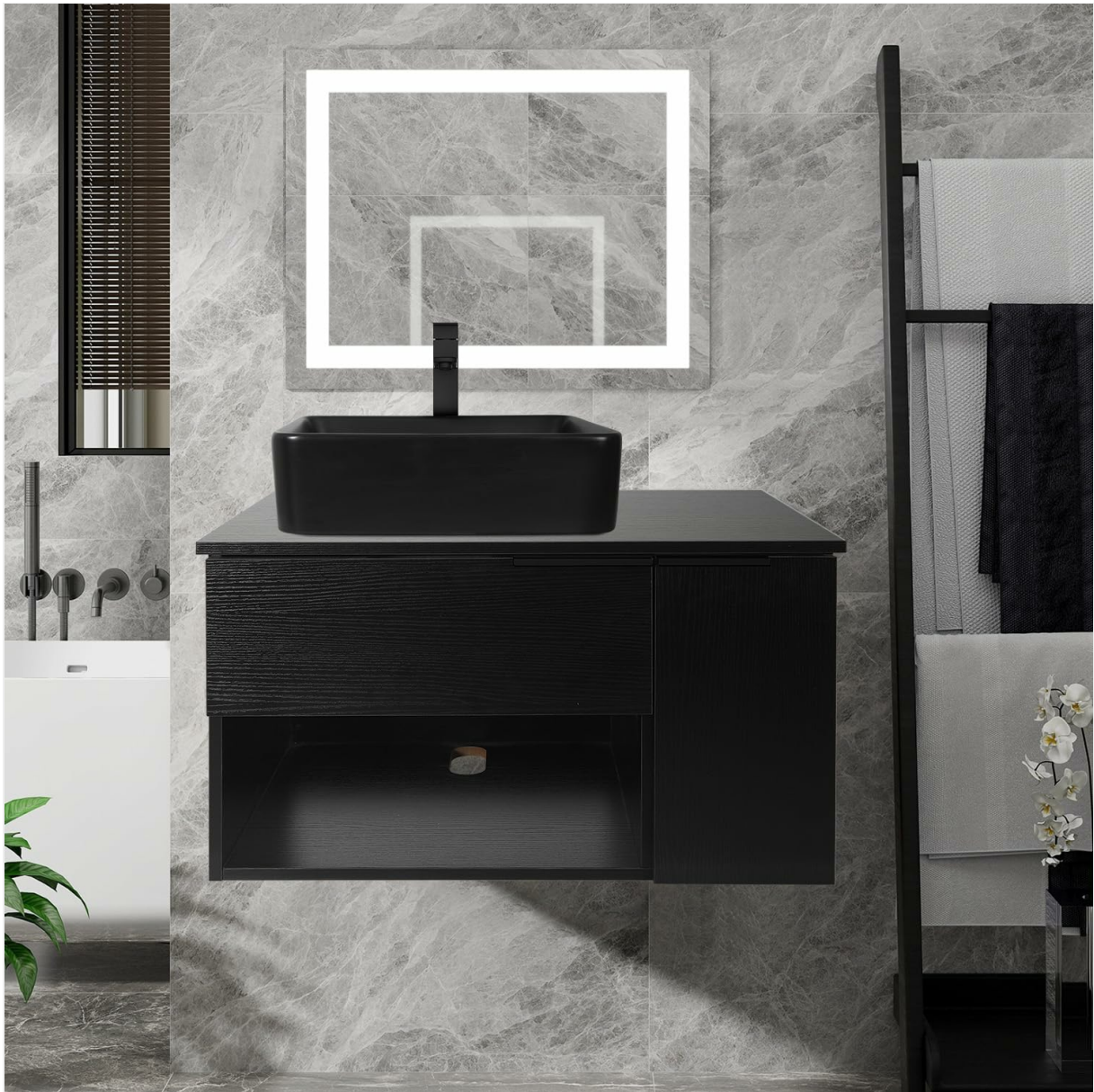
Image: The SOLIDEE 28 Inch Black Floating Bathroom Vanity with a black ceramic vessel sink.