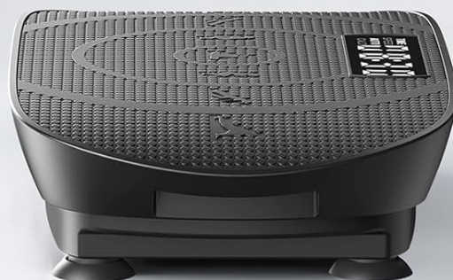
Figure 3: Smart AUTO ON/OFF functionality with gravity sensor.