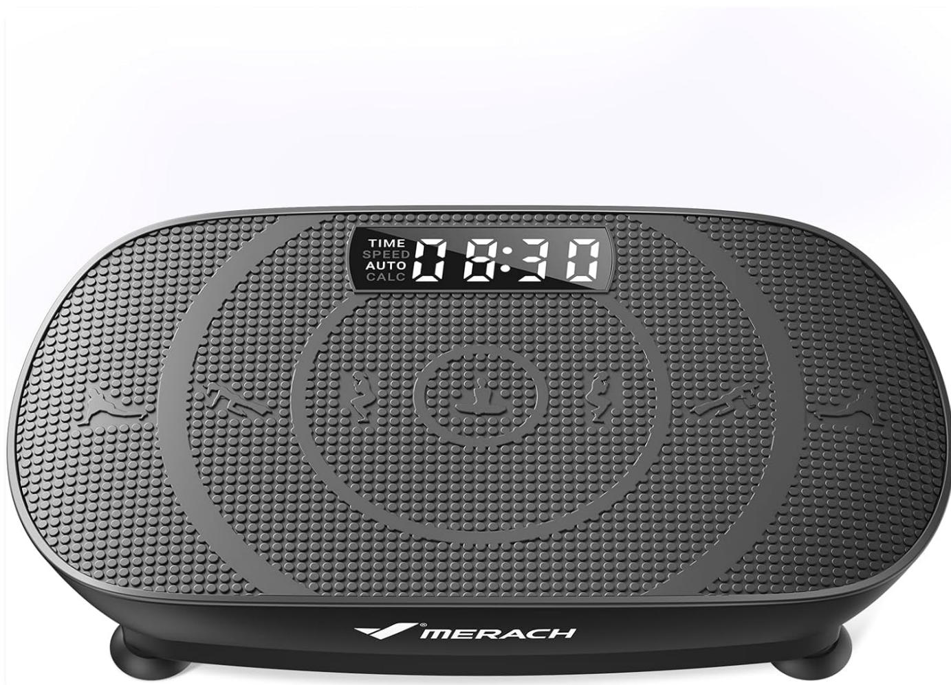
Figure 1: MERACH Vibration Plate Exercise Machine (Black model)

The MERACH Vibration Plate Exercise Machine is designed to enhance your fitness routine through whole-body vibration. This innovative equipment stimulates muscles, promotes circulation, and supports various fitness goals. It features multiple exercise modes, speed levels, Bluetooth connectivity, and a user-friendly design for convenient home use.