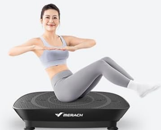
Figure 6: Examples of multi-function exercises for effective full-body workouts.