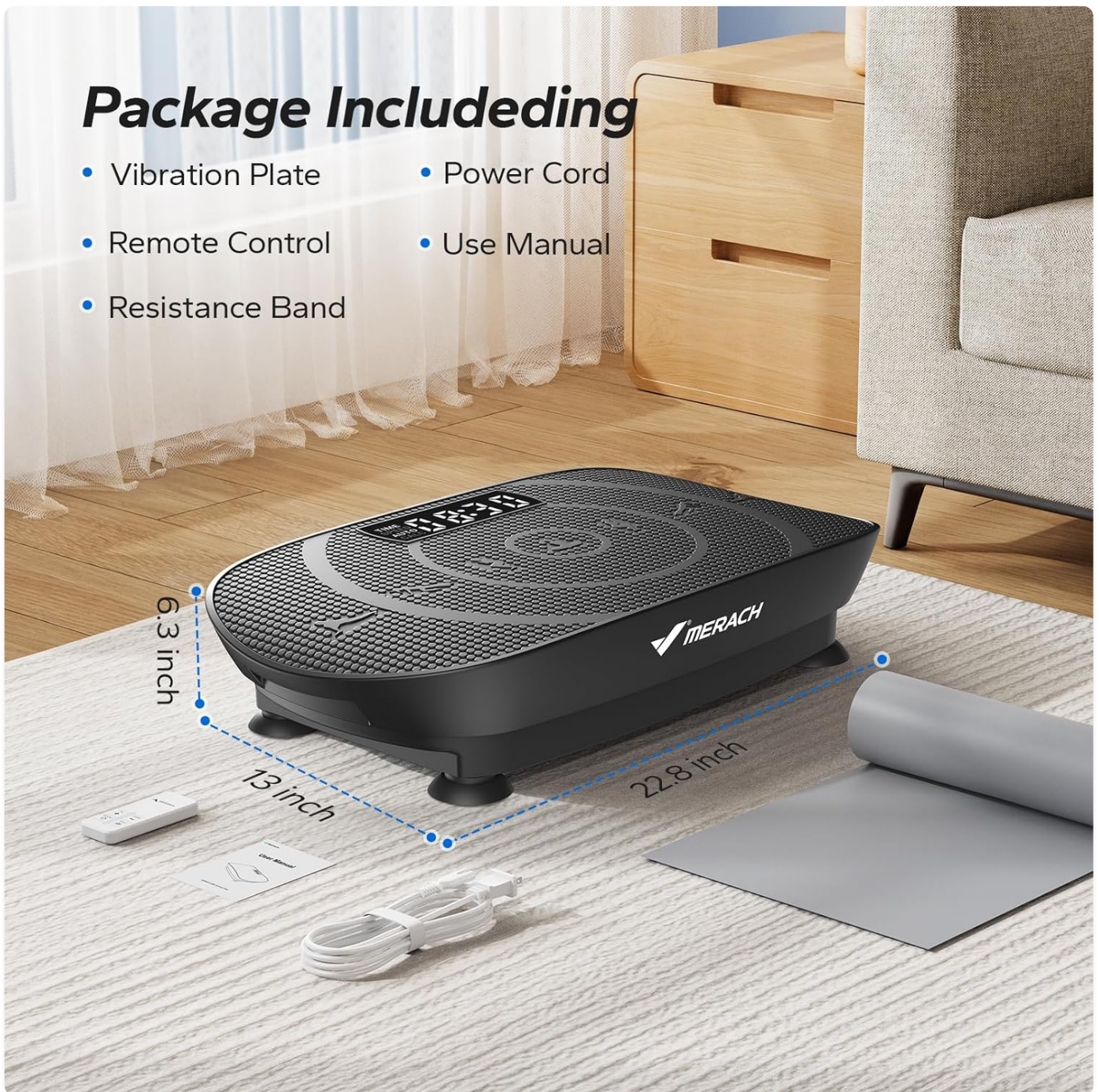
Figure 2: Included components in the MERACH Vibration Plate package.