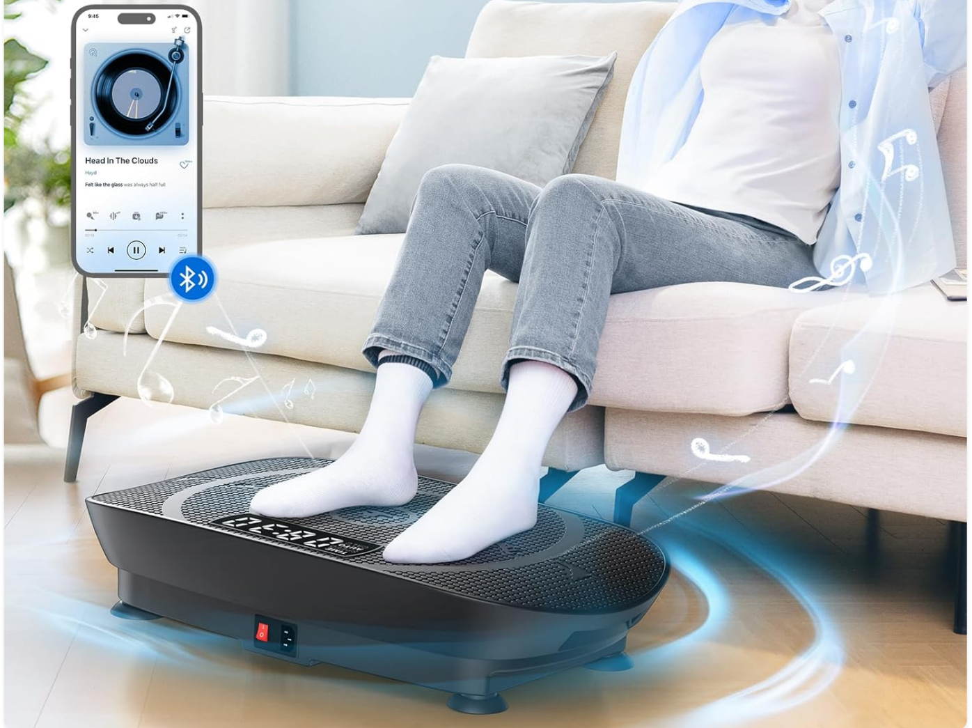
Figure 5: Enjoy your workout by connecting your phone with Bluetooth to play music.

Connect your phone with Bluetooth to Play Music