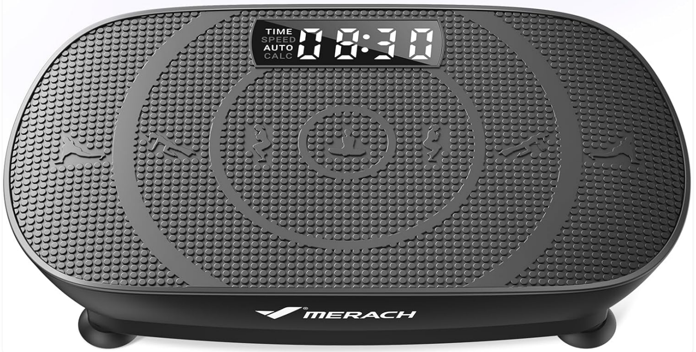
Figure 4: The LED display shows time, speed, and mode settings.