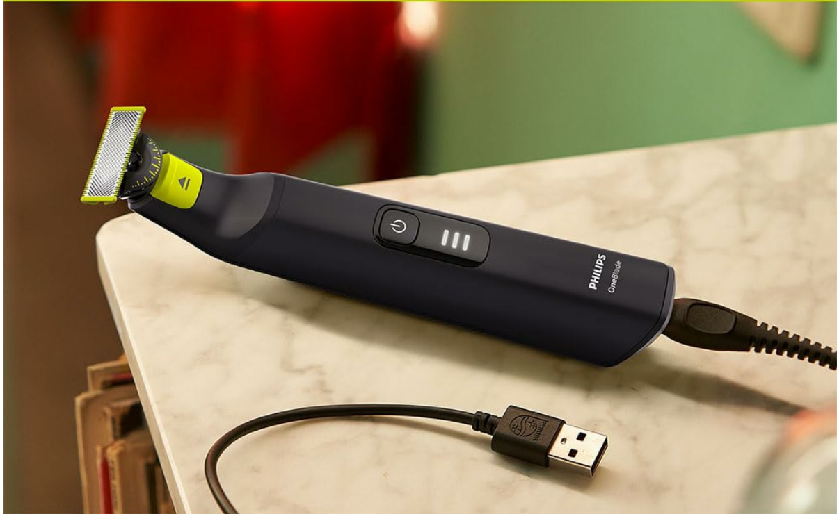
Image: The rechargeable lithium battery provides 120 minutes of power after a 1-hour charge.