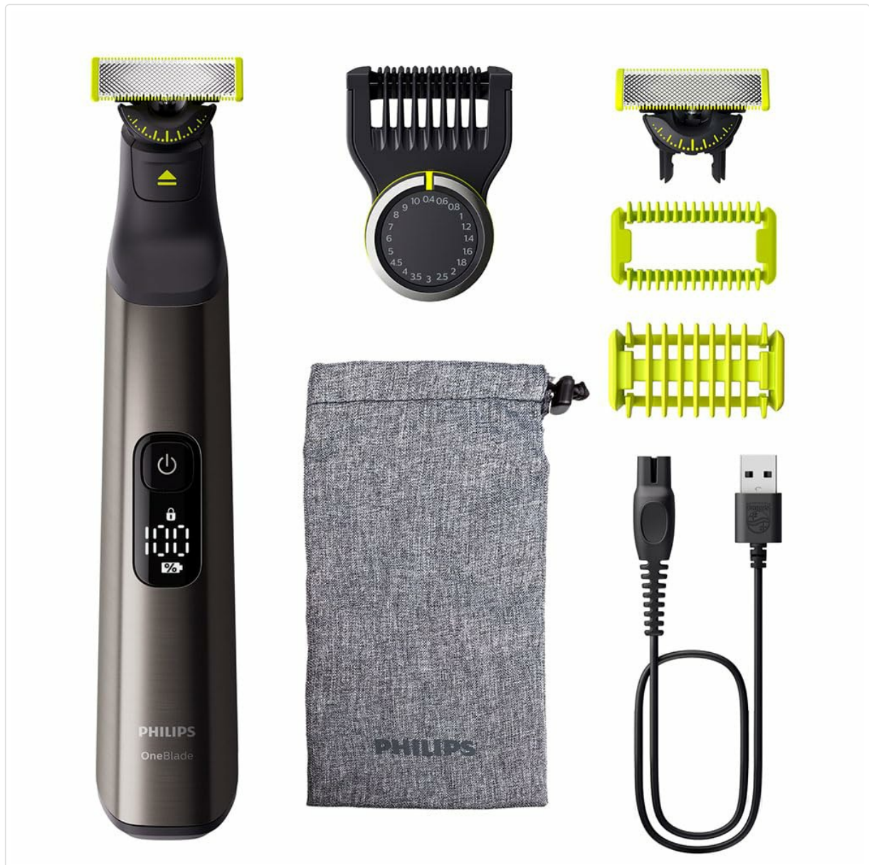
Image: Philips OneBlade Pro 360 QP6552-15 with its various attachments and charging cable.