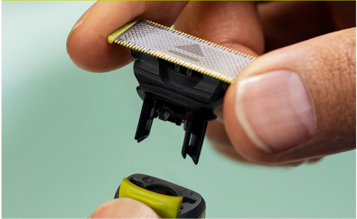
Image: The blade wear indicator, showing an icon that signals when it's time to change the blade.

El icono de expulsión te avisa cuando es hora de cambiar la cuchilla.