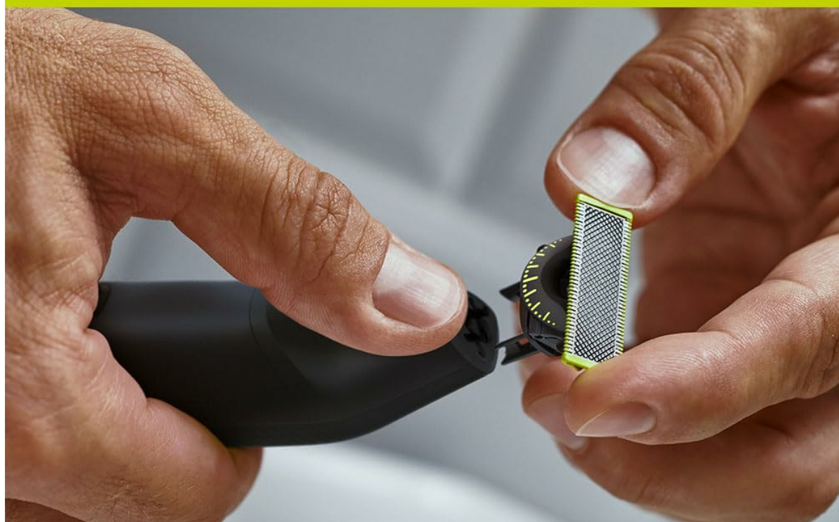
Image: Replacing the stainless steel blade, which lasts up to 4 months.

que dura hasta 4 meses de uso para mantener esa sensación de frescura.