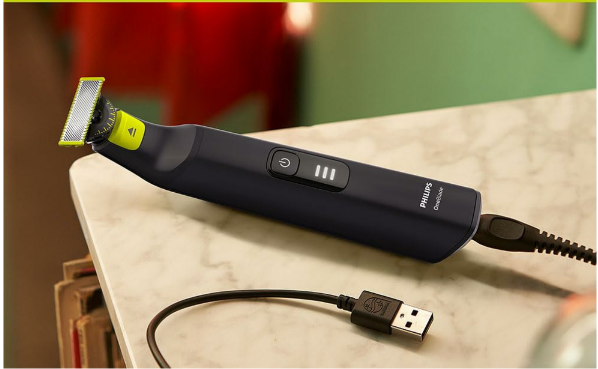
Image: The Philips OneBlade Pro 360 charging via its USB cable.