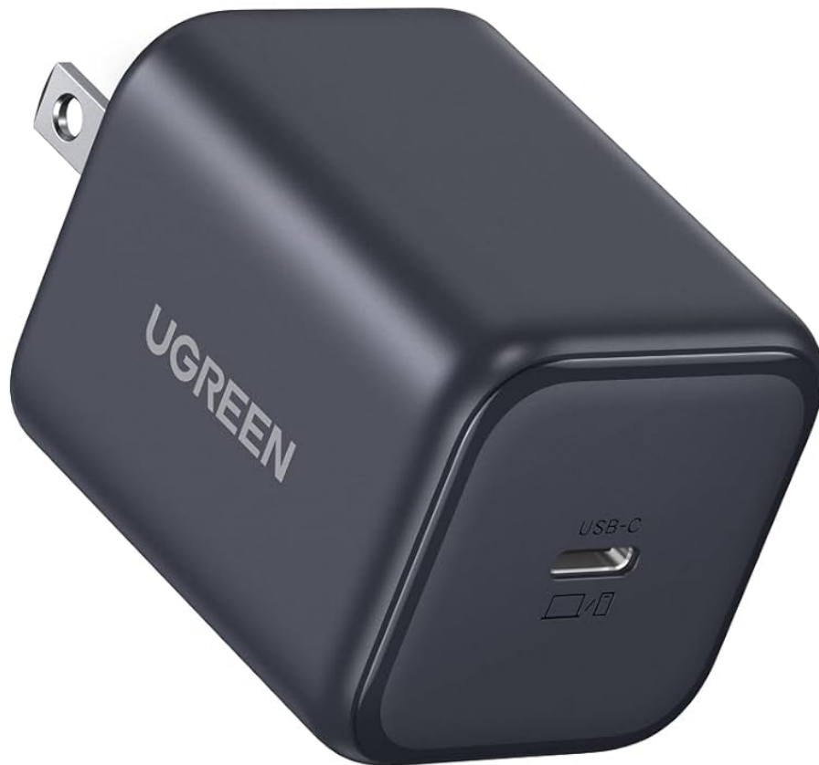
Figure 1: Front view of the UGREEN 45W GaN USB-C Fast Charger.