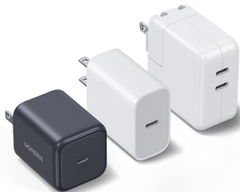
Figure 2: The compact design allows for easy storage and portability, fitting conveniently into bags or pockets.