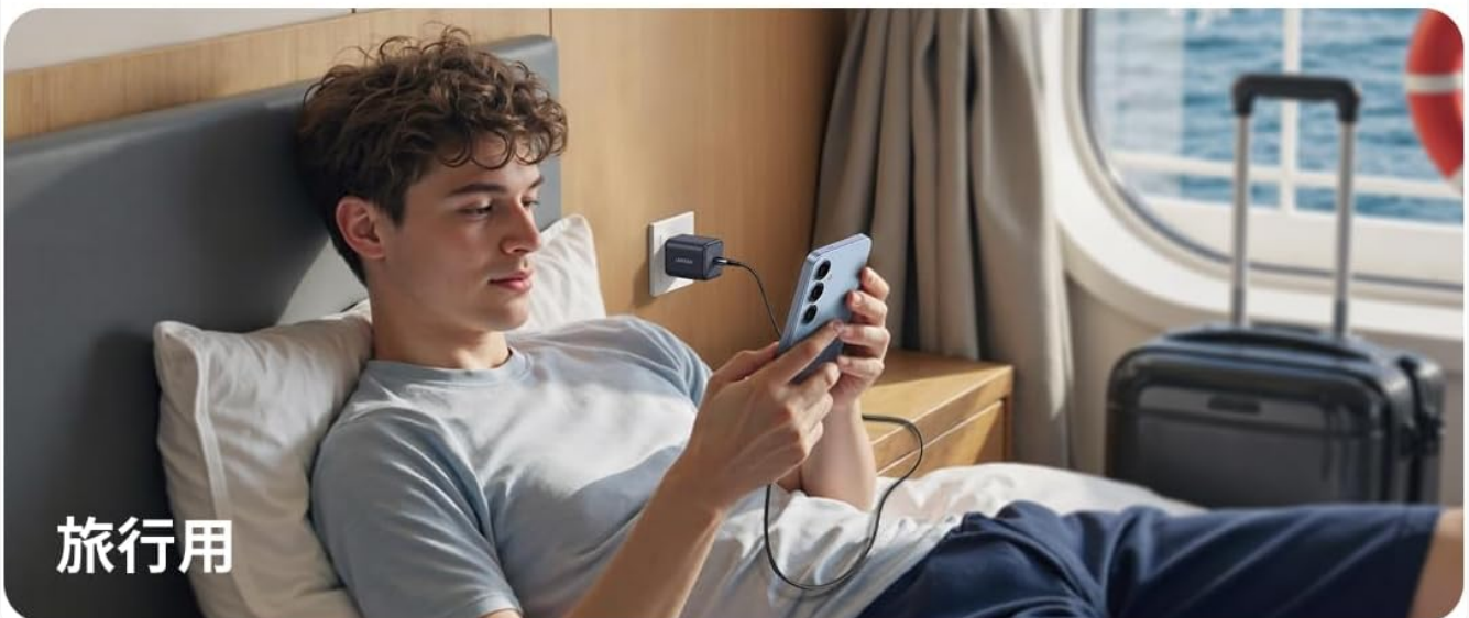
Figure 6: Versatile for use in various settings, including work, home, and during travel.