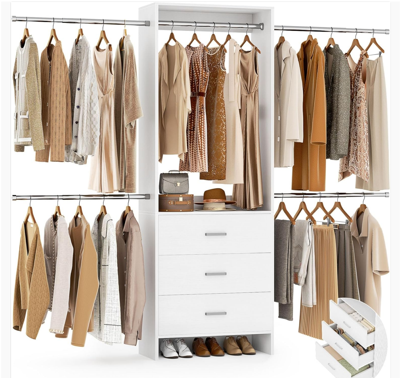
Figure 4.1: Fully assembled Aheaplus Closet System with hanging clothes and shoes. This image displays the complete Aheaplus Closet System, showcasing its central drawer unit, multiple hanging rods, and integrated shoe storage.