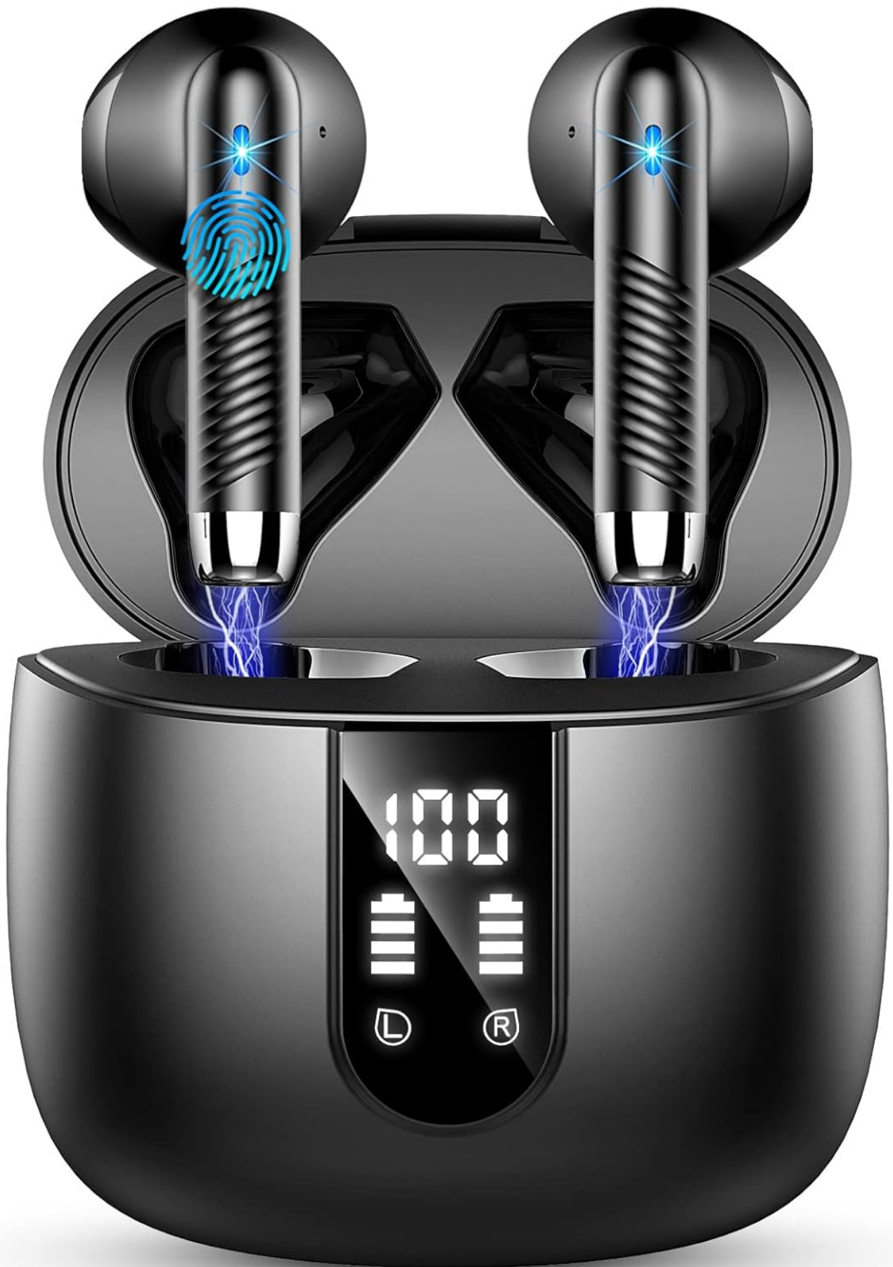
Image: The QXQ Wireless Earbuds in their charging case, showcasing the LED display.