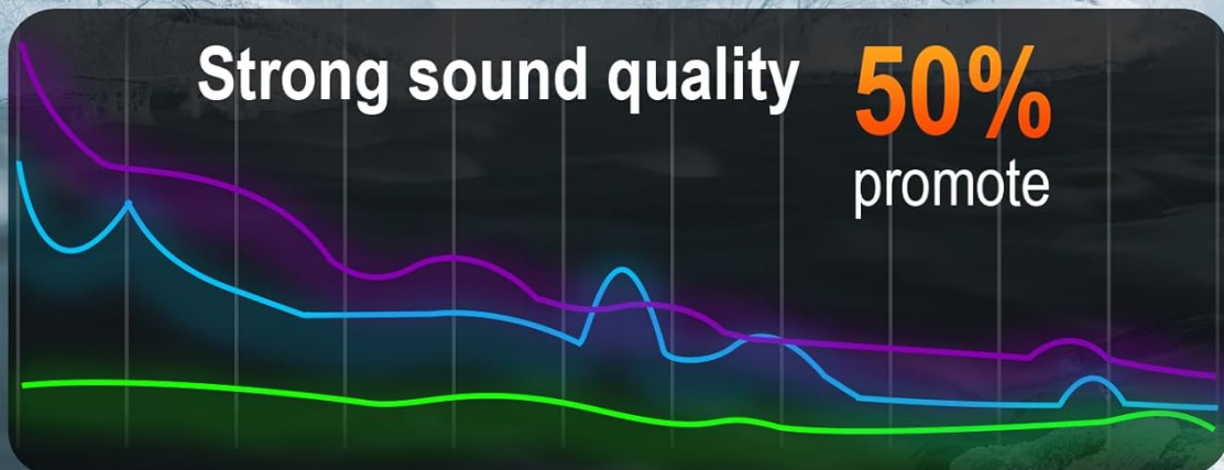
Image: Visual depicting the ENC noise cancelling feature, showing how environmental noise is reduced for clearer calls.