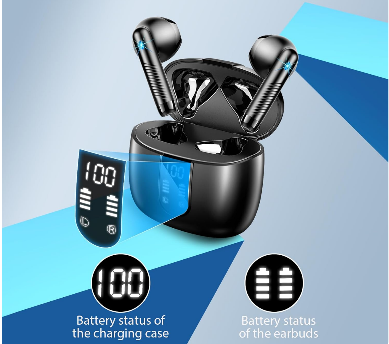
Image: Close-up of the charging case's dual LED digital display showing battery levels for the case and individual earbuds.