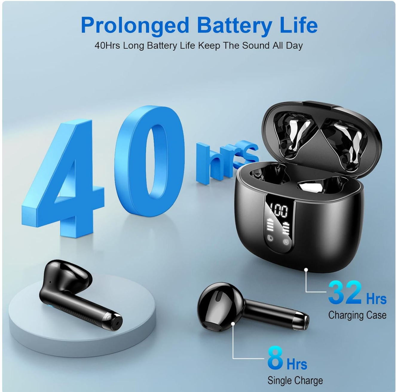
Image: Illustration of the 40-hour total playtime, with 8 hours from a single earbud charge and 32 hours from the charging case.

Before first use, fully charge the earbuds and the charging case. Connect the provided Type-C charging cable to the charging port on the case and a USB power source. The LED display on the charging case will show the battery status. A full charge provides up to 40 hours of total playtime with the charging case.