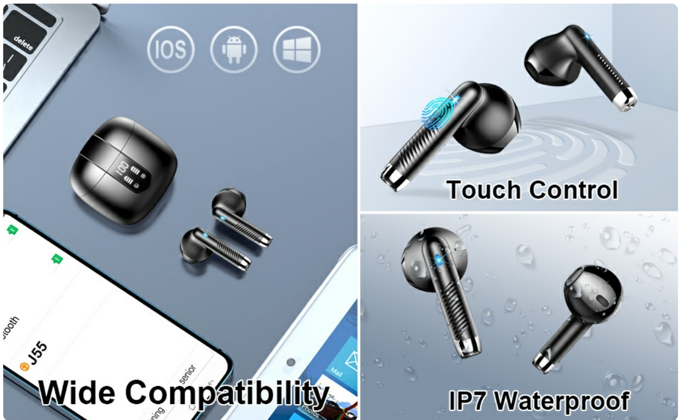
Image: Visual representation of the earbuds' wide compatibility with iOS, Android, and Windows devices, alongside touch control and IP7 waterproof features.