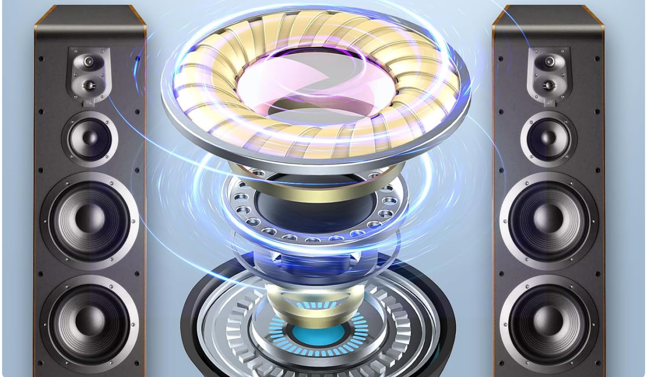
Image: Diagram highlighting the 14.2mm dynamic drivers and AAC advanced audio decoding for superior Hi-Fi sound quality. For calls, the four ENC (Environmental Noise Cancelling) microphones effectively reduce ambient noise, ensuring clear voice transmission even in noisy environments.