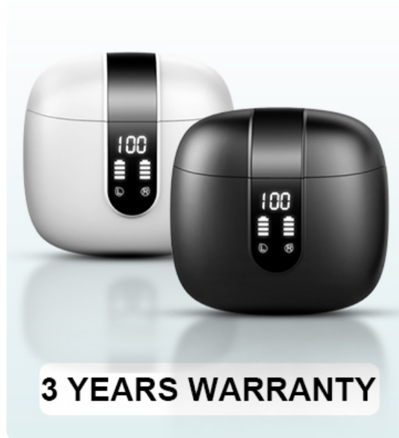
Image: A close-up of the earbuds and charging case, indicating a 3-year warranty.

For technical support, warranty claims, or any questions regarding your QXQ Wireless Earbuds, please contact our customer service team. Refer to the contact information provided on the product packaging or the official QXQ website.