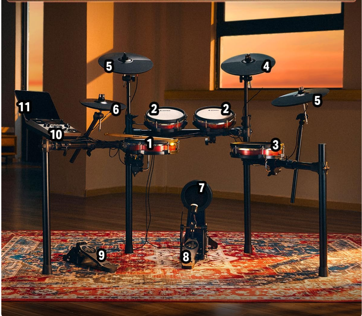
Figure 5: The DED-300X sound module with its intuitive controls.