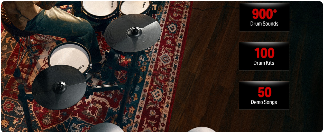
Figure 6: Navigating through various drum kits on the sound module.

Use the navigation buttons and rotary knob on the sound module to browse and select from 100 preset drum kits. You can also access over 900 individual sounds to customize your kits.