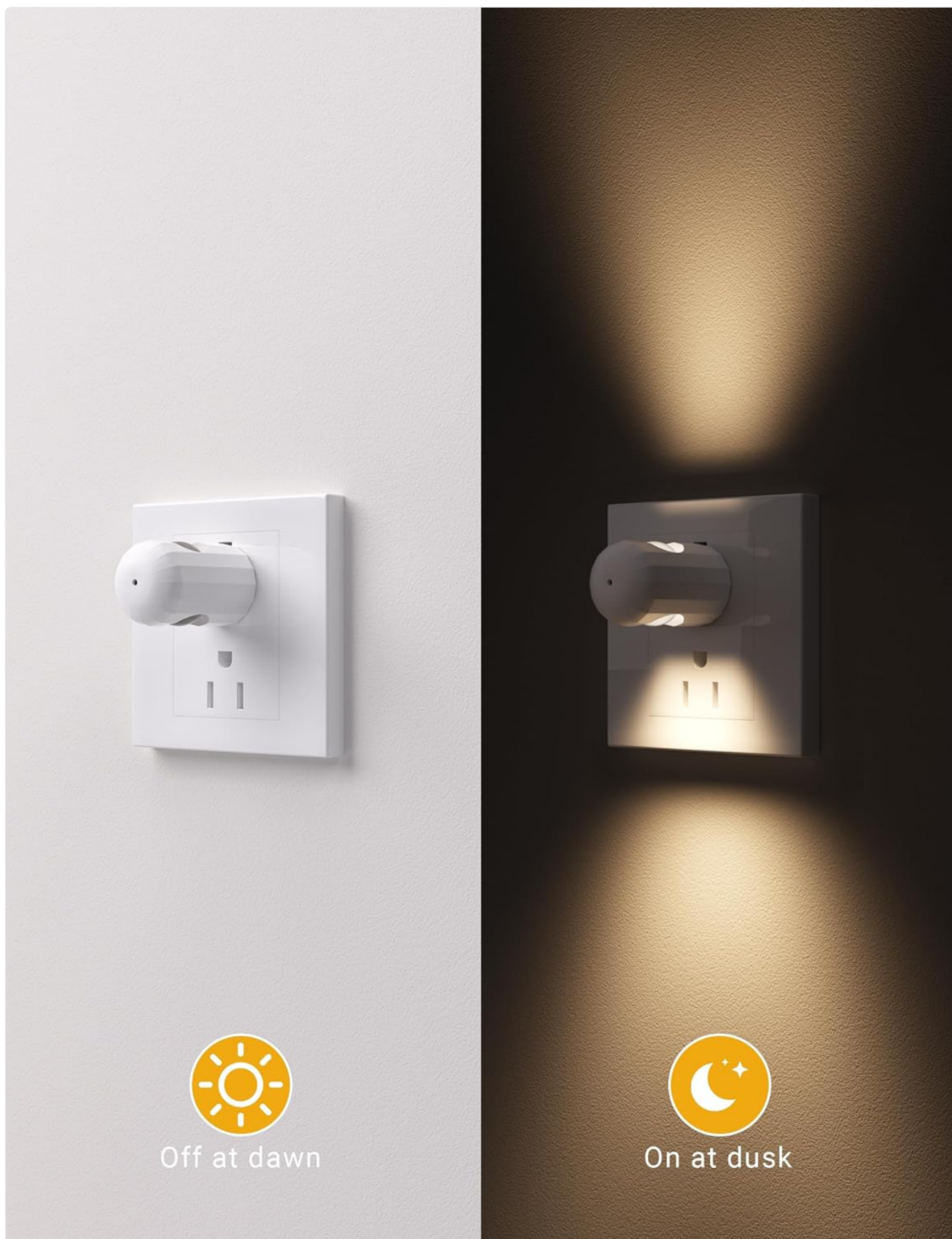
Image: The night light automatically turns off at dawn and turns on at dusk, demonstrating its intelligent light sensing capability.