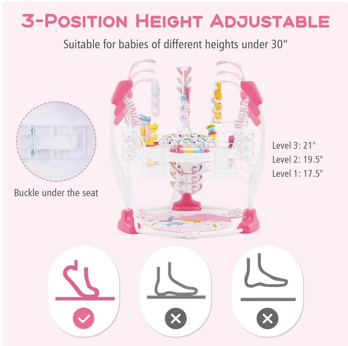
Image 6.1: Illustration of the three adjustable height settings (17.5", 19.5", 21") and the buckle mechanism for adjustment, ensuring proper leg positioning for the baby.

The activity center features 3 adjustable height positions. To adjust, locate the buckle under the play table. Press the buckle and slide the seat mechanism to the desired height level (17.5", 19.5", or 21" from the floor). Ensure both sides are adjusted evenly and securely locked into place.