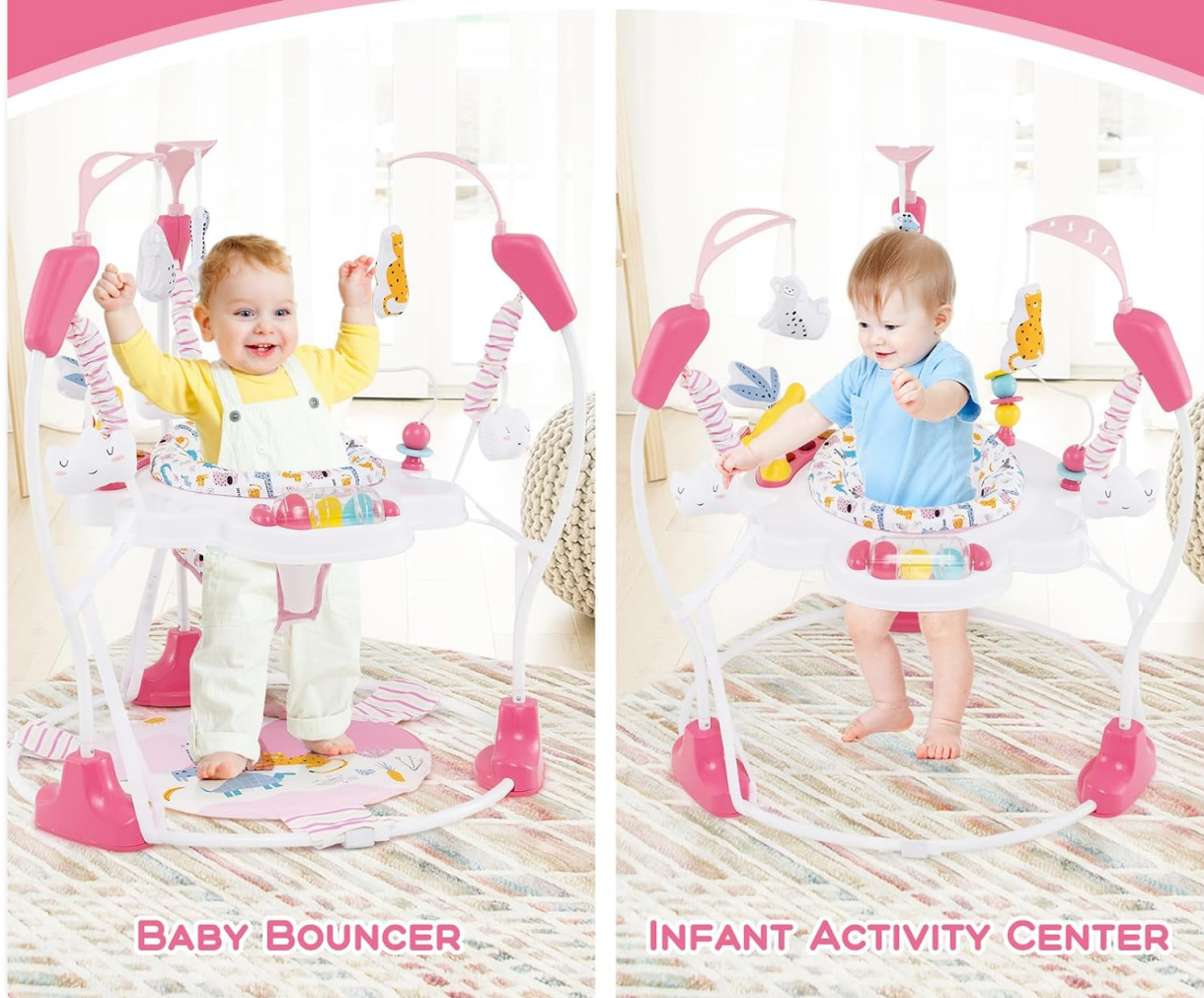
Image 4.1: The multi-functional design of the activity center, shown with two infants demonstrating its use as both a bouncer and an infant activity center.