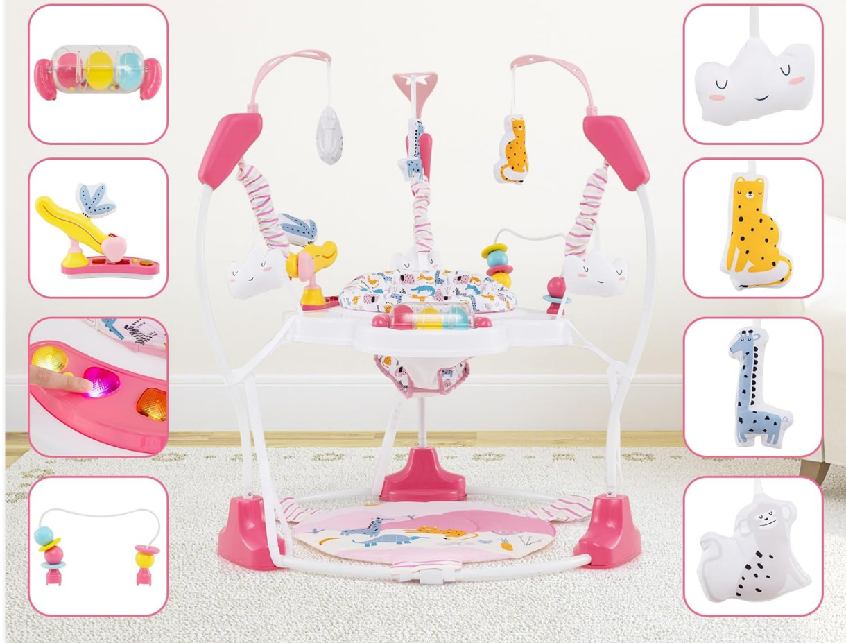
Image 6.3: A detailed view of the various interactive toys, including hanging plush animals, a music tray, and other sensory elements, designed to attract a baby's attention.

Safe & non-toxic materials, baby can play with peace of mind.