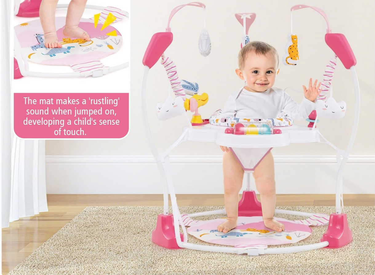
Image 6.4: A close-up of a baby's feet on the bouncy crinkly mat, illustrating how the mat produces a 'rustling' sound to engage the baby's sense of touch.

The mat makes a 'rustling' sound when jumped on, developing a child's sense of touch.