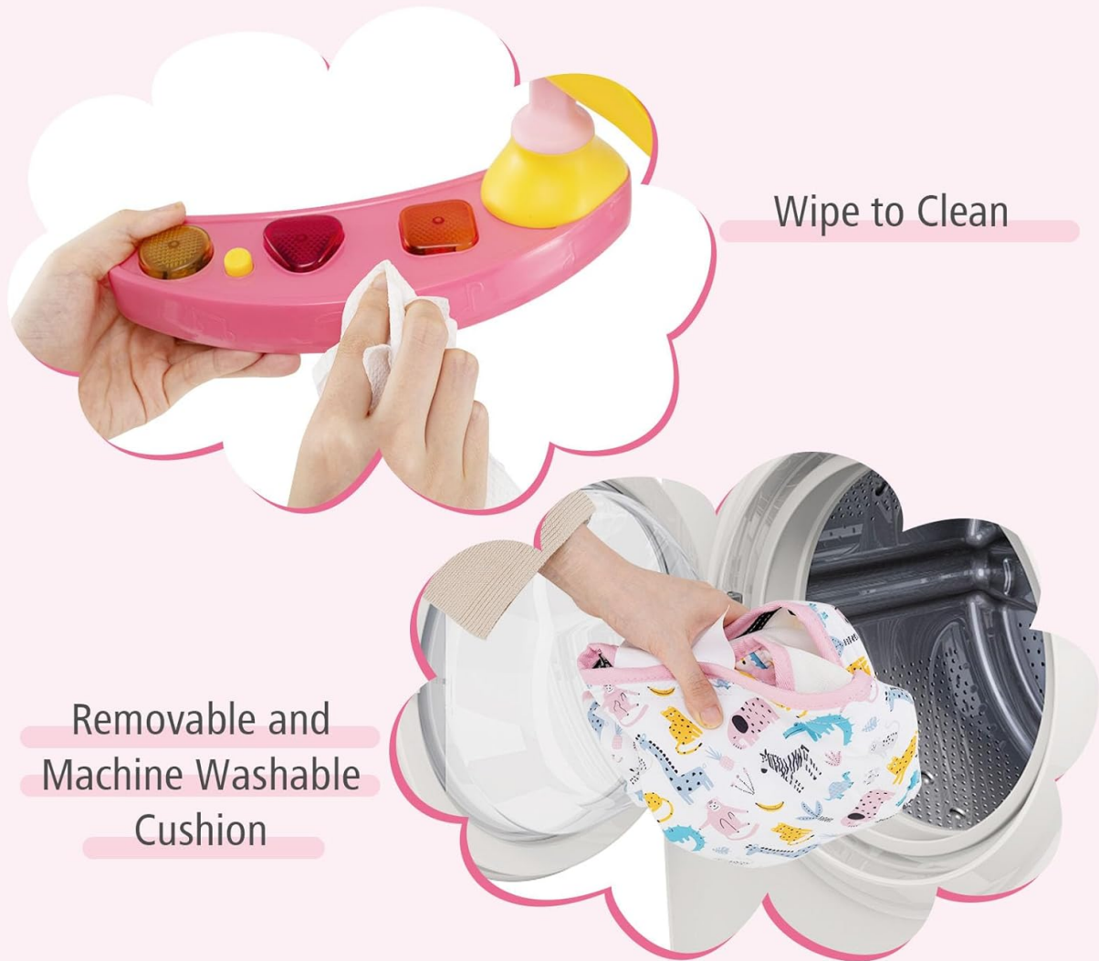
Image 7.1: Visual guide demonstrating how to wipe clean the activity table and machine wash the removable seat cushion, highlighting the ease of maintenance.