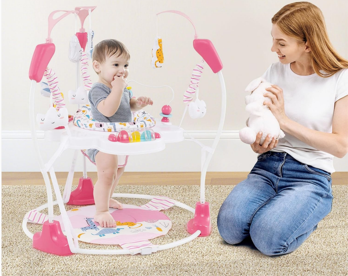
Image 1.2: A baby seated in the activity center, engaging with the toys, demonstrating how the product provides an engaging play space for infants.

Let the baby immerse in their own little world!