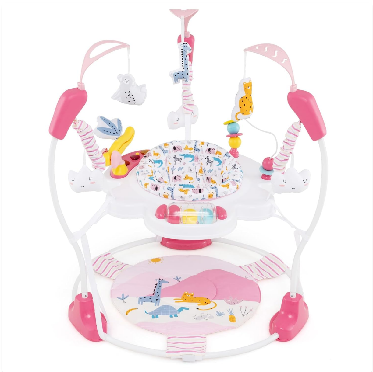
Image 1.1: The INFANS Baby Activity Center, featuring a pink color scheme, a central rotating seat, and multiple interactive toys suspended around the perimeter.

The activity center is designed to encourage hand-eye coordination and motor skills development through a variety of toys and a 360-degree rotating seat. It features adjustable heights to accommodate growing infants and is constructed with easy-to-clean materials for convenient maintenance.