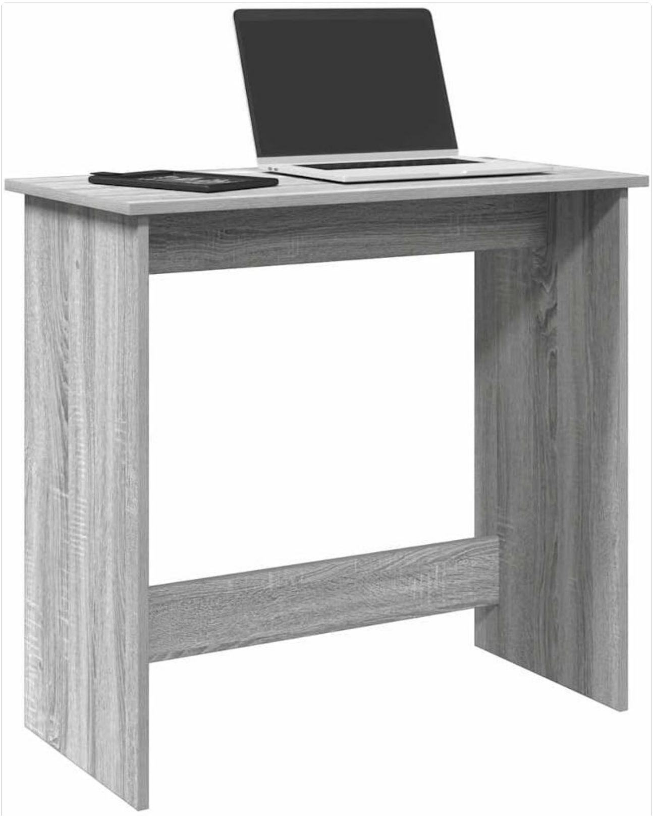
Image 7.1: Front view of the vidaXL desk, highlighting its simple and functional design.