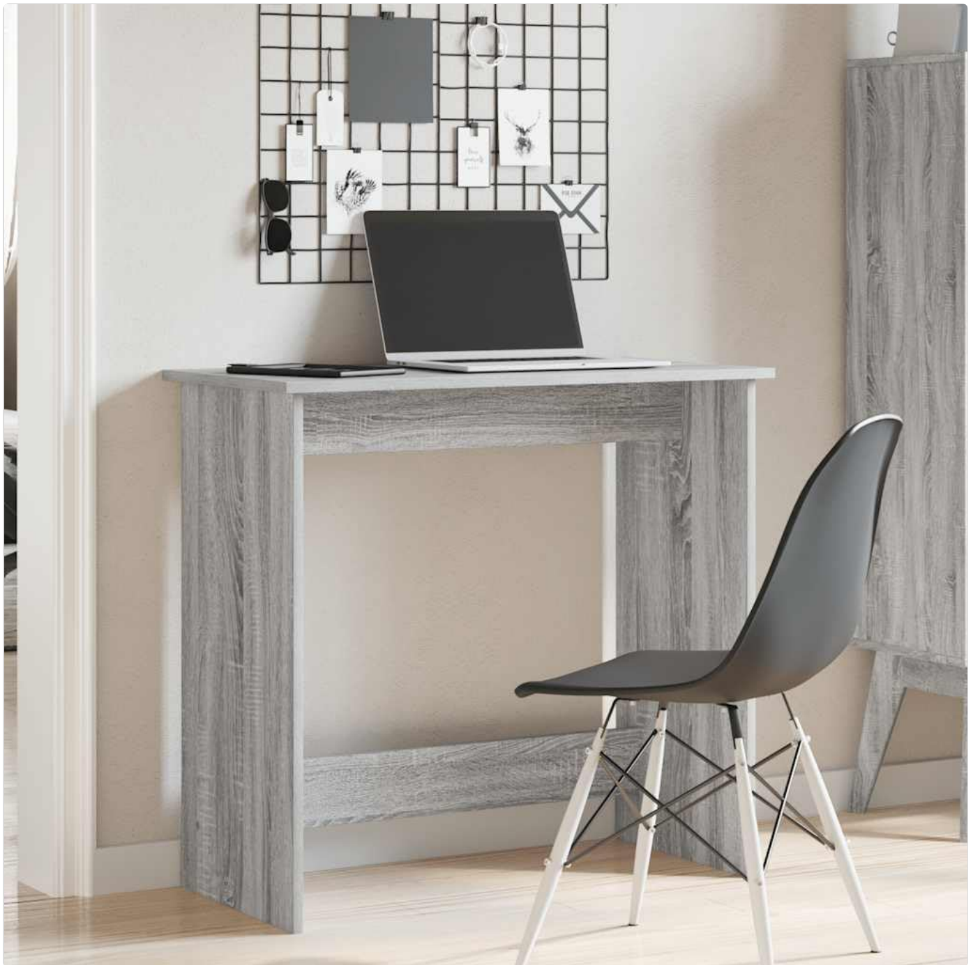
Image 1.1: The vidaXL Gray Sonoma Engineered Wood Rectangular Desk in a modern room setting, showcasing its design and functionality with a laptop placed on top.