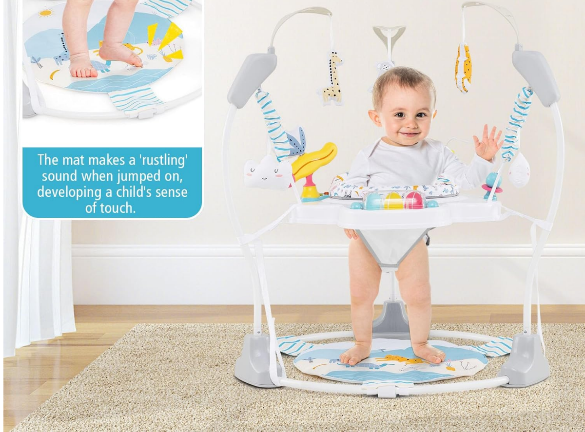
Image 5.2: The bouncy crinkly mat adds an auditory element to playtime.

The mat makes a 'rustling' sound when jumped on, developing a child's sense of touch.