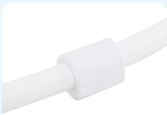
Premium Metal Frame