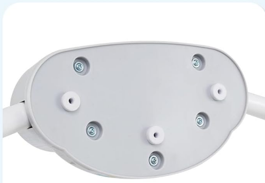
Anti-slip Bottom Pads