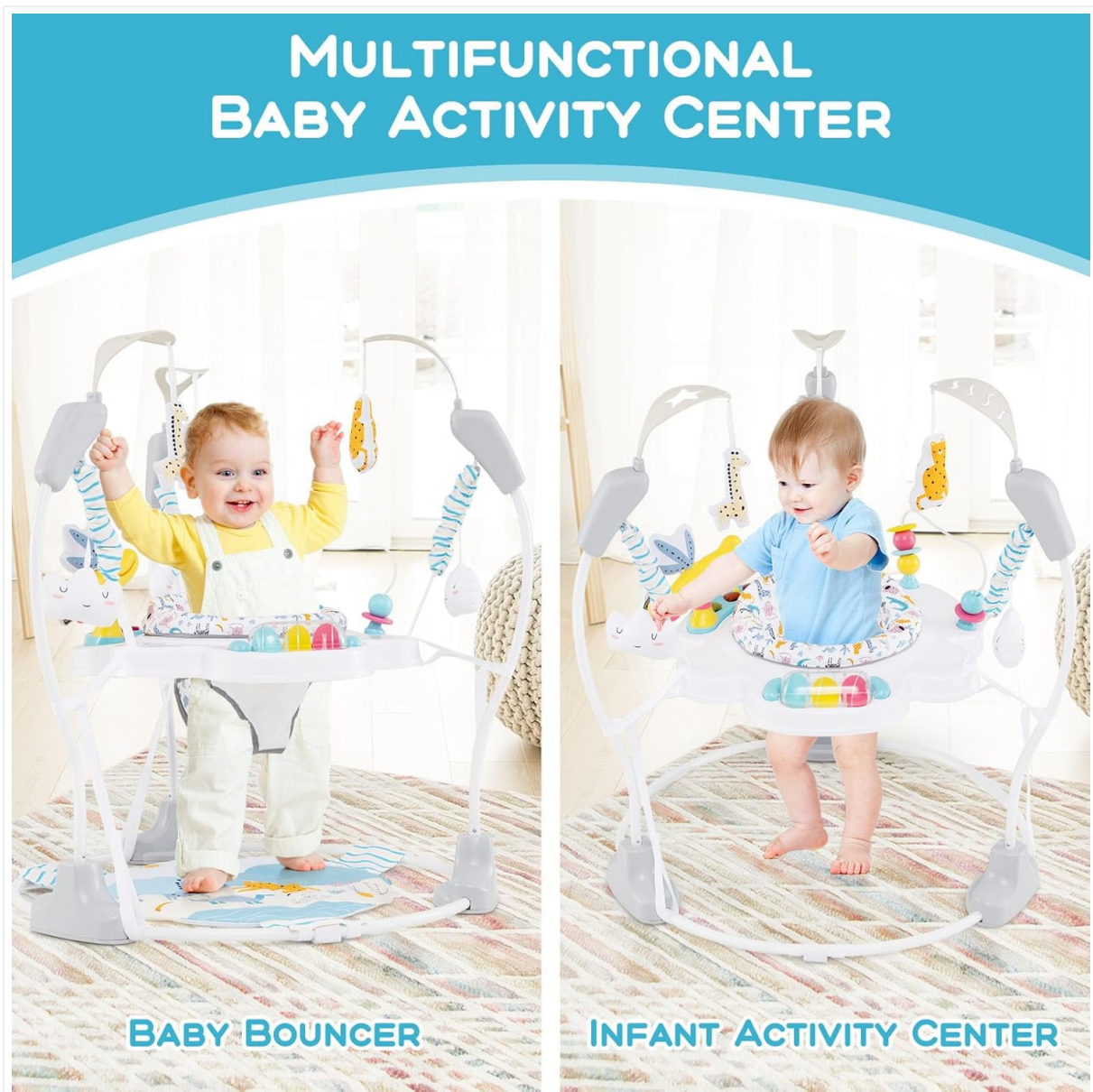
Image 4.1: The activity center can be used as a bouncer or an infant activity center.