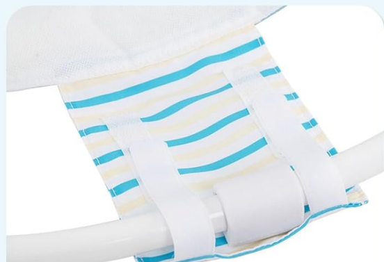
Hook & Loop Fasten