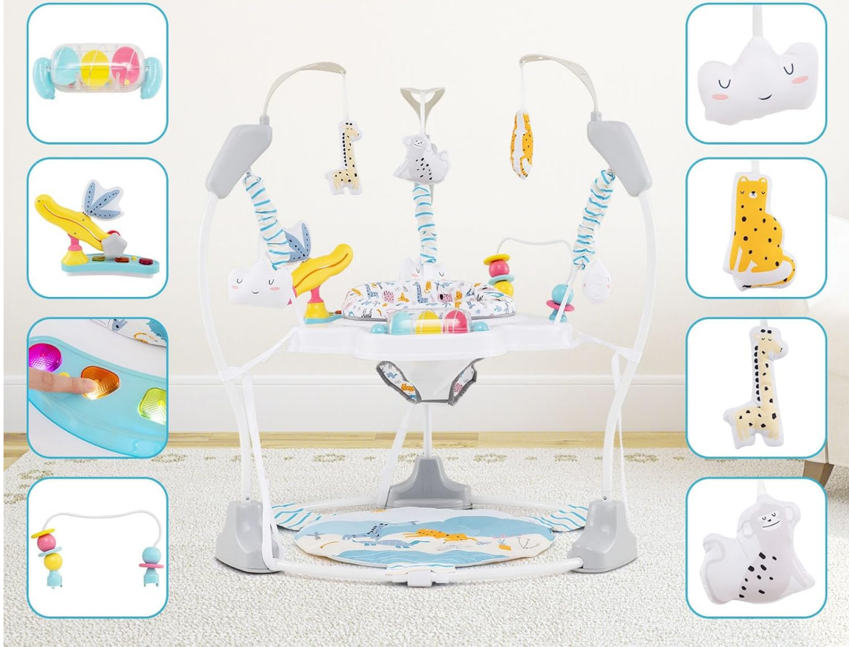
Image 2.1: Detail of the various interactive toys designed to engage infants.

Safe & non-toxic materials, baby can play with peace of mind.