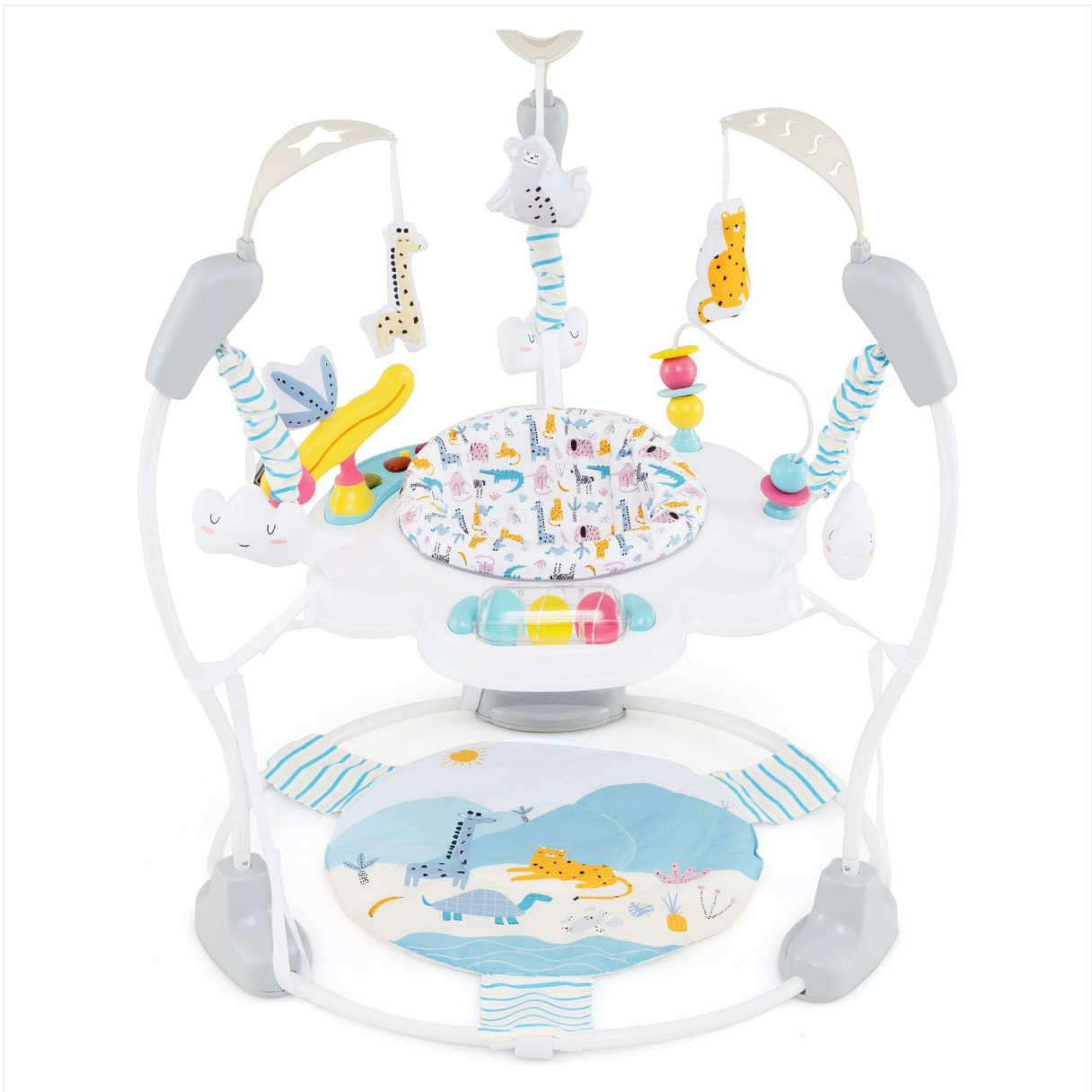
Image 1.1: The INFANS Baby Activity Center, providing a safe play space for infants.