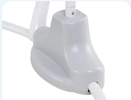
Stable Base Connectors