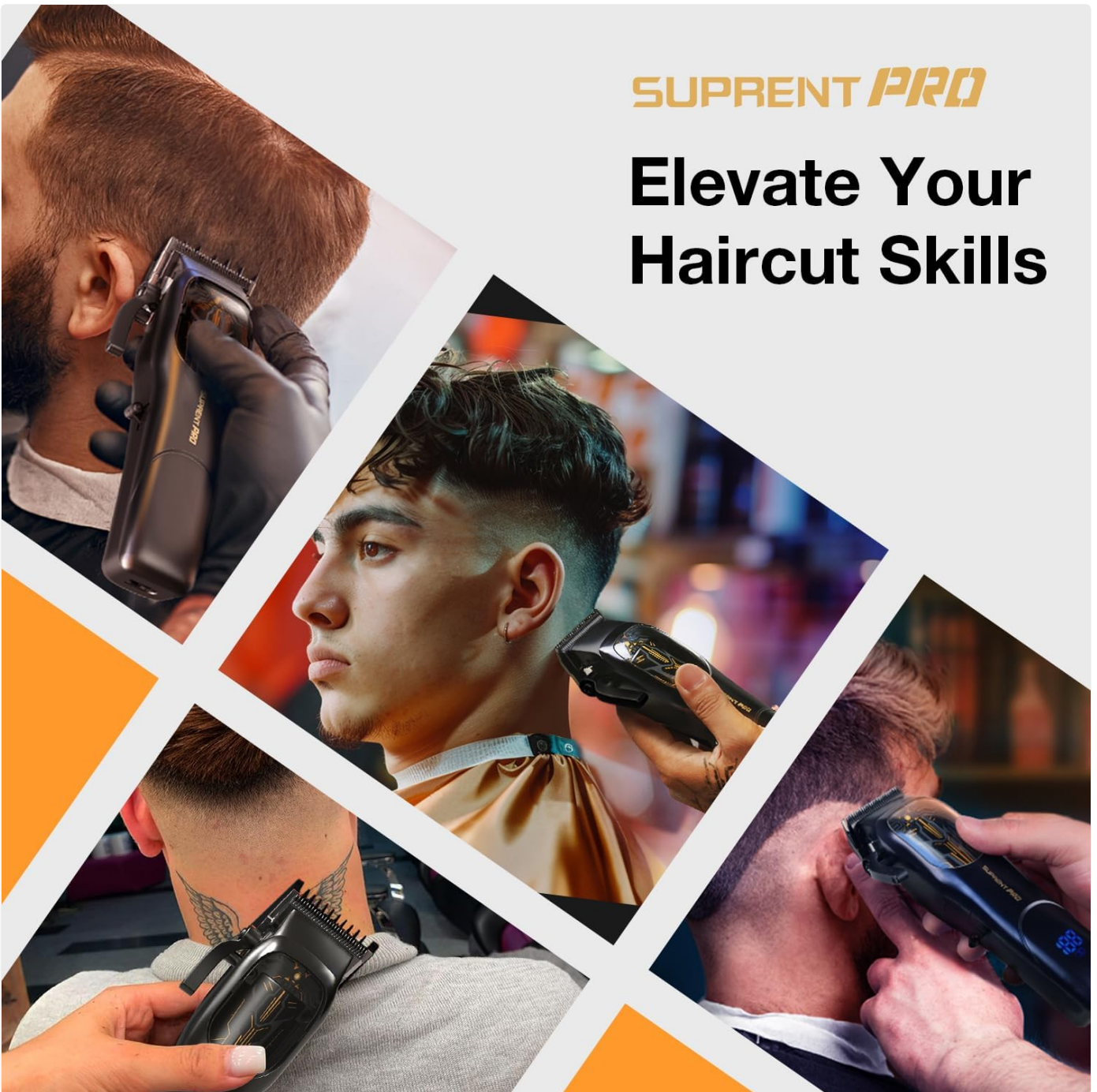
Figure 6.1: Examples of haircuts achieved with the clipper.

A collage showcasing different haircut styles and techniques, demonstrating how the SUPRENT PRO clippers can be used to elevate haircut skills and inspire creative styling.