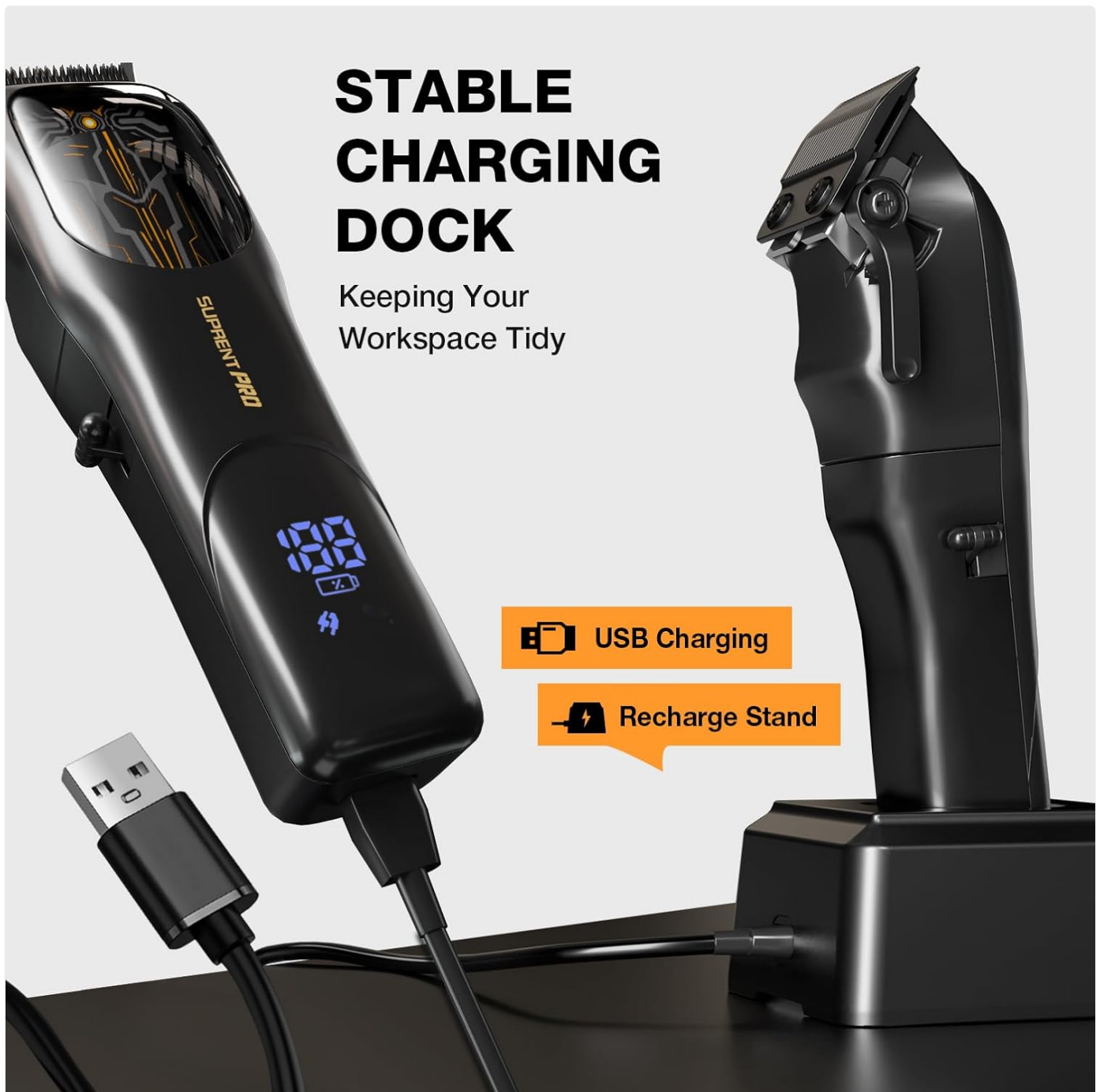
Figure 4.6: Stable charging dock and USB charging.

The image shows the SUPRENT PRO hair clipper docked in its stable charging base, with a USB cable connected, indicating both USB charging capability and the convenience of the recharge stand.