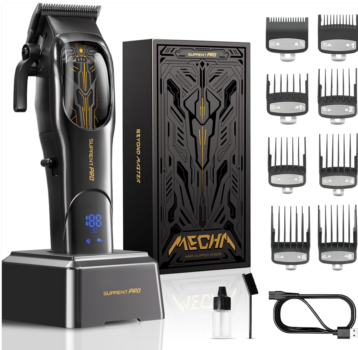
Figure 1.1: SUPRENT PRO Hair Clippers and included accessories.

The image displays the SUPRENT PRO Hair Clippers in black, positioned on its charging base. To the right, a black product box is visible, along with a set of eight metal guide combs, a small bottle of oil, a cleaning brush, and a USB charging cable.