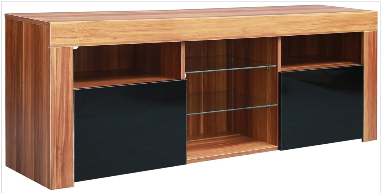
Figure 4.2: Assembled TV Stand Front View. This image displays the completed TV stand from the front, showcasing its brown matte body and high-gloss black cabinet doors.