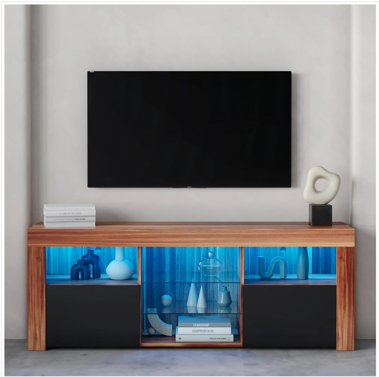
Figure 5.1: TV Stand with LED Lights Activated. This image shows the TV stand in a living room setting, with its internal compartments illuminated by the integrated LED lighting system, demonstrating its aesthetic appeal.