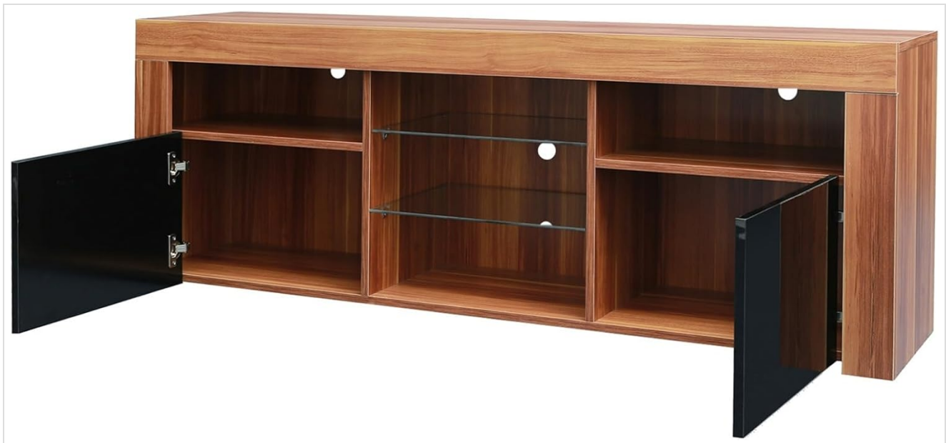
Figure 4.3: TV Stand with Doors Open. This view shows the TV stand with its two side cabinet doors open, providing a clear look at the internal storage spaces and the central glass shelves.