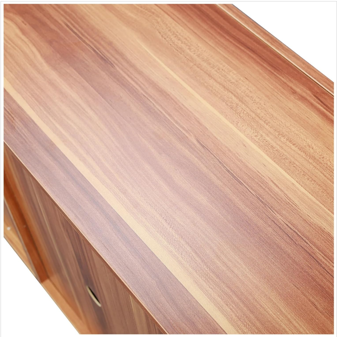
Figure 6.1: Wood Grain Detail. This close-up image highlights the texture and pattern of the wood grain finish on the TV stand's surface, demonstrating its aesthetic quality.