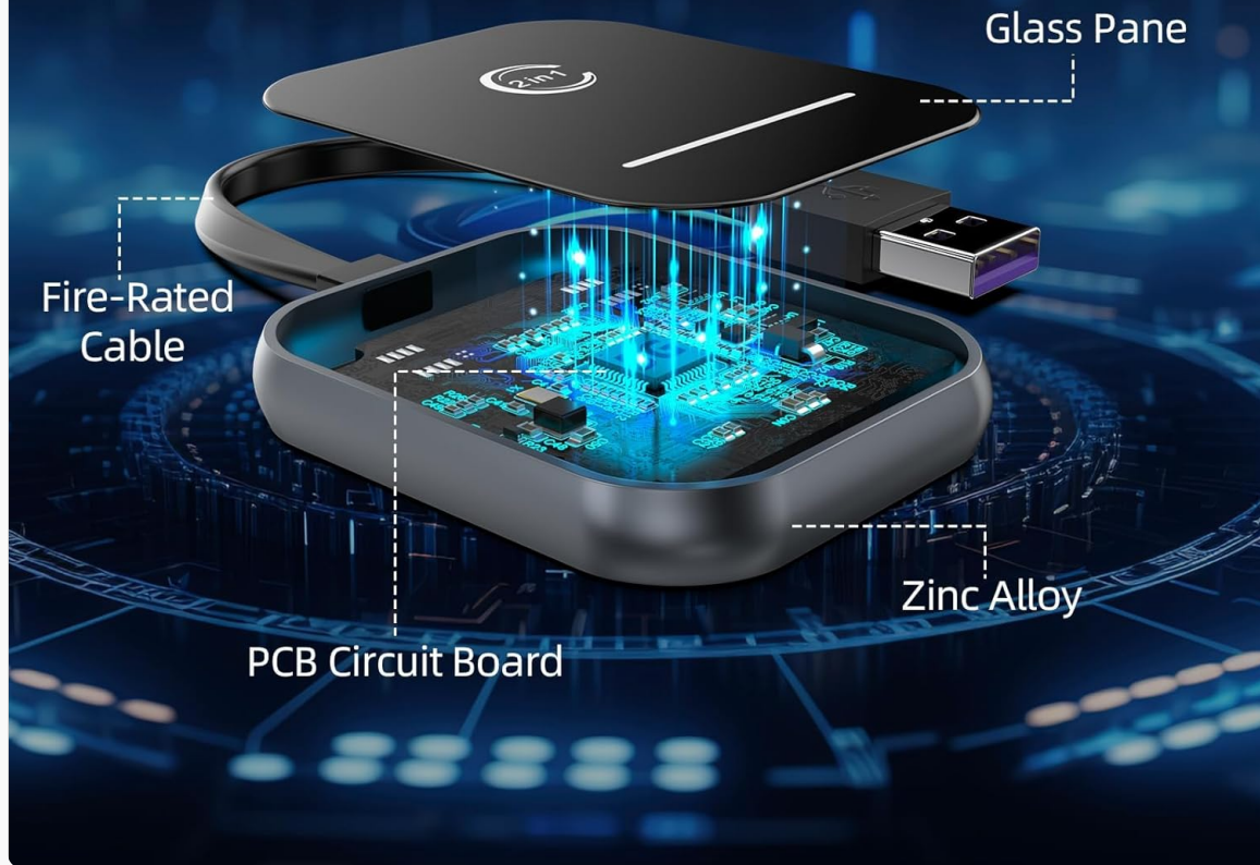
Image: An exploded view illustrating the internal construction of the adapter, highlighting its zinc alloy and tempered glass components designed for efficient heat dissipation.

Zinc alloy centre frame with glass panel underneath, can quickly export the internal heat, reduce the internal temperature