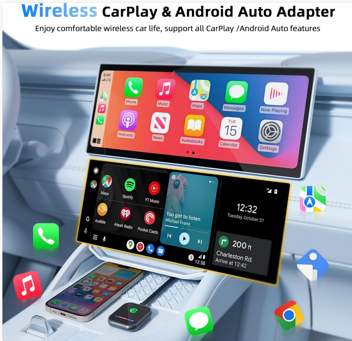
Image: The wireless CarPlay and Android Auto interfaces are shown on a car's display, highlighting the comfortable and feature-rich wireless experience.