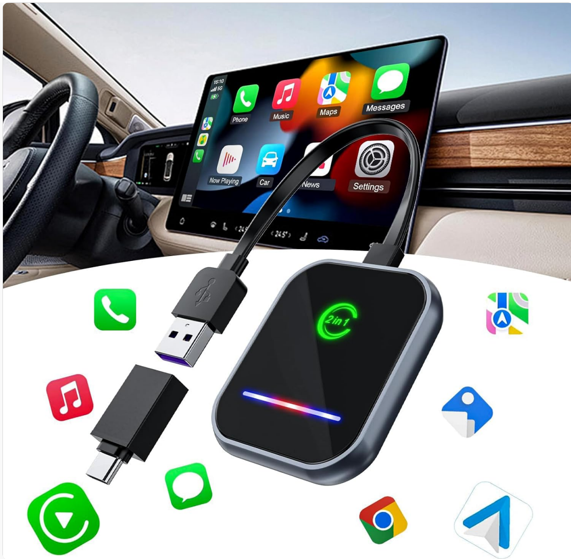
Image: The Quanlex 2-in-1 Wireless CarPlay and Android Auto Adapter, shown connected in a vehicle, enabling the wireless display of the CarPlay interface on the car's infotainment screen.