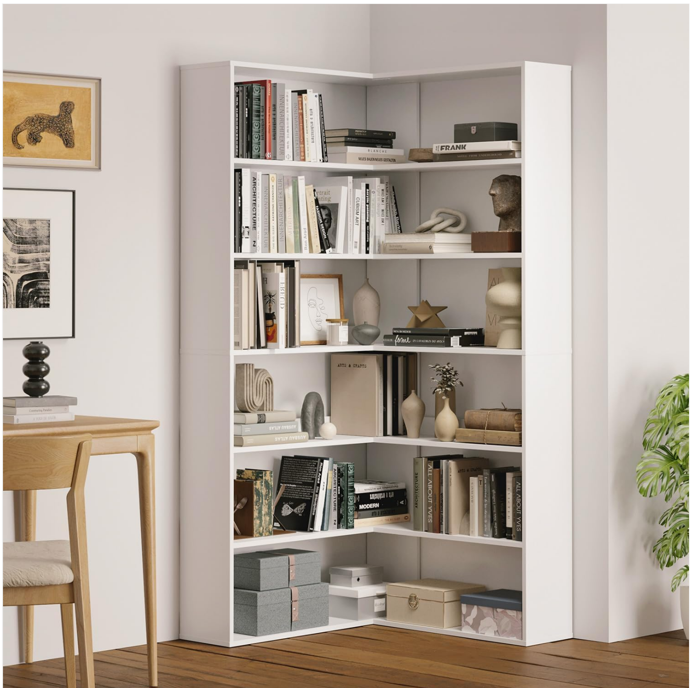
Figure 4.5: Bookshelf in a Home Office. Illustrates the bookshelf's utility in an office environment.