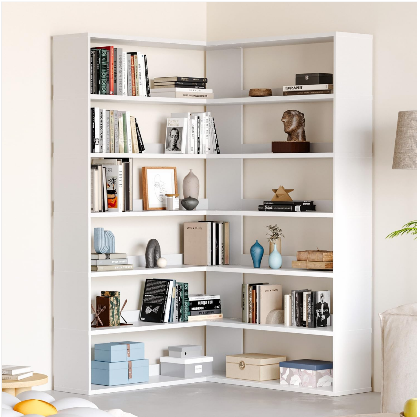
Figure 4.4: Bookshelf in a Living Room. Demonstrates typical usage in a residential setting.