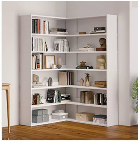
Figure 4.2: Baffle Shelf Detail. The integrated baffle helps secure items on the shelf.