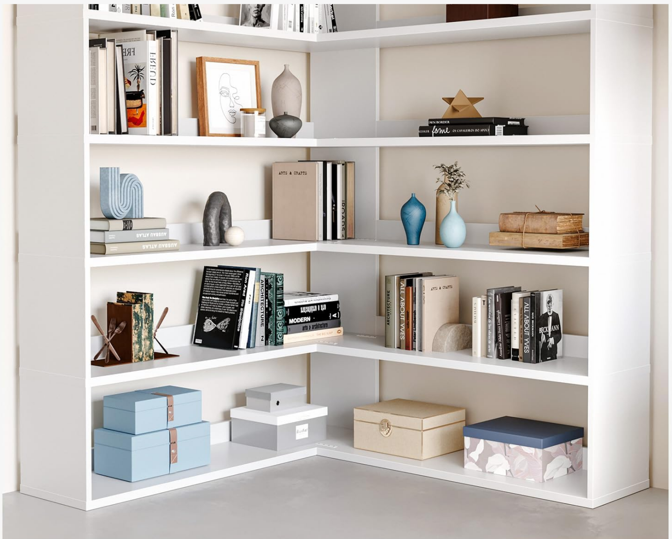
Figure 4.3: Heightened Base. The raised design protects items from floor dust and moisture.

The heightened base prevents items from collecting dust on the ground