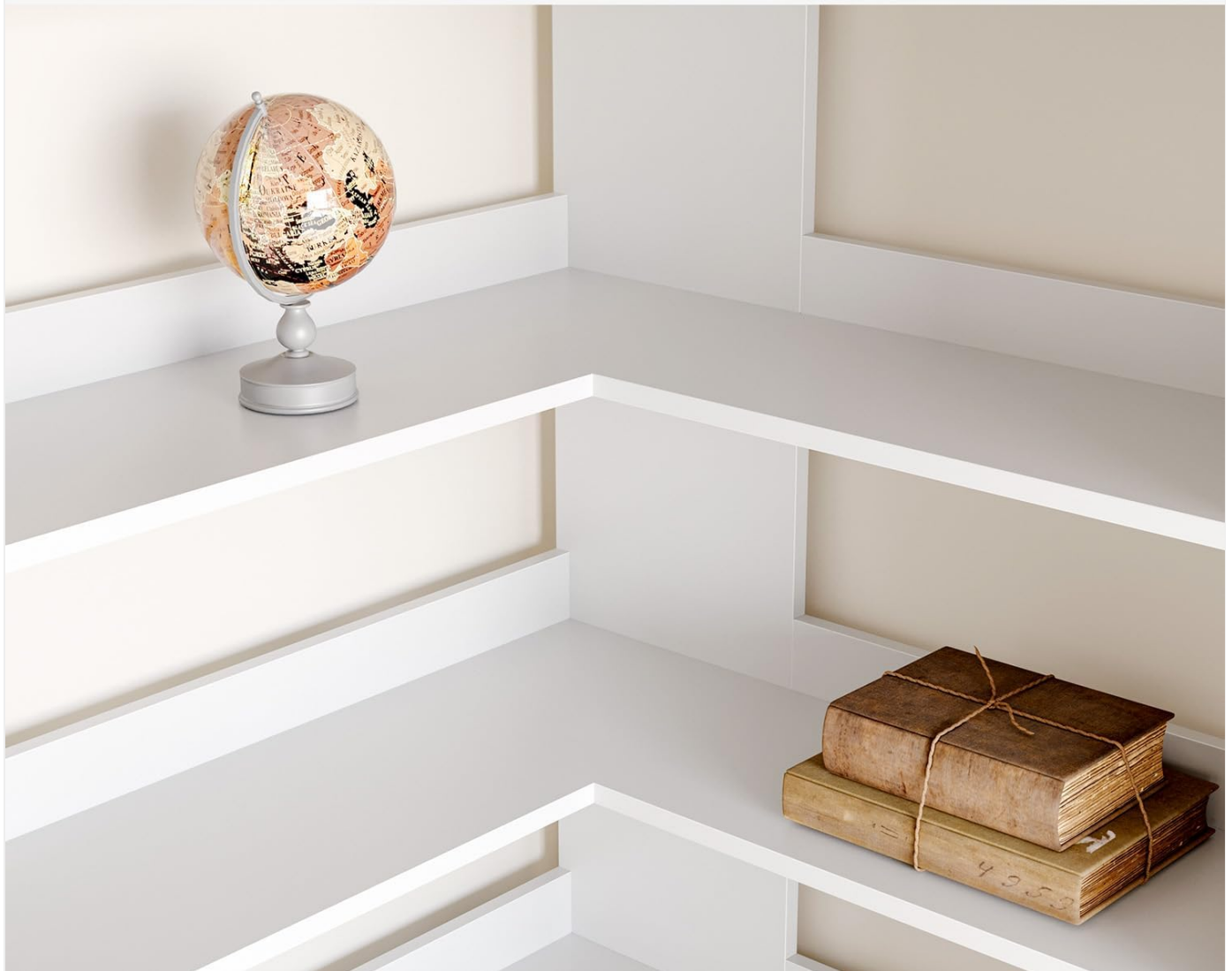
Figure 4.1: Corner Fit. The L-shaped design allows the bookshelf to fit perfectly into a 90-degree corner, maximizing space.