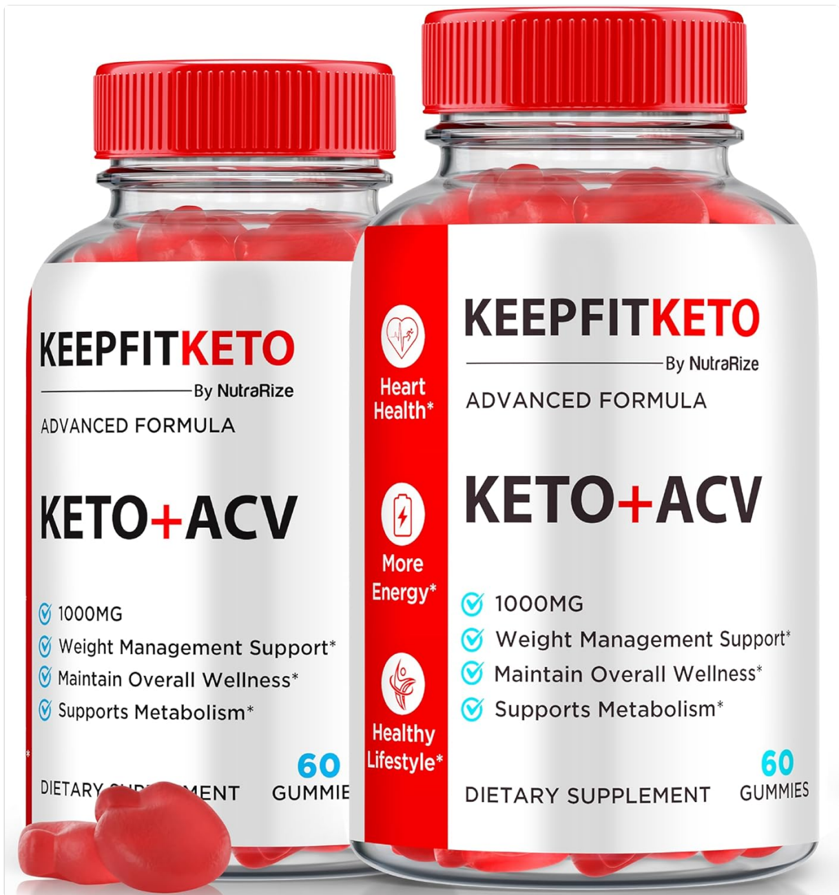
Image 1.1: Front view of NutraRize Keep Fit Keto ACV Gummies bottles.