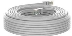
18M Network Cable