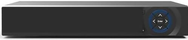
4K 8CH PoE NVR