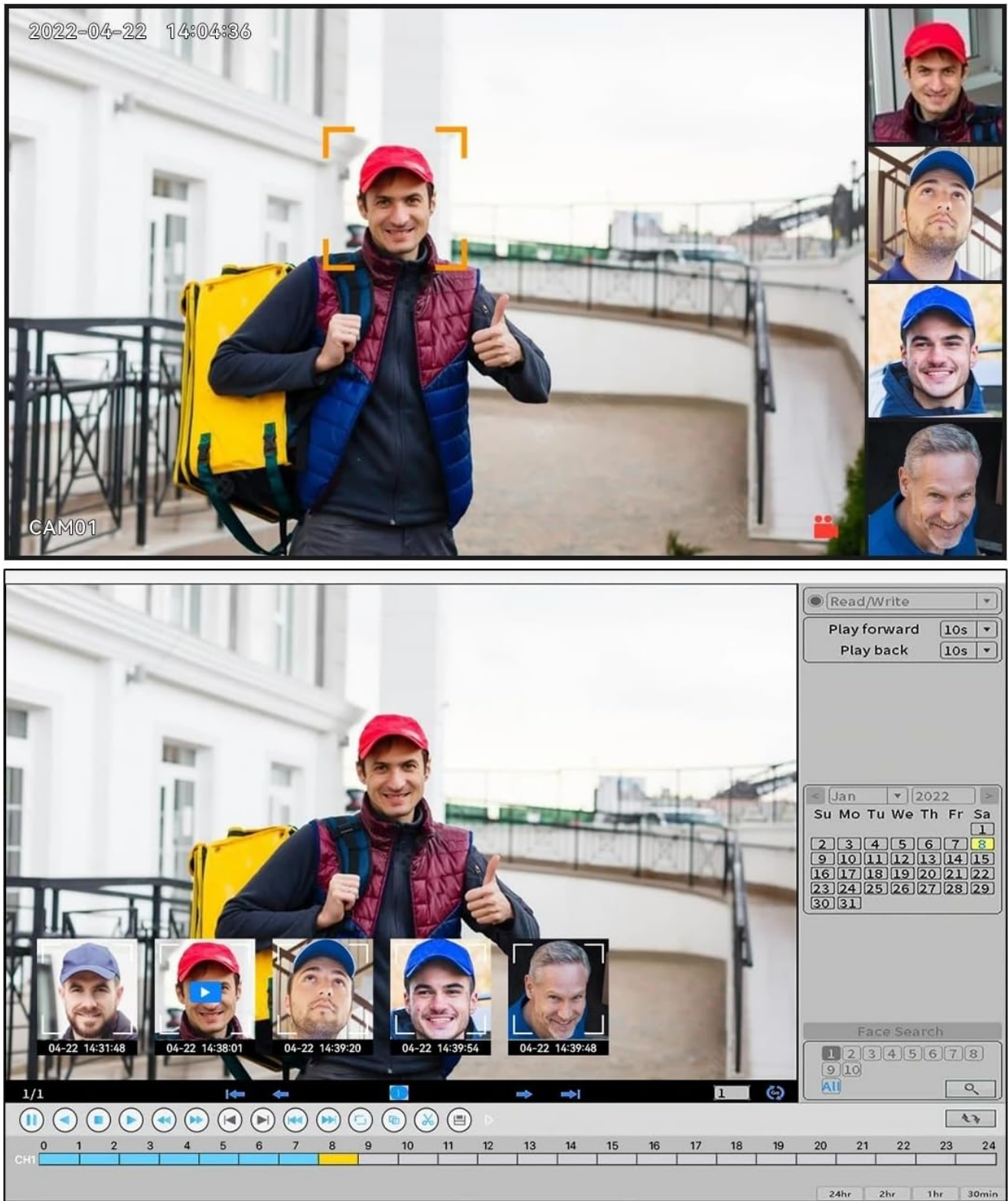
Image: A screenshot of the QDVOPHZA security system's interface demonstrating face detection and playback capabilities, showing a person detected and a timeline for reviewing recorded events.