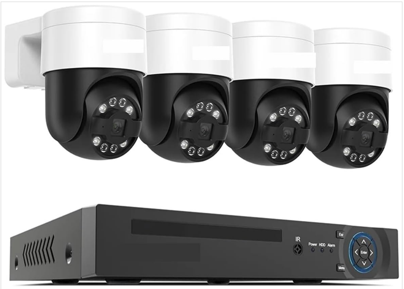
Image: Overview of the QDVOPHZA 8Ch 4K 8MP CCTV Security Camera System, showing the NVR unit, multiple PTZ cameras, and network cables.