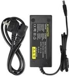
NVR Power Adapter