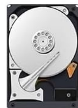
Optional Hard Disk

Image: A visual representation of the QDVOPHZA security system's package contents, including the NVR, PTZ cameras, power adapter, remote, mouse, quick start guide, surveillance sticker, network cables, weatherproof lids, and screw pack.